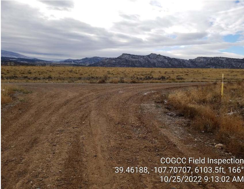
Photo #2 – Overview of reported Spill/Release location, from access road on other side of drainage.