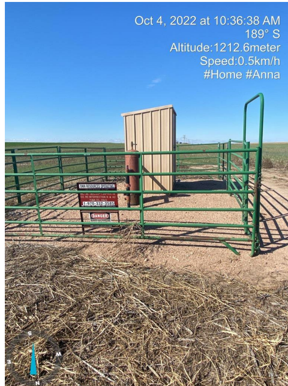
3. Meter run