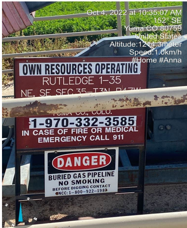
1. Lease sign