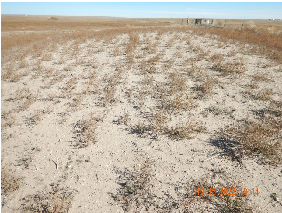
Photo 7. Photo taken from the southeastern interim reclamation area, facing Northeast. Photo illustrates bare ground with some Kochia.