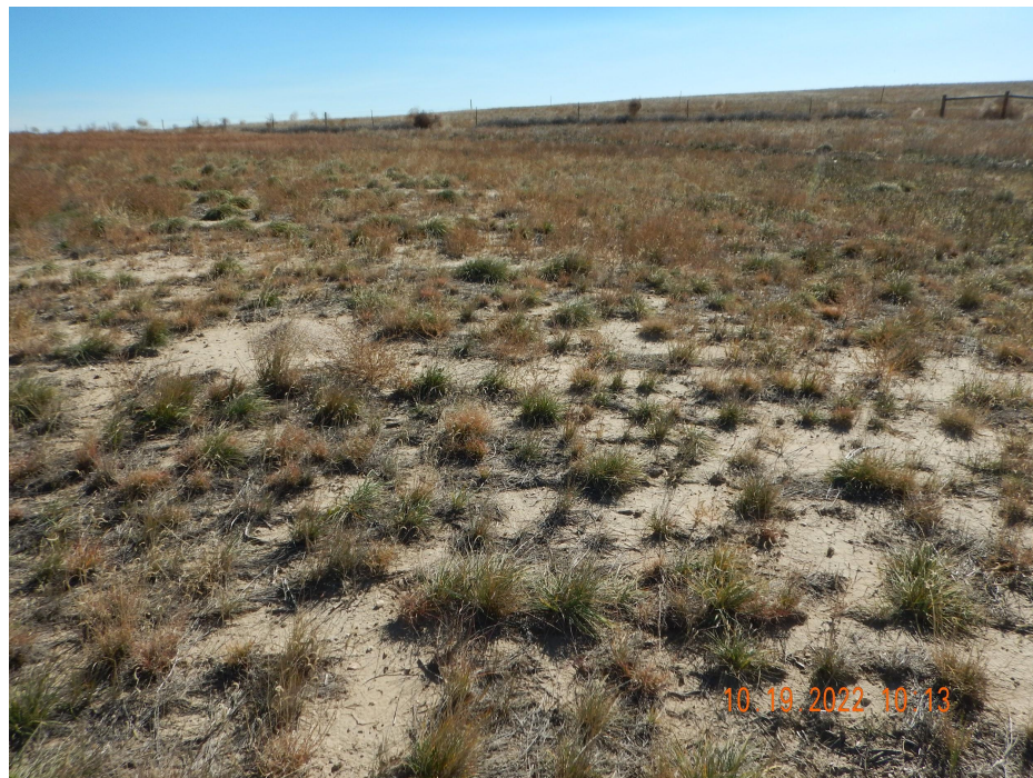
Photo 4. Photo taken from the south/southeastern interim reclamation area, facing South. Photo illustrates the establishment of mostly introduced grass species with some natives.