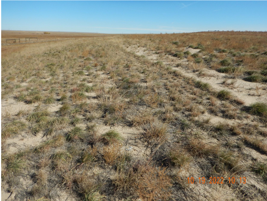
Photo 5. Photo taken from the south/southeastern interim reclamation area, facing Northeast. See comments under Photo 4.