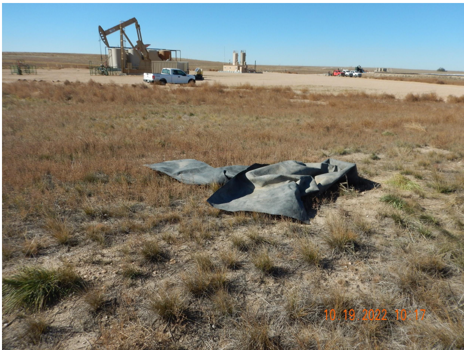
Photo 9. Photo taken from the eastern interim reclamation area, facing West. Photo illustrates trash/debris from the pit liner.