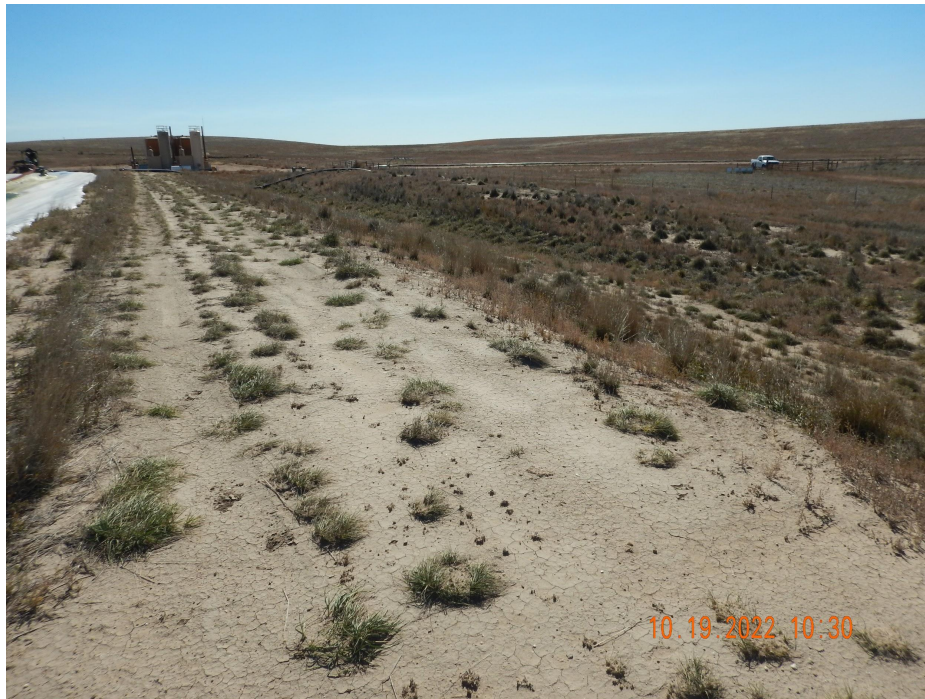
Photo 11. Photo taken from the southern pit, facing Southeast. Photo illustrates the establishment of mostly introduced grass species with some natives and bare ground.