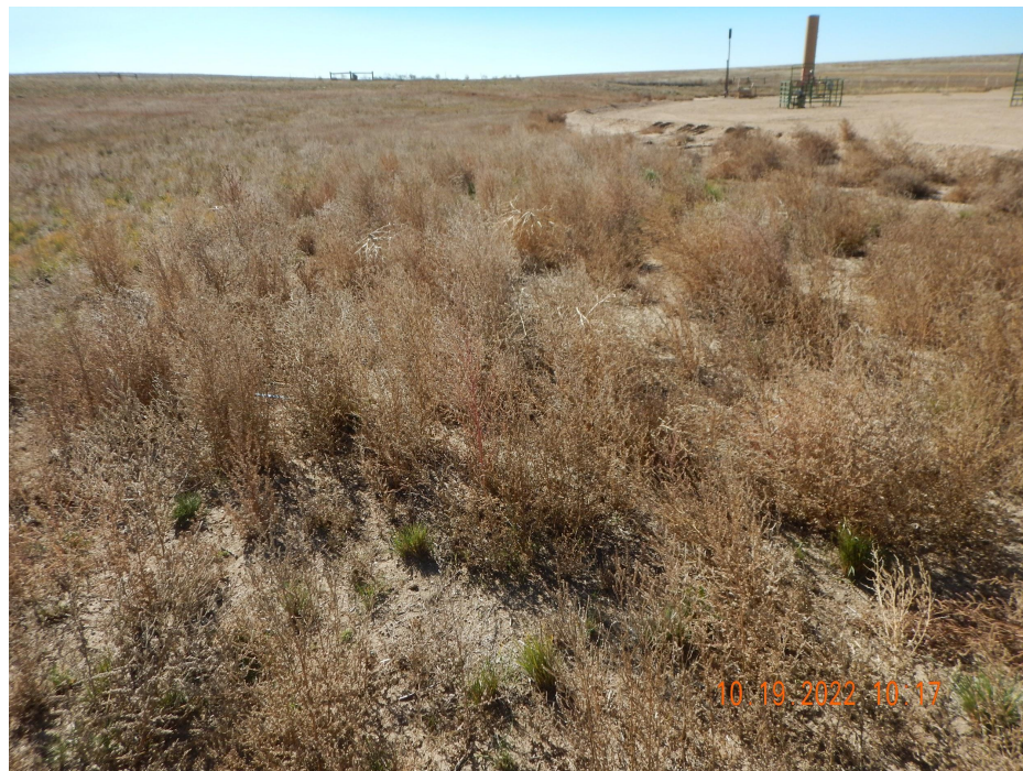
Photo 10. Photo taken from the eastern interim reclamation area, facing South. See comments under Photo 2.