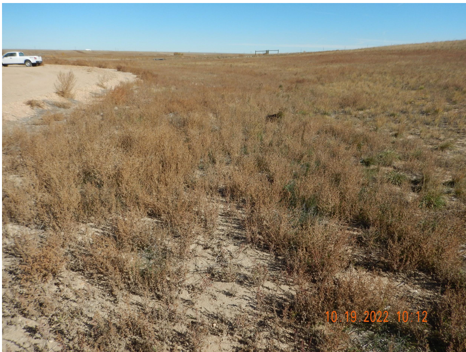
Photo 3. Photo taken from the southwestern interim reclamation area, facing Northeast. See comments under Photo 1.