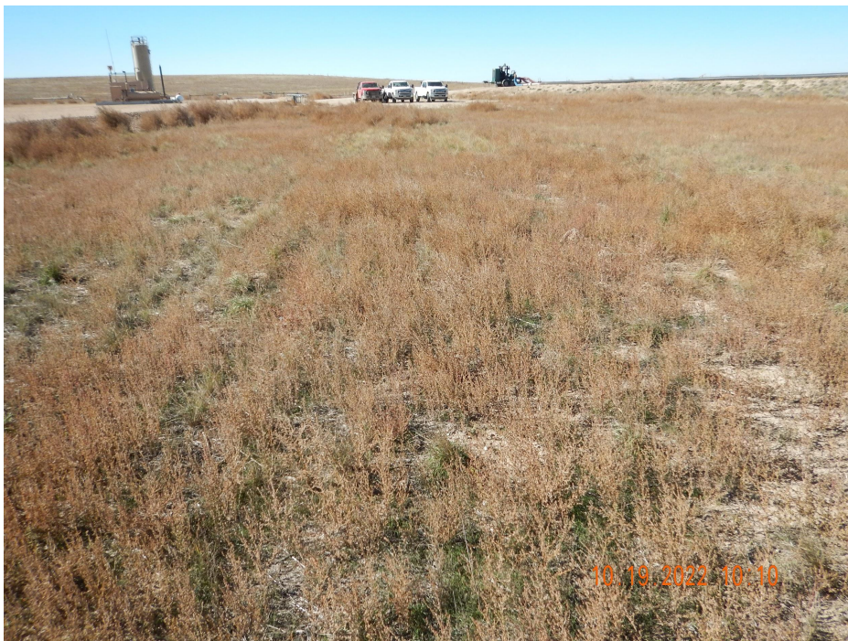
Photo 1. Photo taken from the northern interim reclamation area, facing Southwest. Photo illustrates the establishment of annual, weedy Kochia with mostly introduced grass species with some natives.