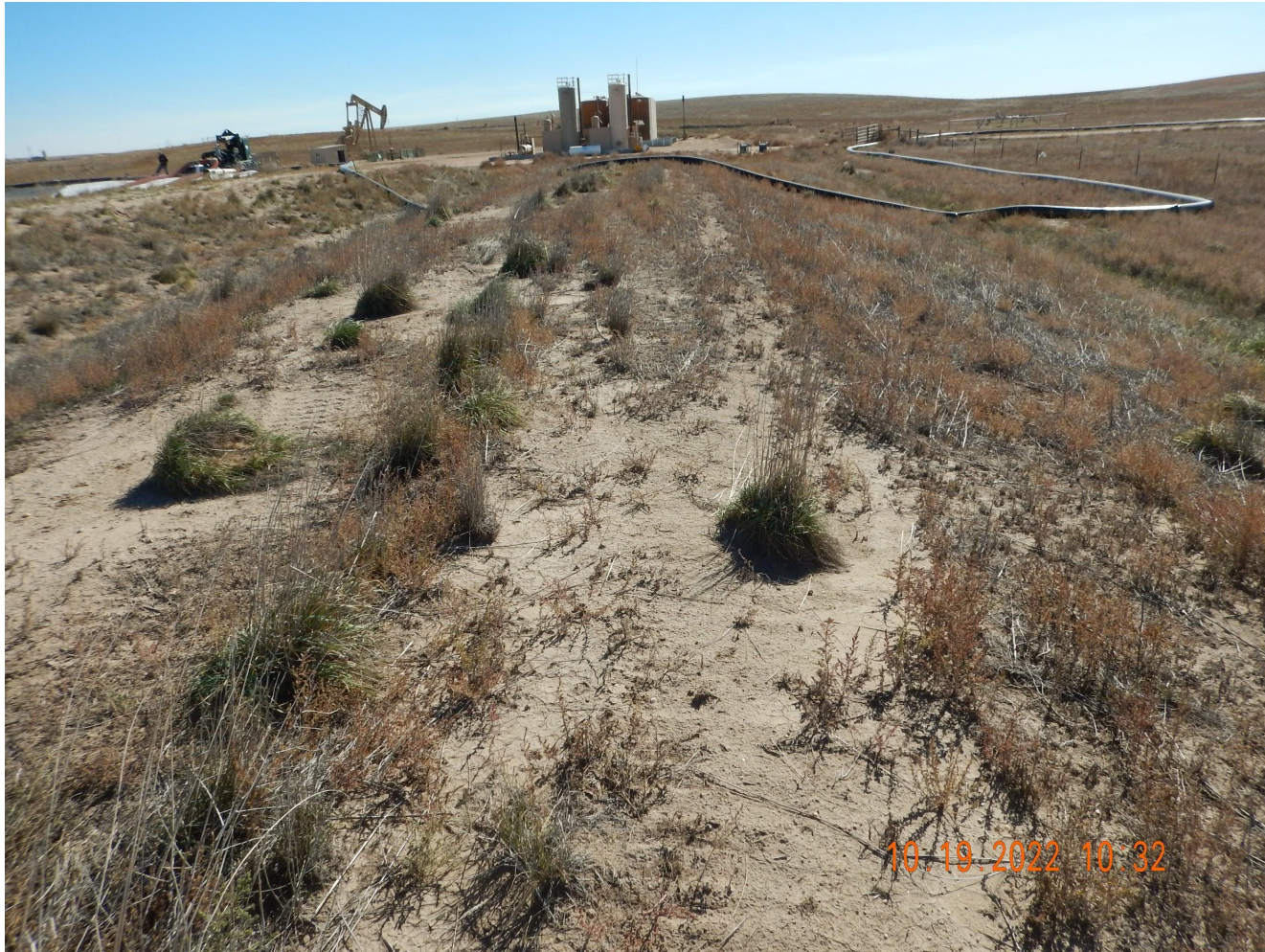
Photo 13. Photo taken from the pit topsoil stockpile, facing Southeast. Photo illustrates the establishment of mostly introduced grass species and Kochia.