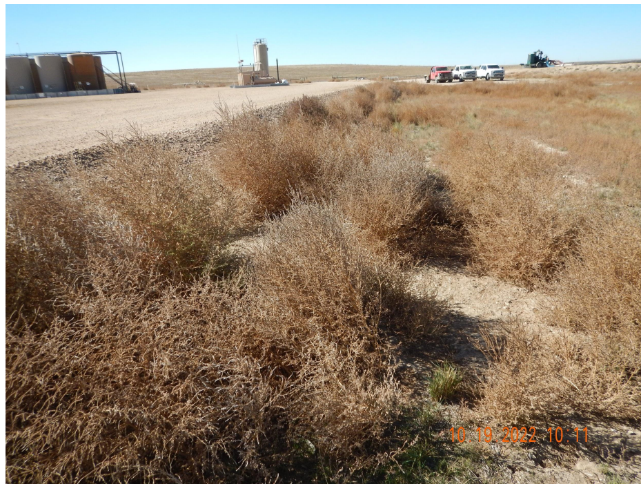
Photo 2. Photo taken from the northern interim reclamation area, facing Southwest. Photo illustrates unmanaged Kochia.