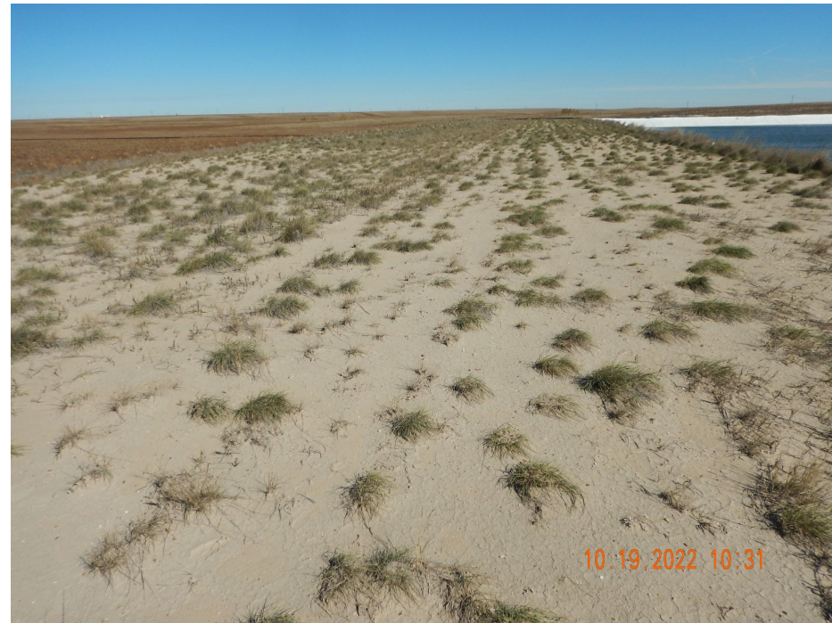
Photo 12. Photo taken from the southern pit, facing Northeast. See comments under Photo 11.