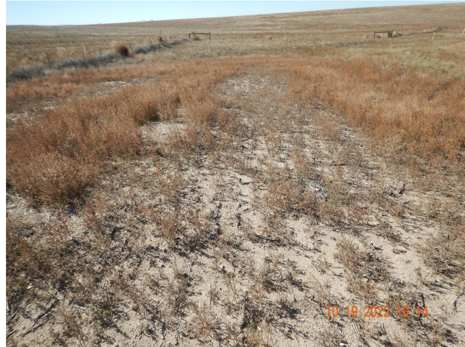
Photo 6. Photo taken from the south/southeastern interim reclamation area, facing Southwest. Photo illustrates an area of annual, weedy Kochia establishment.