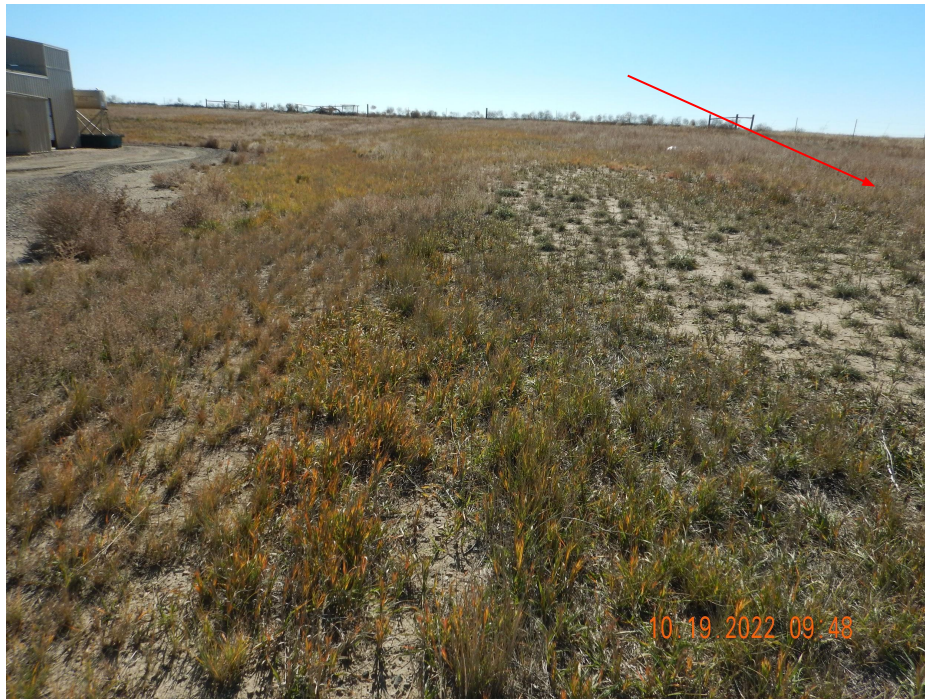
Photo 1. Photo taken from the southwestern interim reclamation area, facing Southeast. Photo illustrates the establishment of mixed native and introduced grass mix. Introduced grass species are establishing more than natives.