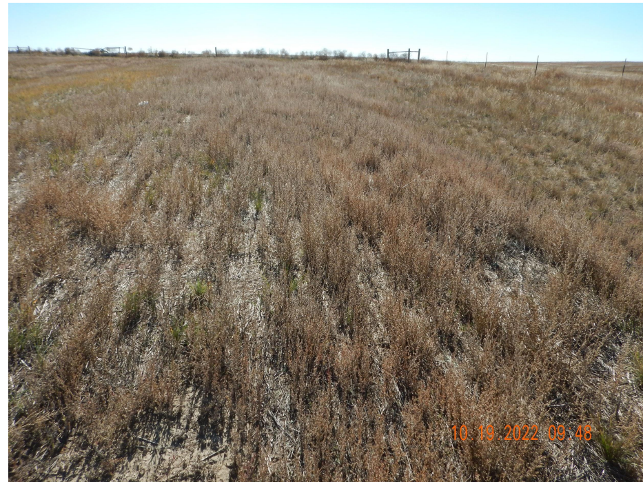
Photo 2. Photo taken from the southwestern interim reclamation area, facing Southeast. Photo illustrates an area of annual, weedy Kochia establishment.