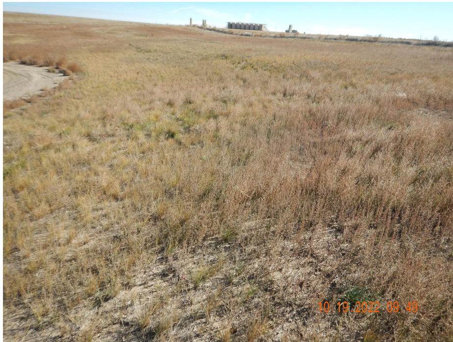
Photo 3. Photo taken from the southwestern interim reclamation area, facing Northeast. Photo illustrates a mix of introduced/native grasses with Kochia.