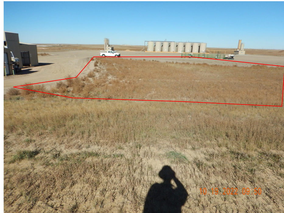
Photo 4. Photo taken from the southwestern interim reclamation area, facing Northwest. See comments under Photo 3.

The red polygon illustrates an area of Kochia establishment.