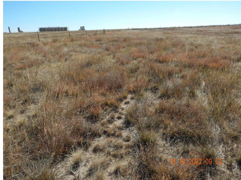
Photo 10. Reference photo taken from the northeastern interim reclamation area, facing Southeast. See comments under Photo 9.