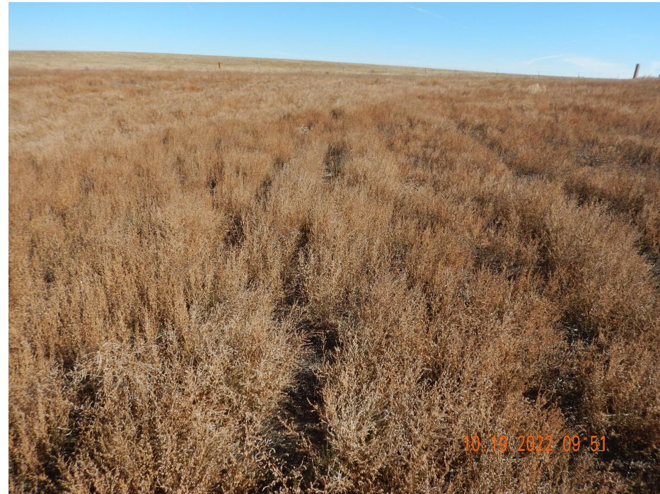
Photo 6. Photo taken from the southeastern interim reclamation area, facing Northeast. See comments under Photo 2.