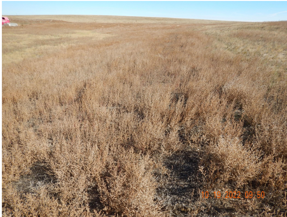
Photo 5. Photo taken from the southern interim reclamation area, facing Northeast. See comments under Photo 2.