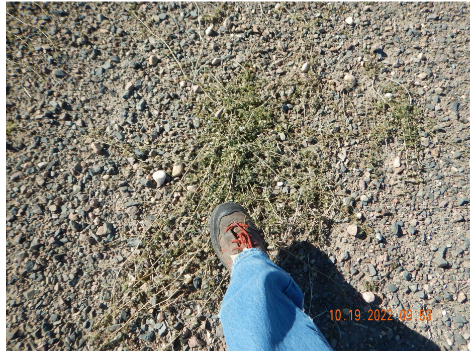
Photo 8. Photo taken from the well pad area. Photo illustrates unmanaged Puncturevine, a List C Colorado noxious weed.