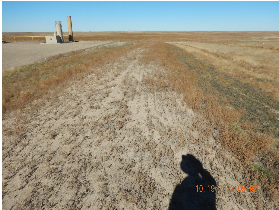
Photo 7. Photo taken from the southeastern interim reclamation area, facing Northwest. Photo illustrates a topsoil stockpile with annual, weedy Kochia establishment.