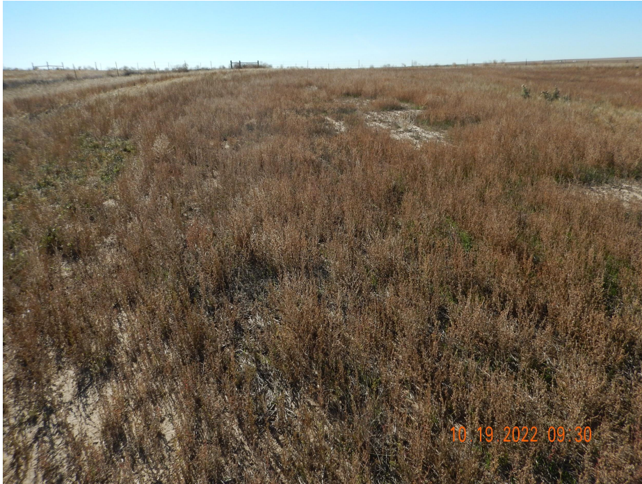
Photo 1. Photo taken from the southeastern interim reclamation area, facing South. Photo illustrates unmanaged annual, weedy Kochia vegetation and bare ground with some desirable vegetation establishment. Note- introduced grass species were observed which is not reflective of reference area vegetation.