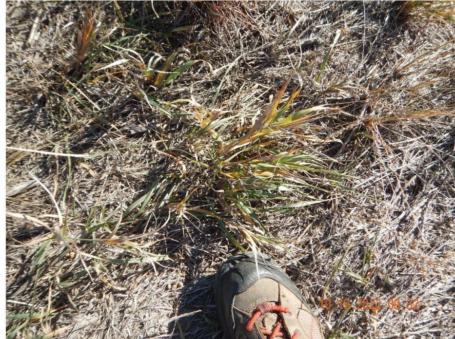
Photo 4. Close up photo taken from within the interim reclamation area. Photo illustrates Smooth brome, introduced grass species, that was seeded as part of interim reclamation.