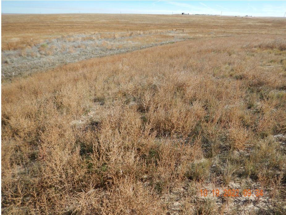
Photo 7. Photo taken from the northeastern interim reclamation area, facing Northeast. Photo illustrates similar vegetative condition to Photo 6, except with a higher density of Kochia.