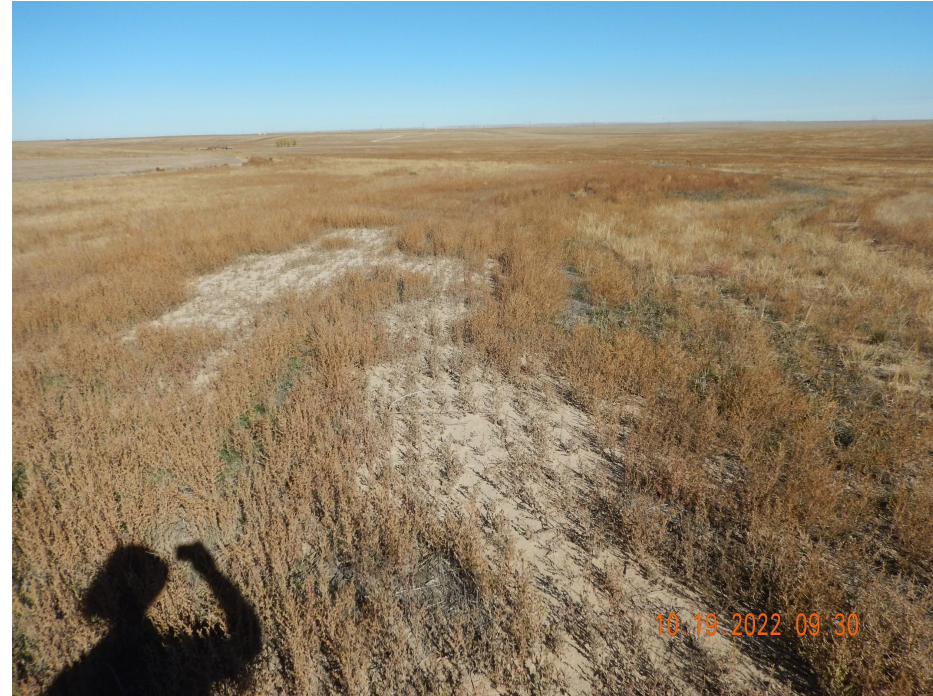
Photo 2. Photo taken from the southeastern interim reclamation area, facing North. See comments under Photo 1.

Note- it is unclear whether there is topsoil stockpile along the eastern location or whether the location has been properly contoured.