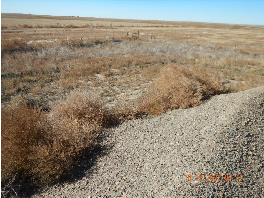
Photo 9. Photo taken from the southwestern interim reclamation area, facing Southwest. Photo illustrates unmanaged Kochia along the southern fill slope.