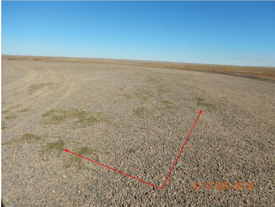
Photo 11. Photo taken from the northeastern interim reclamation area, facing North. Photo illustrates unmanaged Puncturevine, a List C Colorado noxious weed. Also, the photo illustrates areas not needed for production operations along the northeastern location can be further reduced. Refer to Photo 13 for more information.