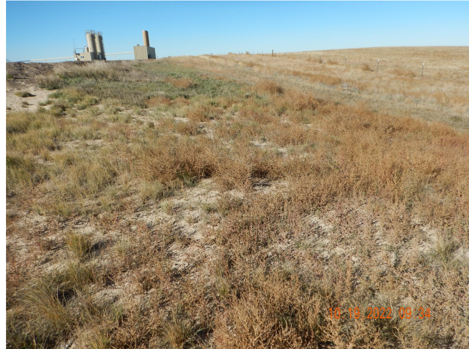
Photo 8. Photo taken from the northeastern interim reclamation area, facing West. See comments under Photo 6.