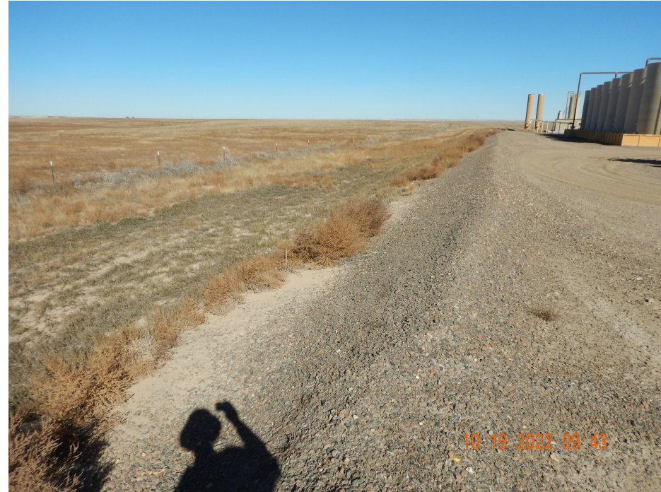
Photo 10. Photo taken from the southwestern interim reclamation area, facing North. Photo illustrates unmanaged Kochia along the base of the western fill slope.