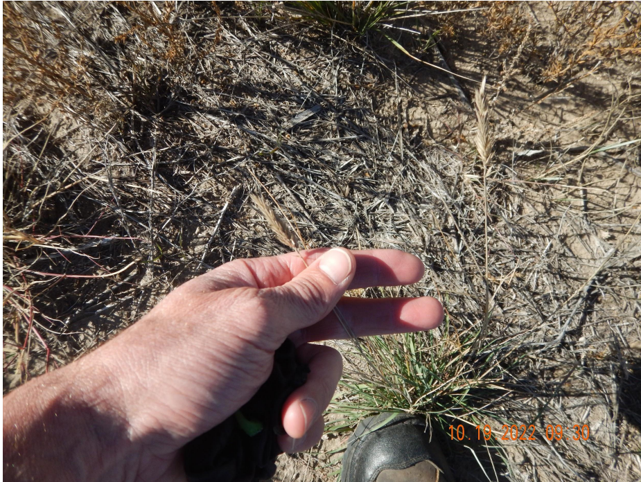
Photo 3. Close up photo taken from within the interim reclamation area. Photo illustrates Crested wheatgrass, introduced grass species, that was seeded as part of interim reclamation.