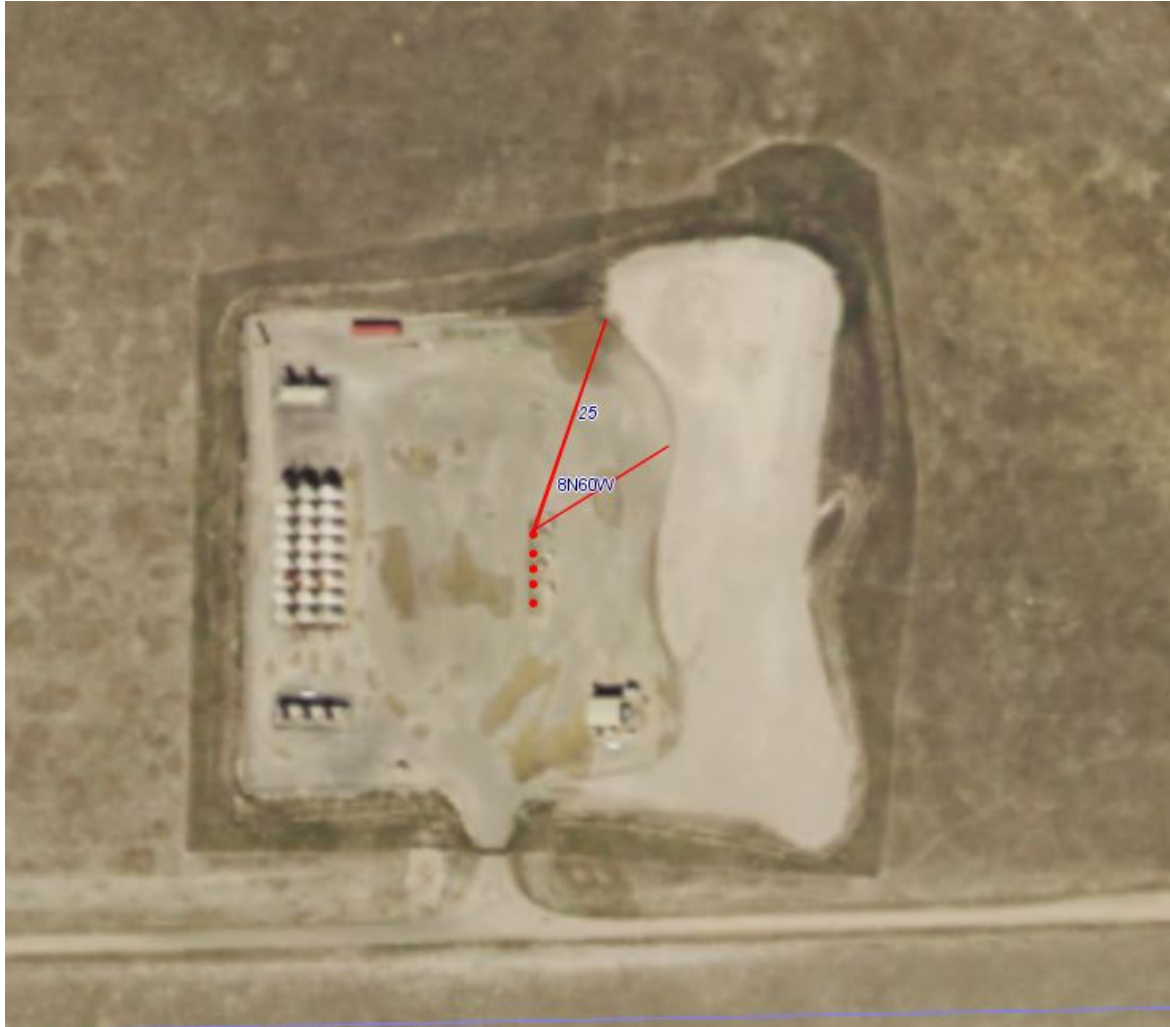
Photo 13. COGCC GISOnline aerial imagery from 2019 illustrates two red lines: shorter= ~140' and longer= ~200'. Operator does not appear to need portions of this northeastern area and shall further reduce the location per Rule 1003.