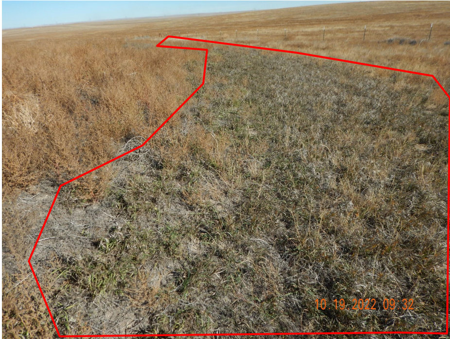
Photo 5. Photo taken from the eastern interim reclamation area, facing North. Photo illustrates Smooth brome establishment within the red polygon. Photo also illustrates unmanaged Kochia to the interior.