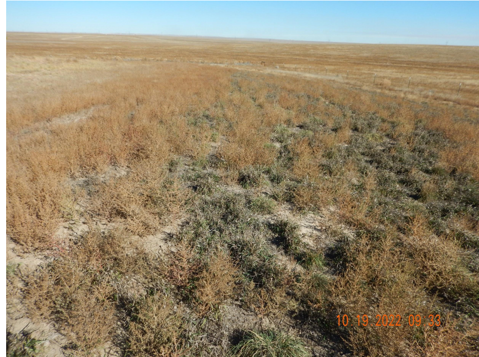
Photo 6. Photo taken from the eastern interim reclamation area, facing North. Photo illustrates a mix of introduced grass species and Kochia as the main vegetation with some establishment of natives.