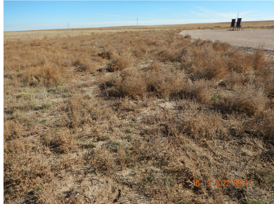
Photo 6. Photo taken from the northwestern interim reclamation area, facing East. See comments under Photo 1.