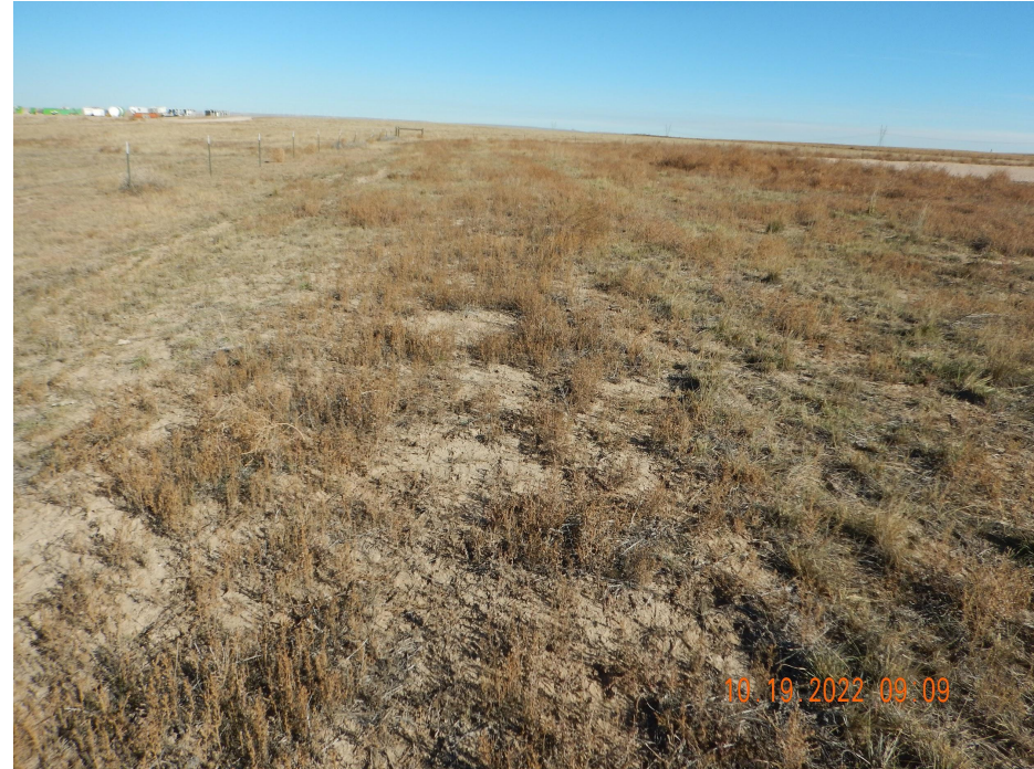
Photo 4. Photo taken from the western interim reclamation area, facing North. See comments under Photo 1.