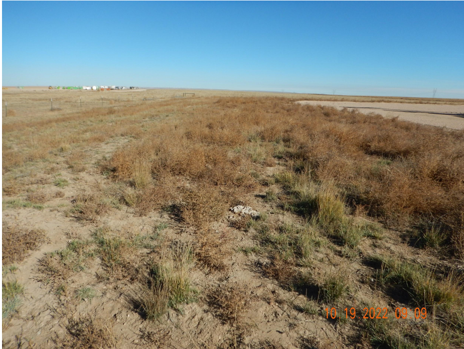
Photo 3. Photo taken from the southwestern interim reclamation area, facing North. See comments under Photo 1.