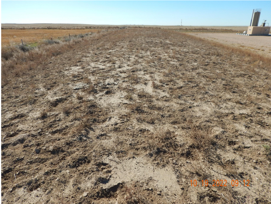
Photo 7. Photo taken from the northeastern interim reclamation area, facing South. Photo illustrates what appears to be a potential topsoil stockpile lacking vegetative growth and is not stabilized.