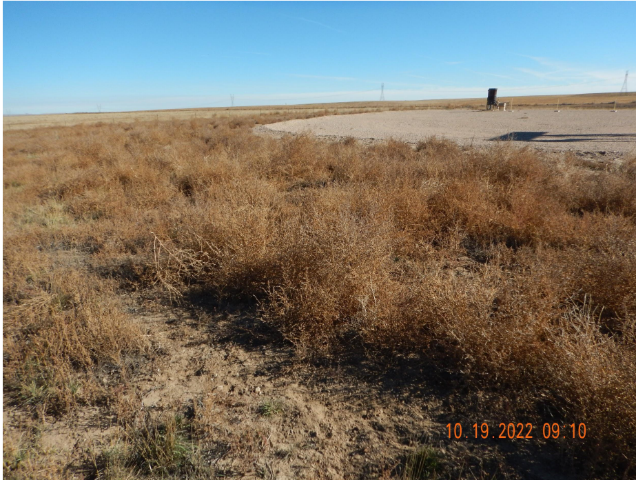
Photo 5. Photo taken from the northwestern interim reclamation area, facing Northeast. See comments under Photo 1.