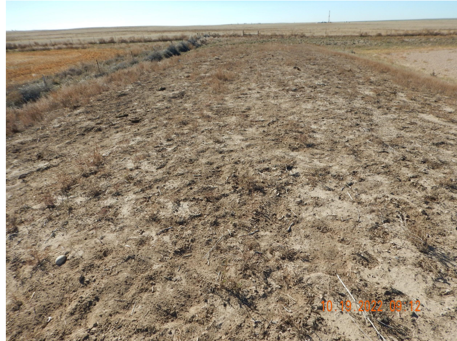
Photo 8. Photo taken from the eastern interim reclamation area, facing South. See comments under Photo 7.