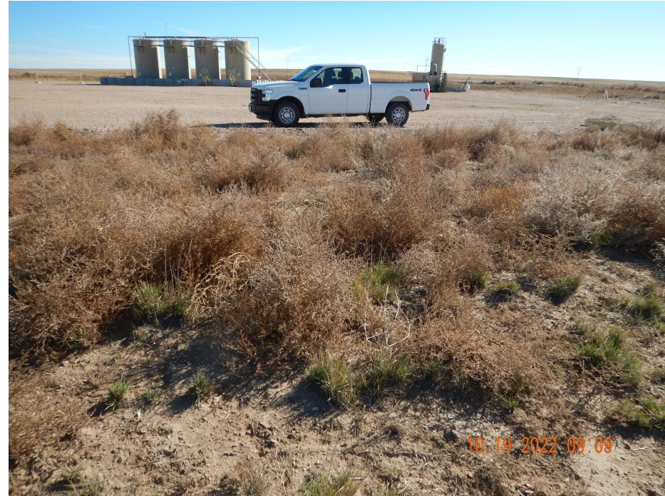
Photo 2. Photo taken from the southwestern interim reclamation area, facing East. See comments under Photo 1.