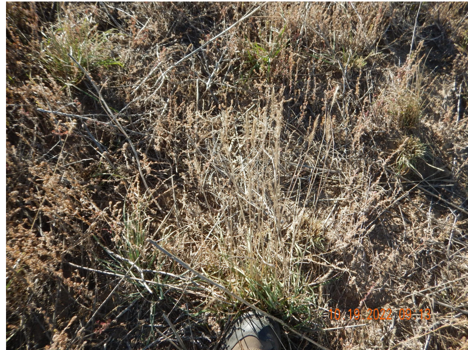
Photo 10. Photo taken from the southeastern interim reclamation area. Photo illustrates an introduced grass species, Crested wheatgrass.