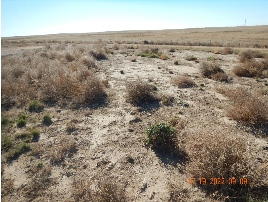
Photo 1. Photo taken from the southwestern interim reclamation area, facing South. Photo illustrates unmanaged annual, weedy Kochia vegetation and bare ground with some desirable vegetation establishment. Note- introduced grass species were observed which is not reflective of reference area vegetation.