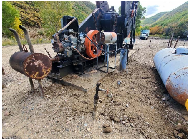
Soil picked up, replaced with clean soil.