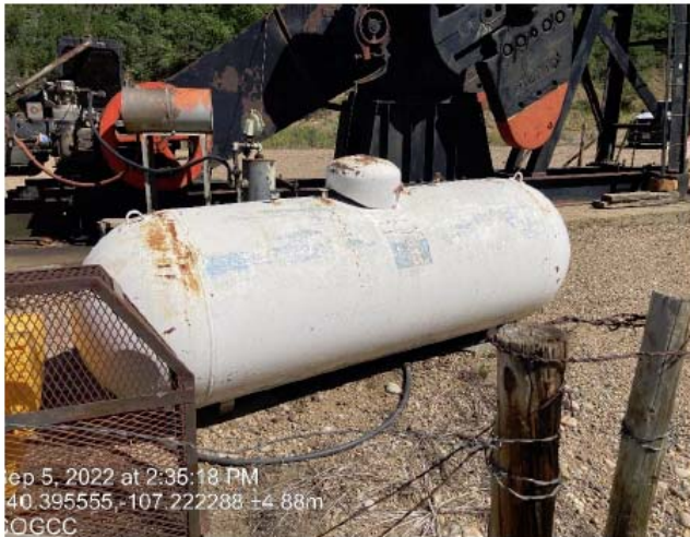
Propane tank lacking labeling