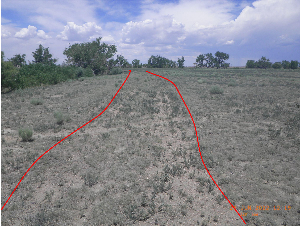
Photo 6. Overview photo of the access road taken at ground level from the eastern edge facing west. Note: access road does not appear to be properly reclaimed and remains with gravel.