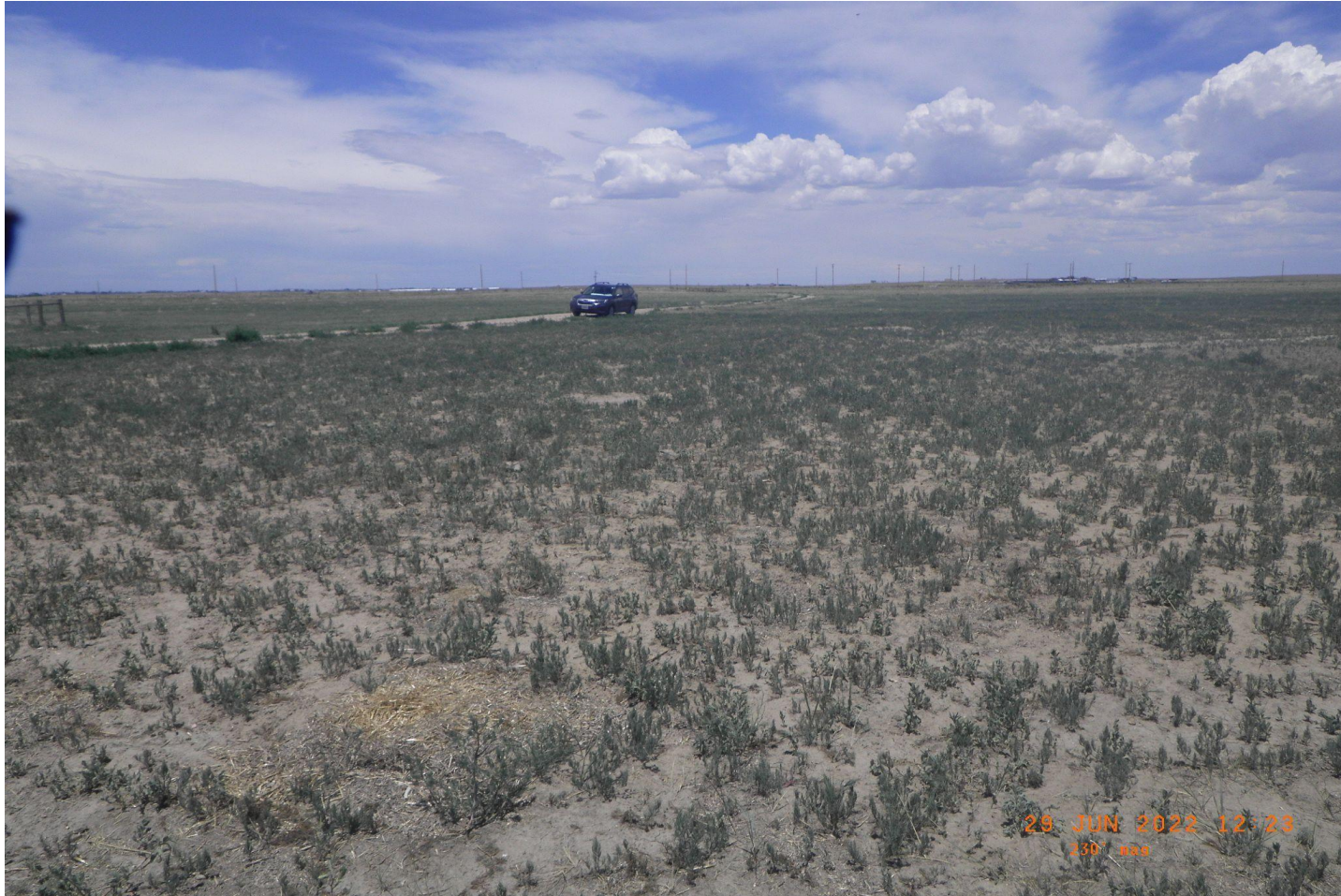
Photo 7. Overview photo of the tank battery taken at ground level from the eastern edge facing west.