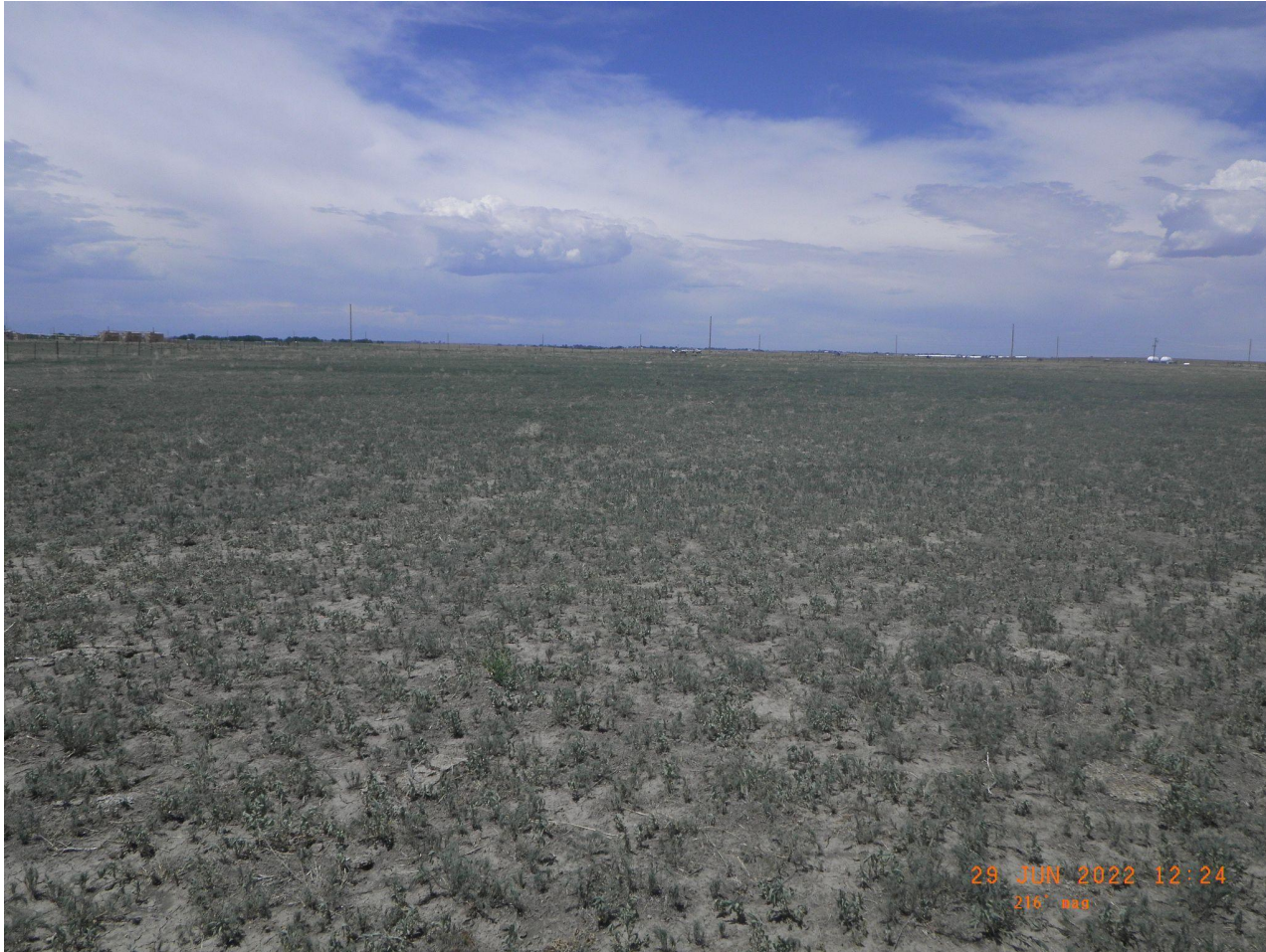
Photo 10. Tank battery reference area.