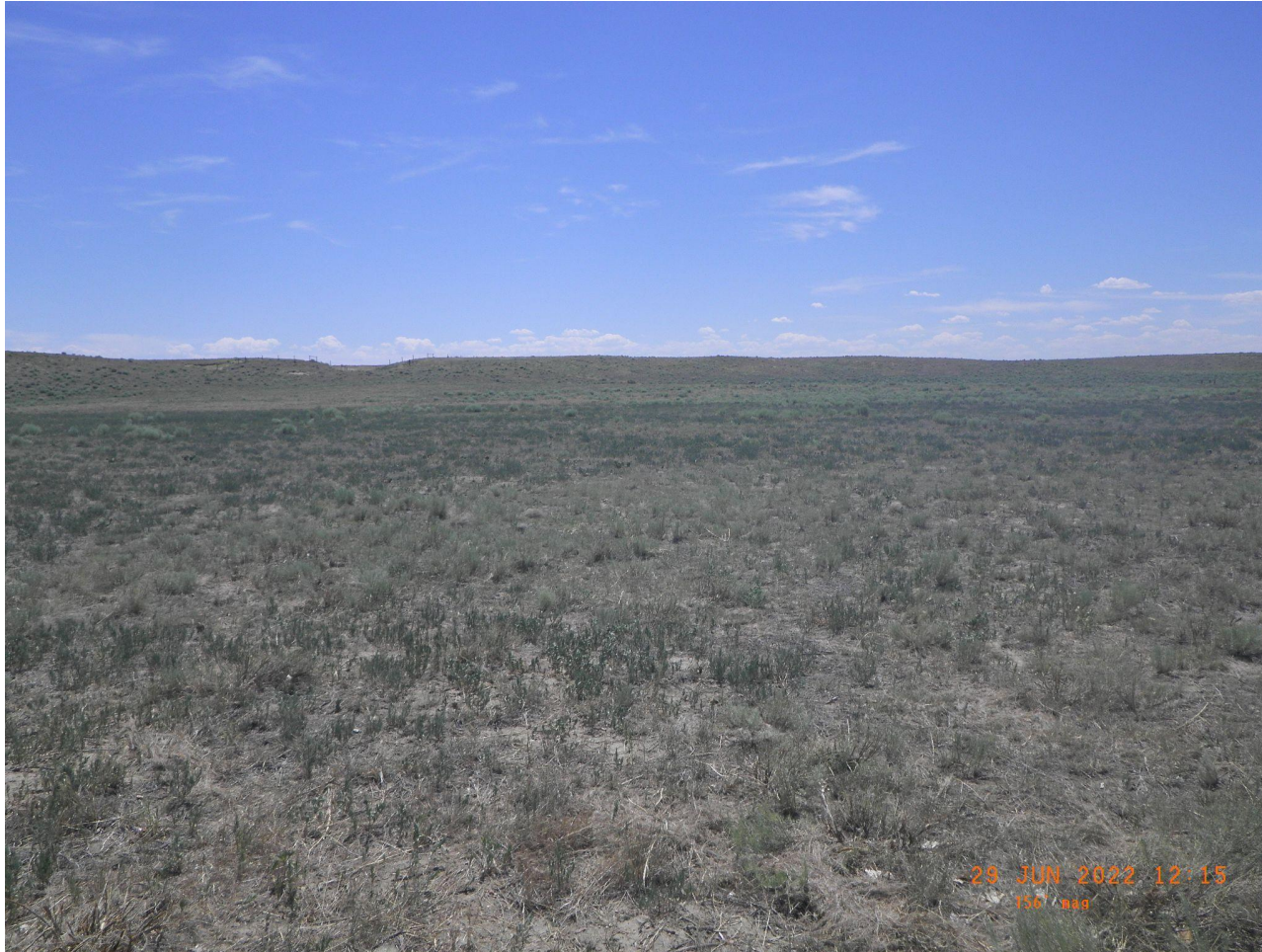
Photo 2. Overview photo of the well pad taken at ground level from the western edge facing north east. Note: well pad falls within pasture used for grazing.