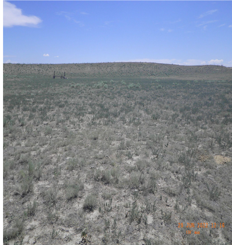
Photo 3. Cardinal photos taken from the middle of the well pad. Left photo facing north, right photo facing east.