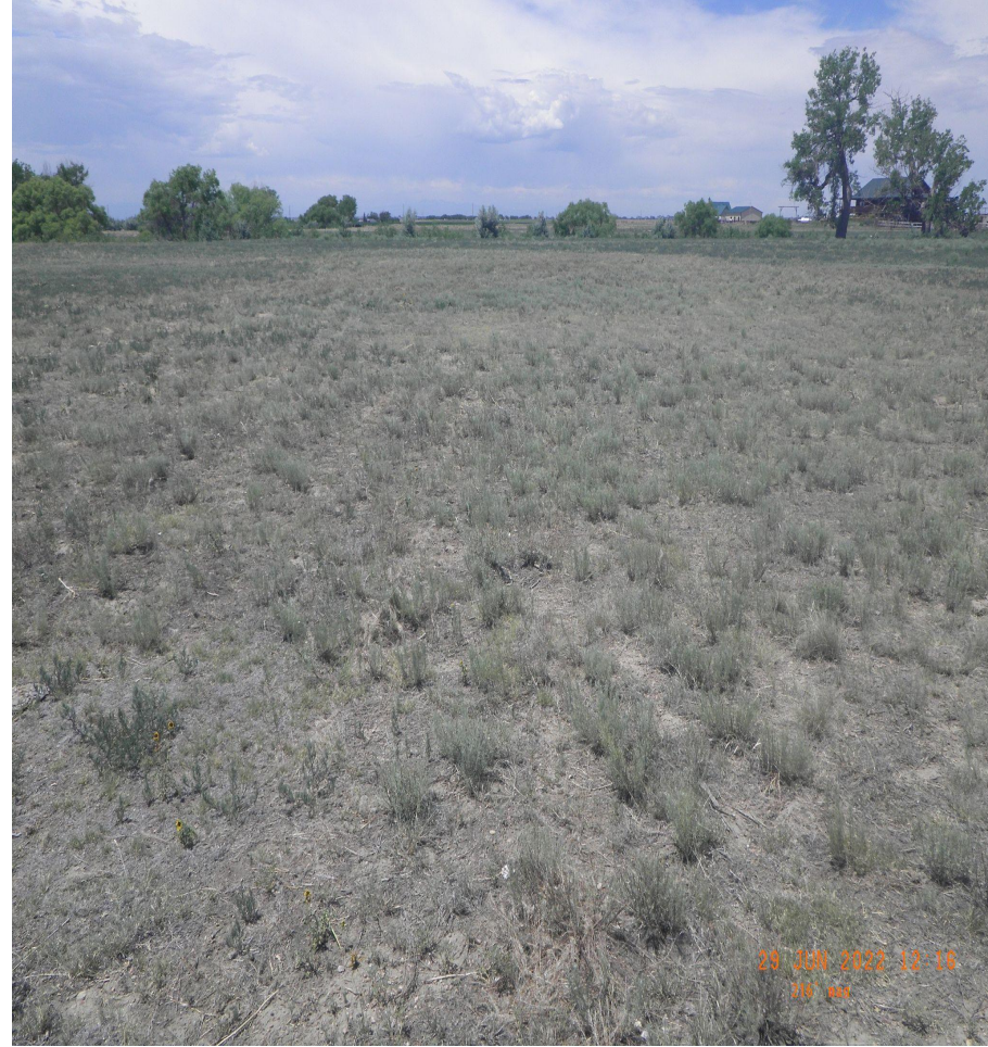
Photo 4. Cardinal photos taken from the middle of the well pad. Left photo facing south, right photo facing west. Note: well pad appears consistent with adjacent reference area. (see photo 5).