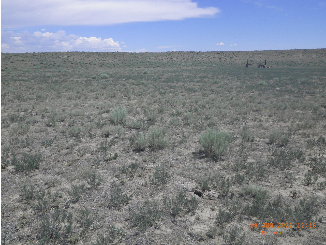
Photo 5. Well pad reference area.