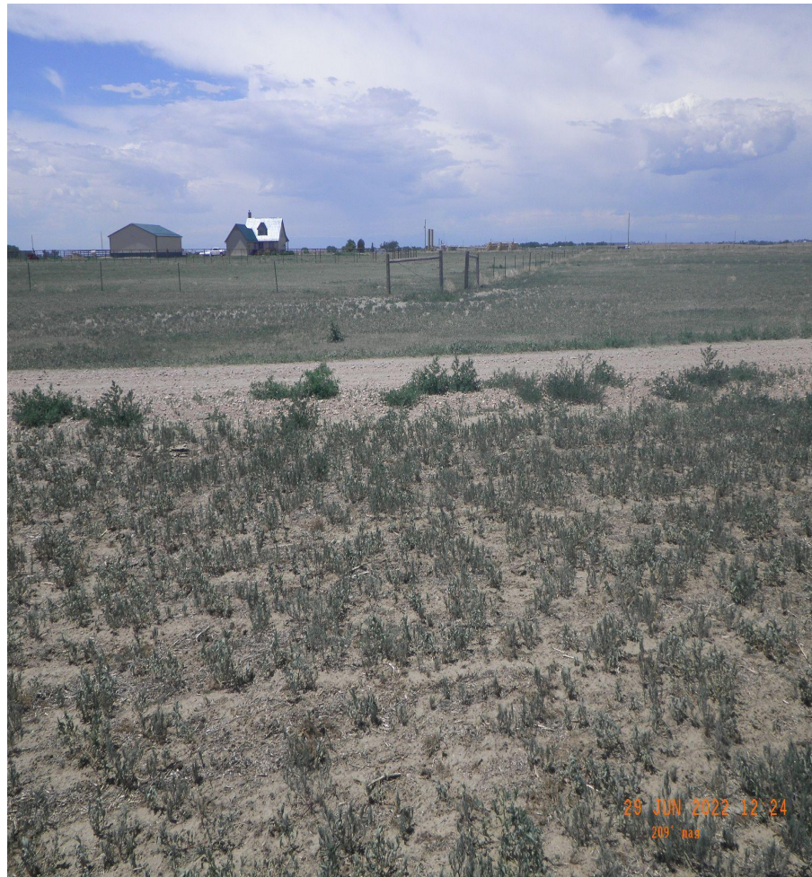
Photo 9. Cardinal photos taken from the middle of the tank battery. Left photo facing south, right photo facing west. Note: tank battery appears consistent with adjacent reference area however no desirable species were observed and is dominated by kochia, as is the reference area (see photo 10).