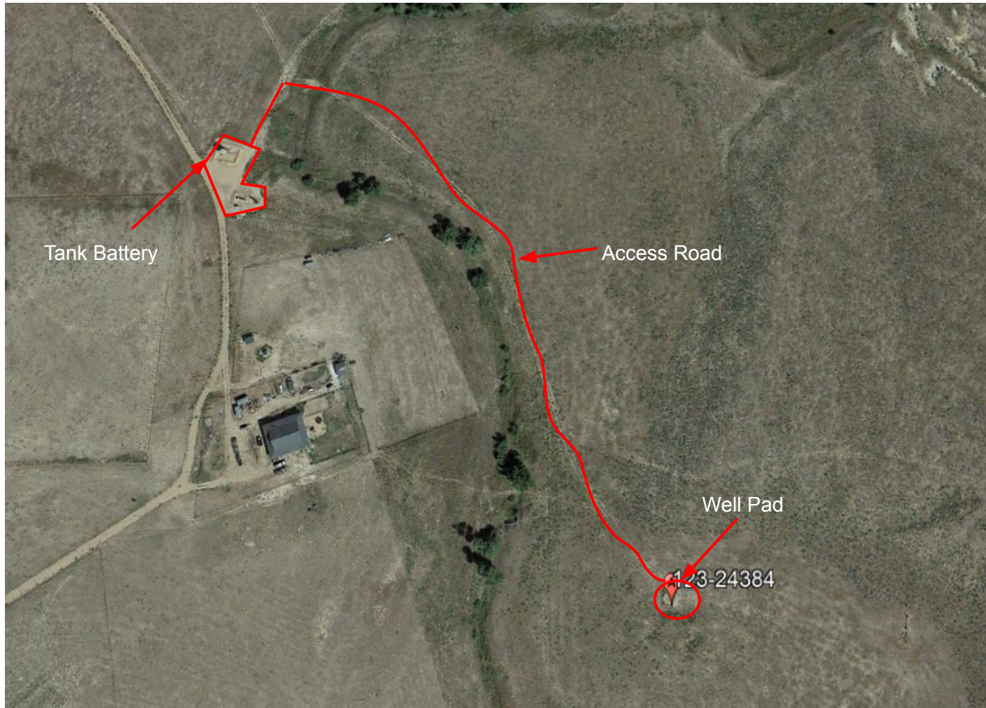
Photo 1. 2013 aerial imagery of the well pad, access road and associated tank battery.