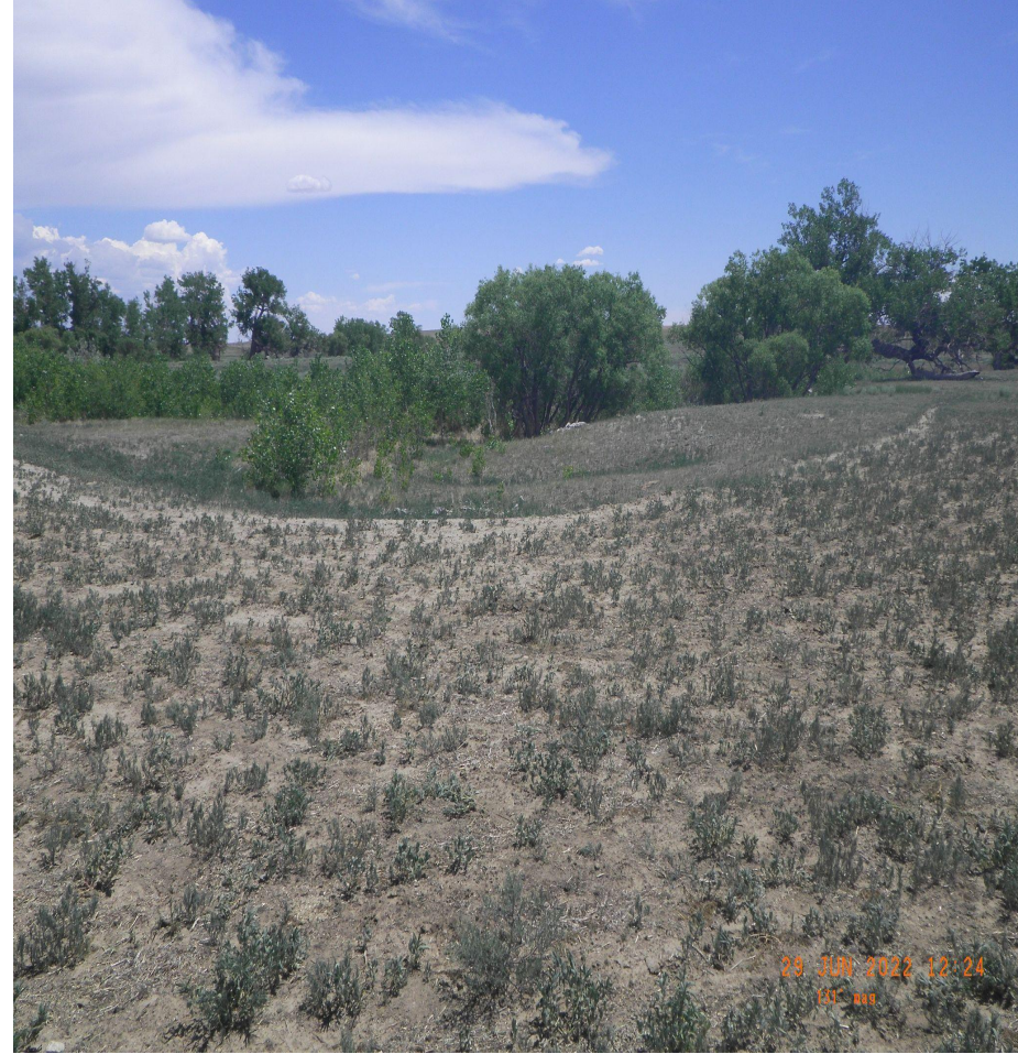
Photo 8. Cardinal photos taken from the middle of the tank battery. Left photo facing north, right photo facing east.