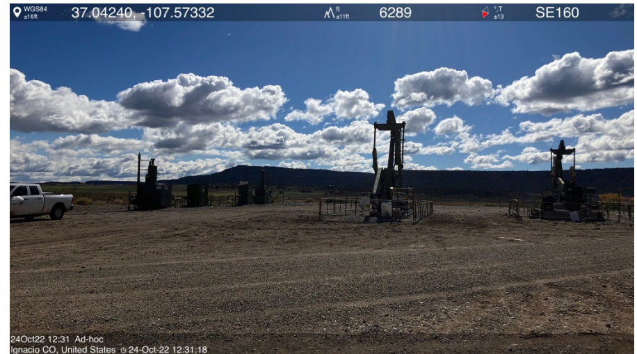
IMG 02 Location overview