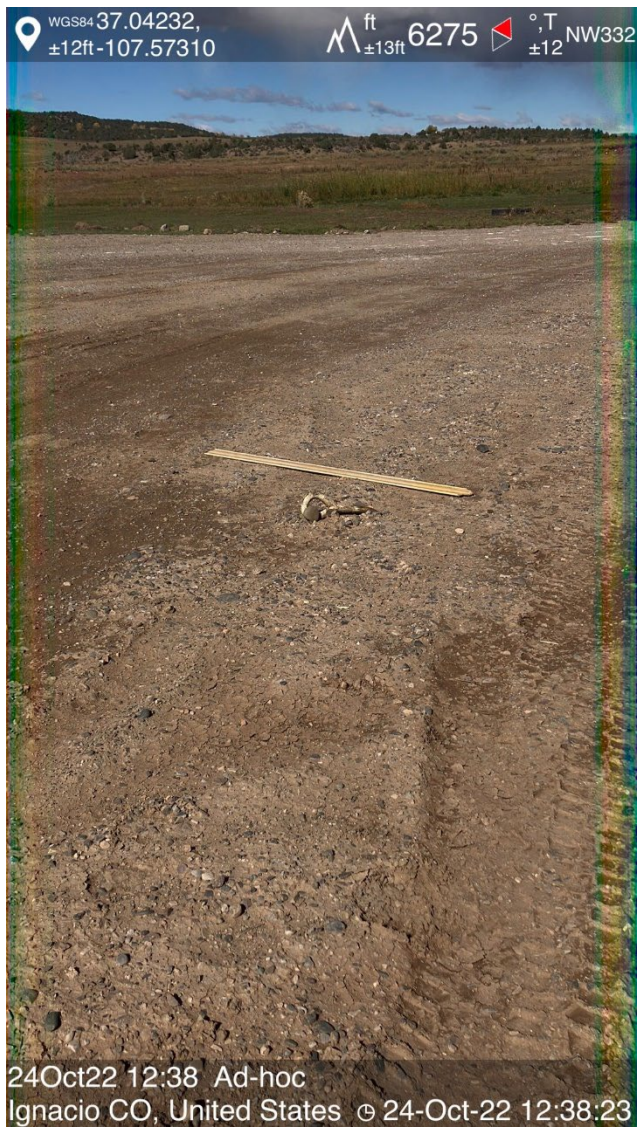
IMG 07 Rig anchor