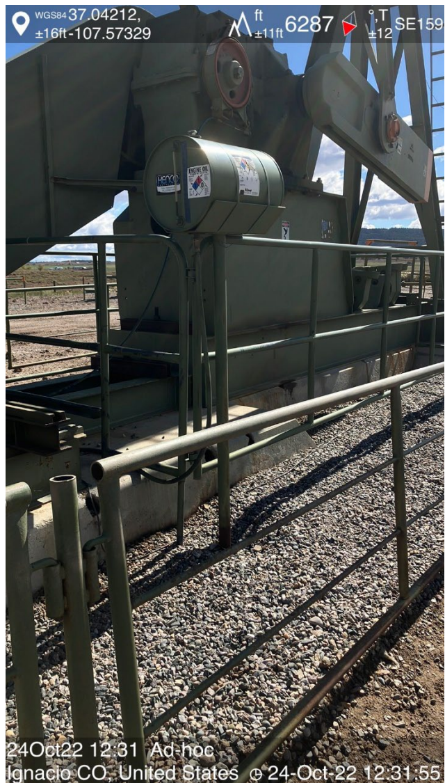
IMG 03 Lube oil