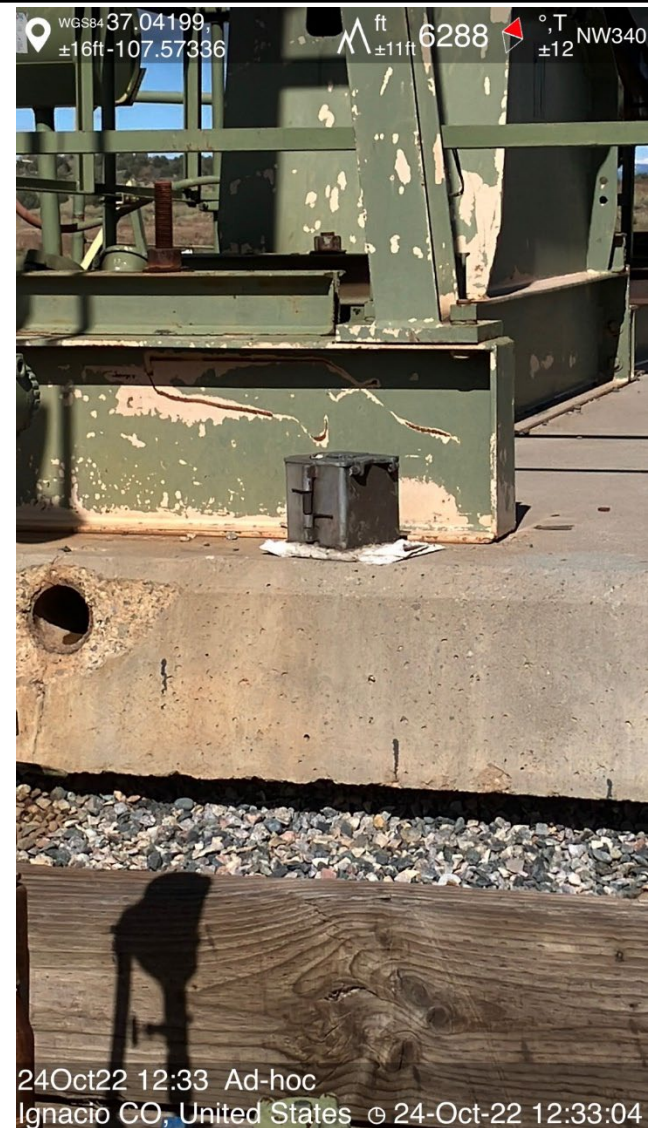
IMG 04 Pump packing box