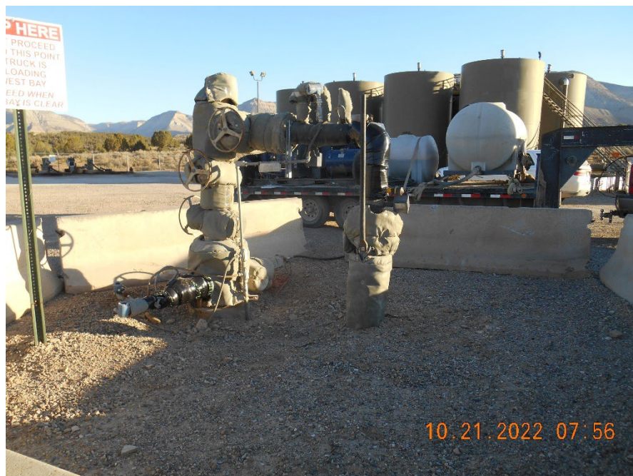
Injection wellhead during MIT