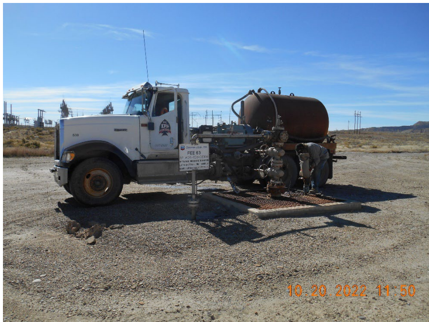
Injection wellhead during MIT