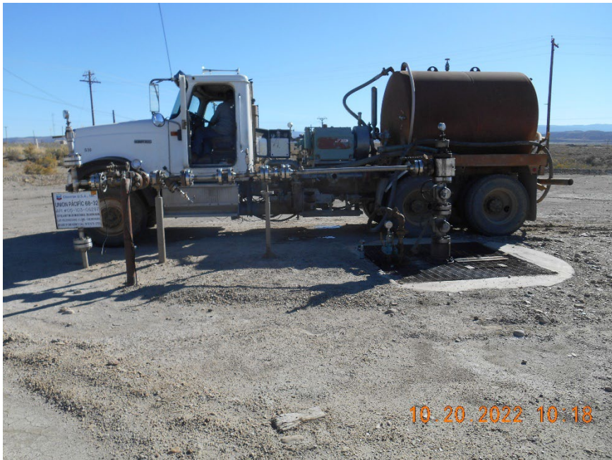
Injection wellhead during MIT