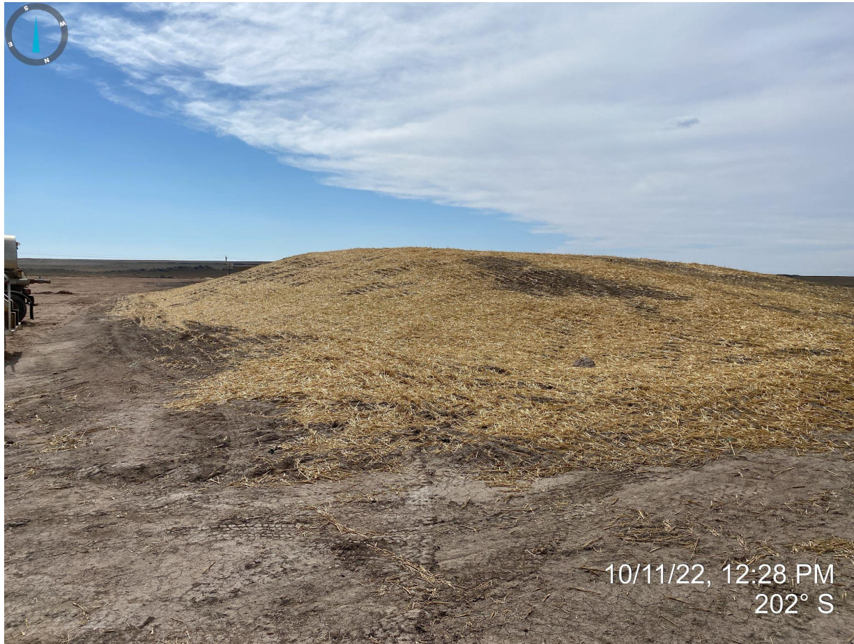
Photo 9. Taken from northwestern corner of location, facing south. See comments in photo 7.