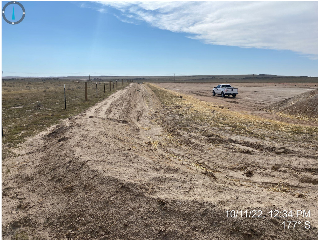
Photo 11. Taken from northeast corner of location, facing south. See comments in photo 10.