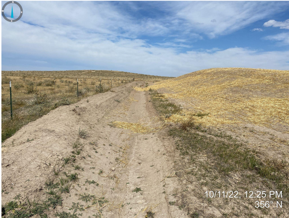
Photo 8. Taken from western portion, facing north. See comments in photo 7.