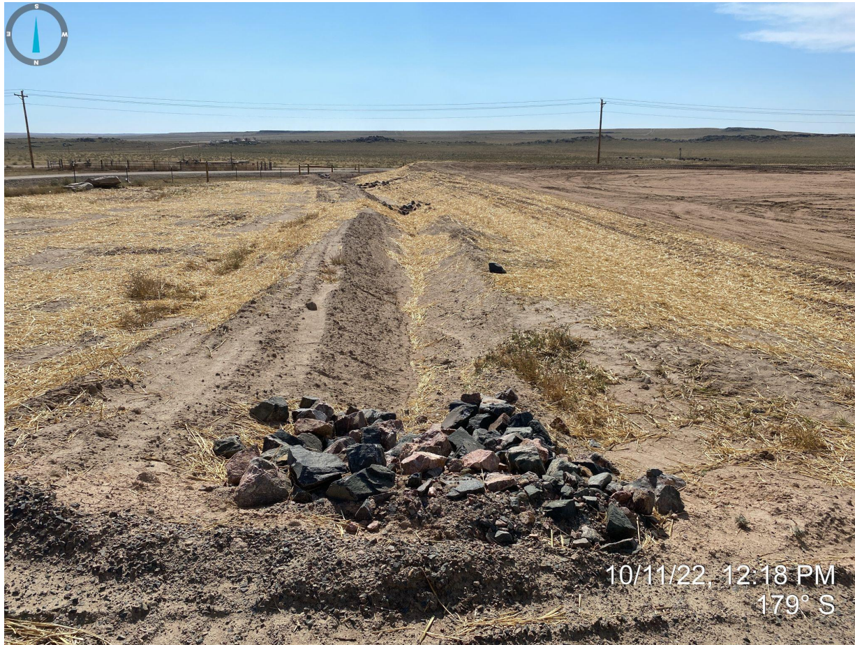
Photo 2. Taken near entrance, facing south. Photo illustrates operator has performed corrective actions and has stabilized inlet and outlets of culverts.