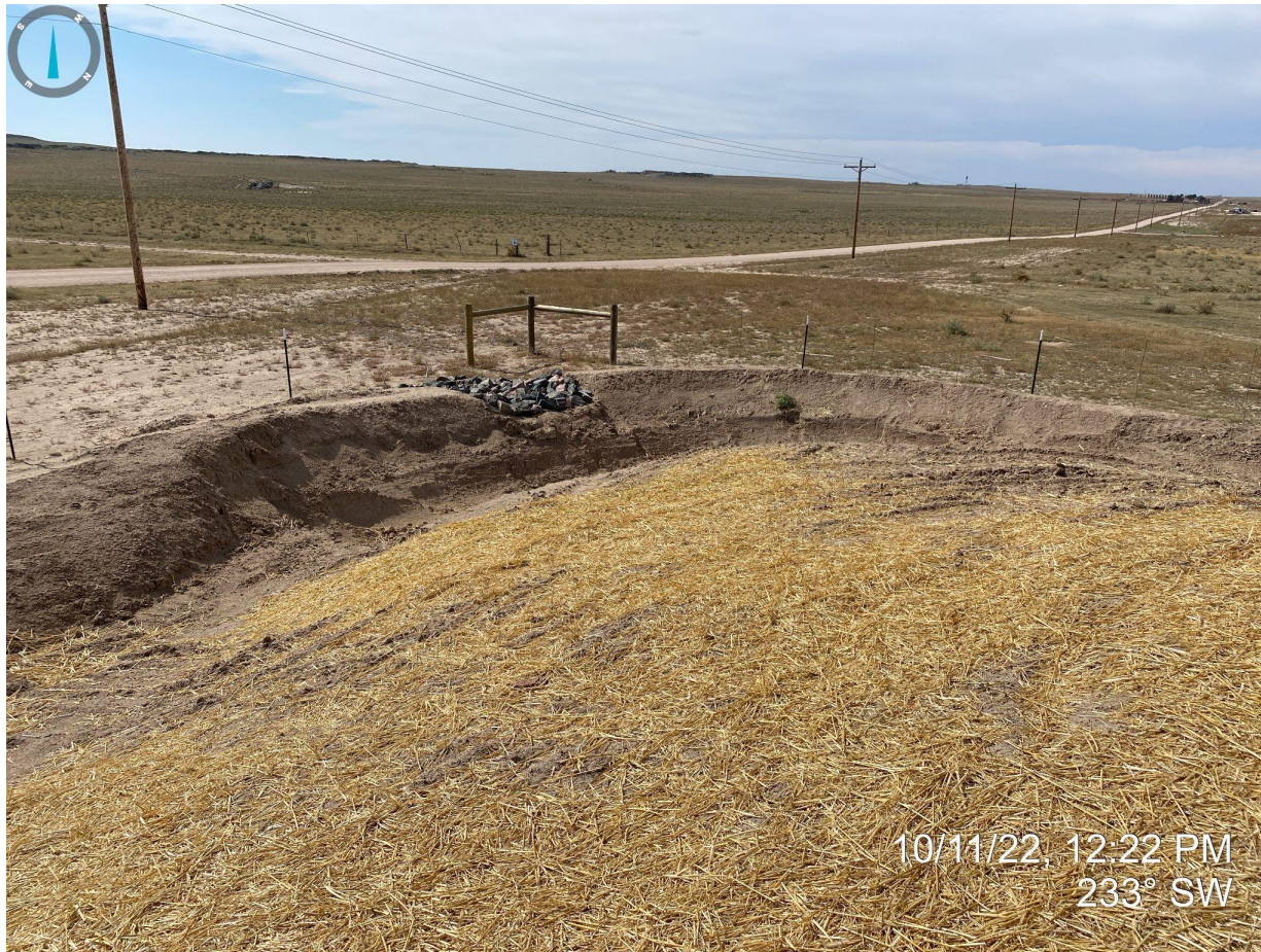
Photo 6. Taken from southwest portion of location, facing southwest. Photo illustrates detention area and stabilized slopes.