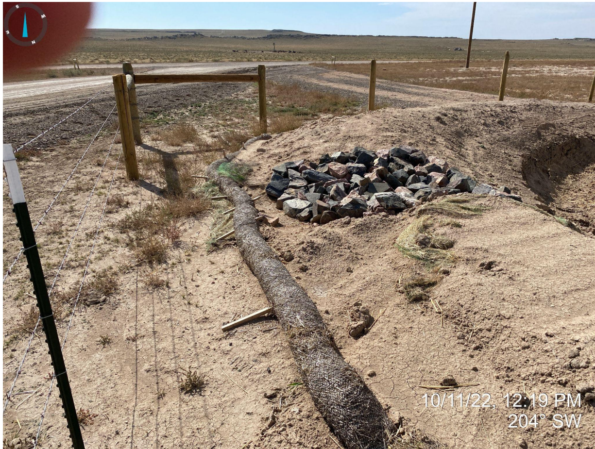
Photo 3. Taken from southeast corner of location, facing southwest. Photo illustrates straw wattles are not installed per good engineering practices (e.g. not staked, not trenched).