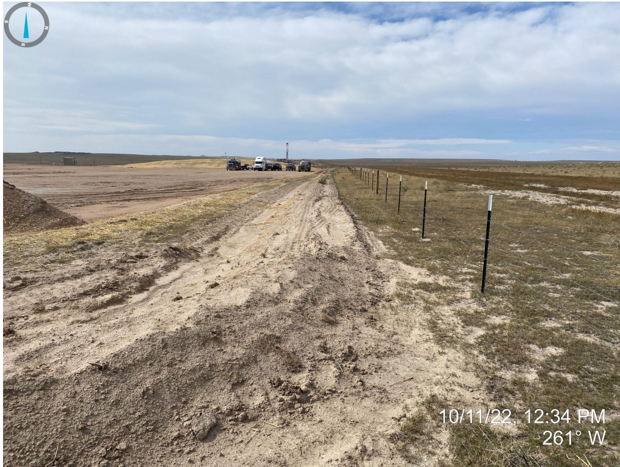
Photo 10. Taken from northeast corner of location, facing west. Photo illustrates Operator has performed corrective actions with no evidence of unconsolidated material on the berm portion of BMP; material seems to have been compacted.