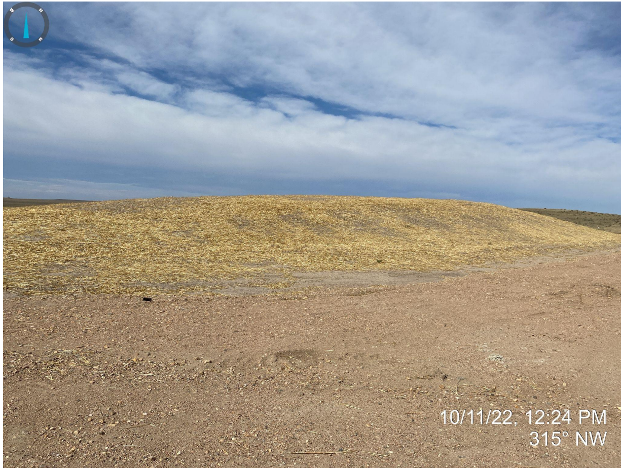
Photo 7. Taken from center of location, facing northwest. Photo illustrates topsoil stockpile has been stabilized with evidence of seeding and straw crimped mulch.