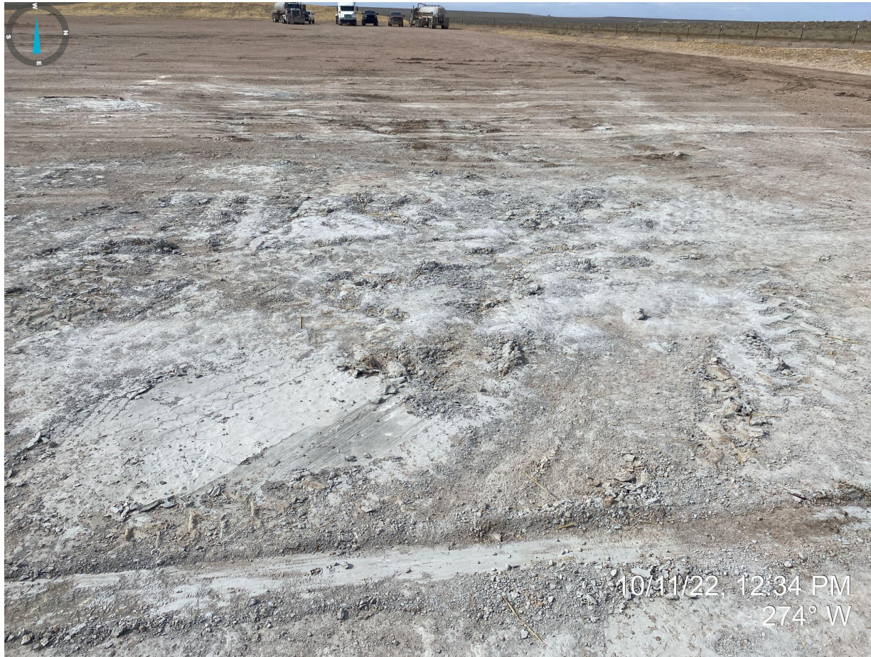
Photo 12. Taken near northeast corner of location, facing west. Photo illustrates approximate 20' x 20' area of concrete washout. This need to be cleaned and properly disposed of.