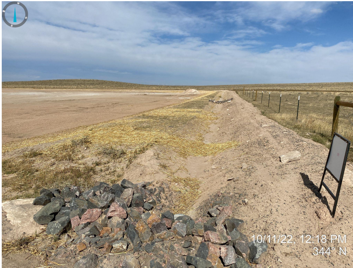
Photo 1. Taken near entrance, facing north. Photo illustrates operator has performed corrective actions and has stabilized inlet and outlets of culverts.