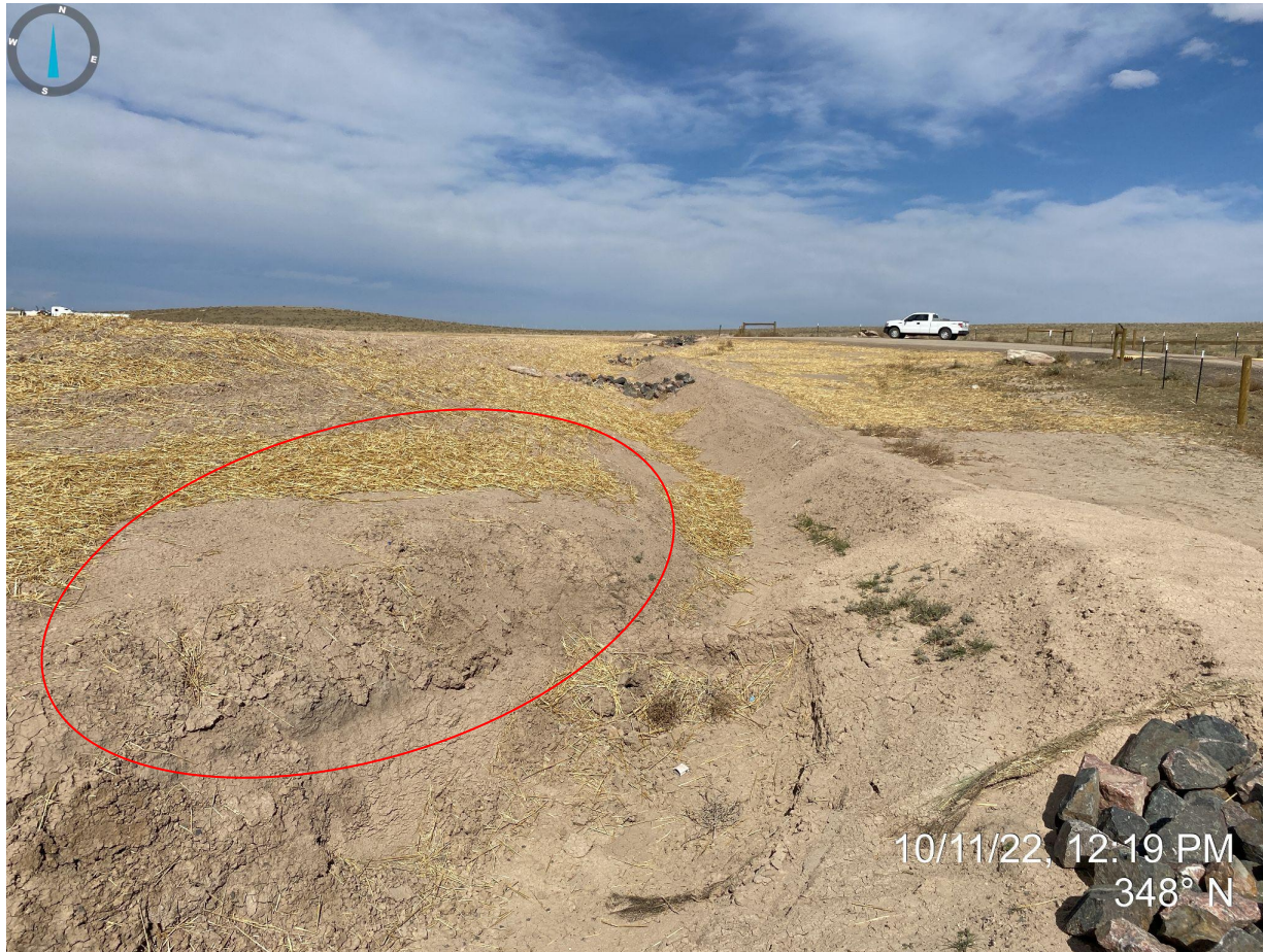
Photo 5. Taken from southeast corner of location, facing north. Photo illustrates Operator has performed corrective actions with no evidence of unconsolidated material on the berm portion of BMP.