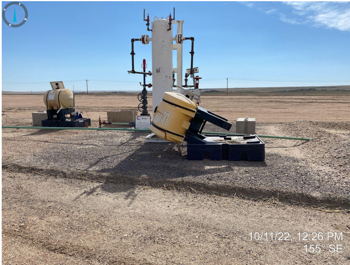
Photo 13. Taken near center of location, facing southeast. Tank has shifted and needs to be uprighted. No apparent fluid/material in tank, and no visible leaks on ground during time of inspection.