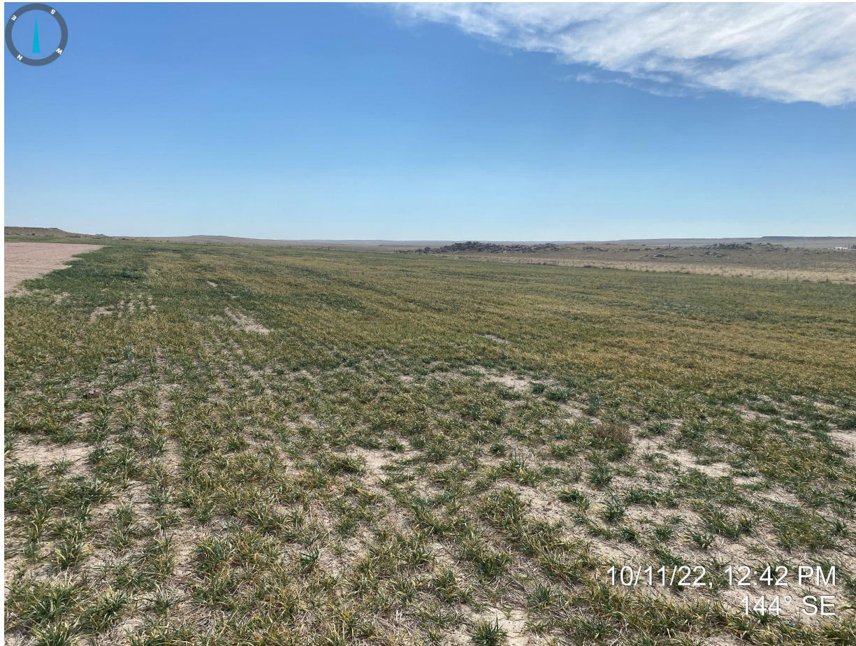
Photo 1. Taken near the entrance of location, facing southeast. Photo illustrates interim reclamation areas have been revegetated and are progressing towards standards.