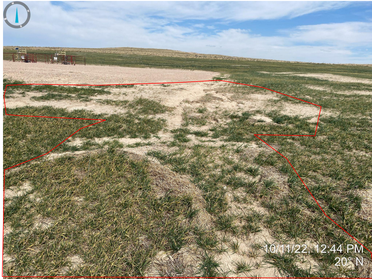
Photo 3. Taken from southeastern portion of production area, facing north. Photo illustrates sediment laden stormwater appears to have discharged off of the production area and into the interim area.