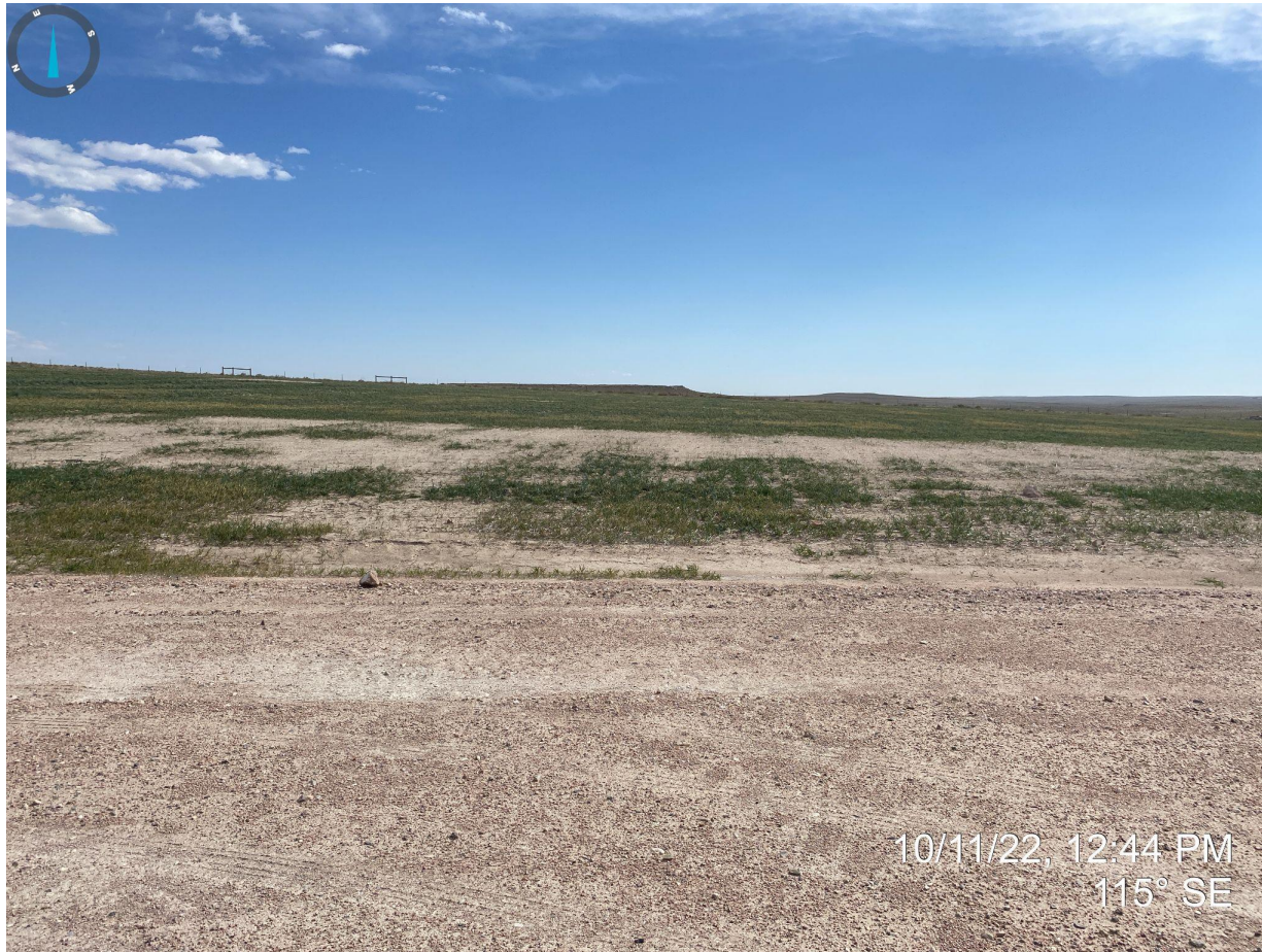
Photo 2. Taken from eastern portion, facing southeast. Photo illustrates an approximate 100' x 30' area that has not revegetated; some germination was observed in bare soil areas.