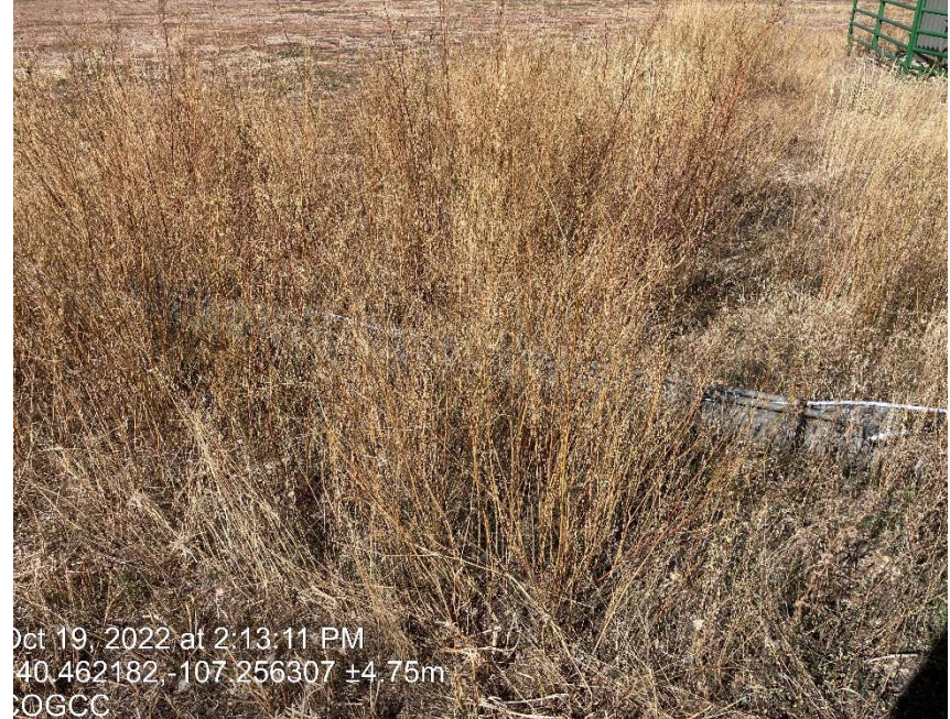
Stored equipment and weeds