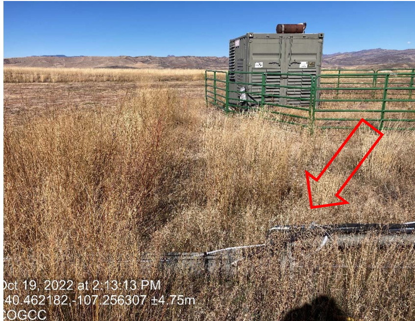
Weeds and stored equipment