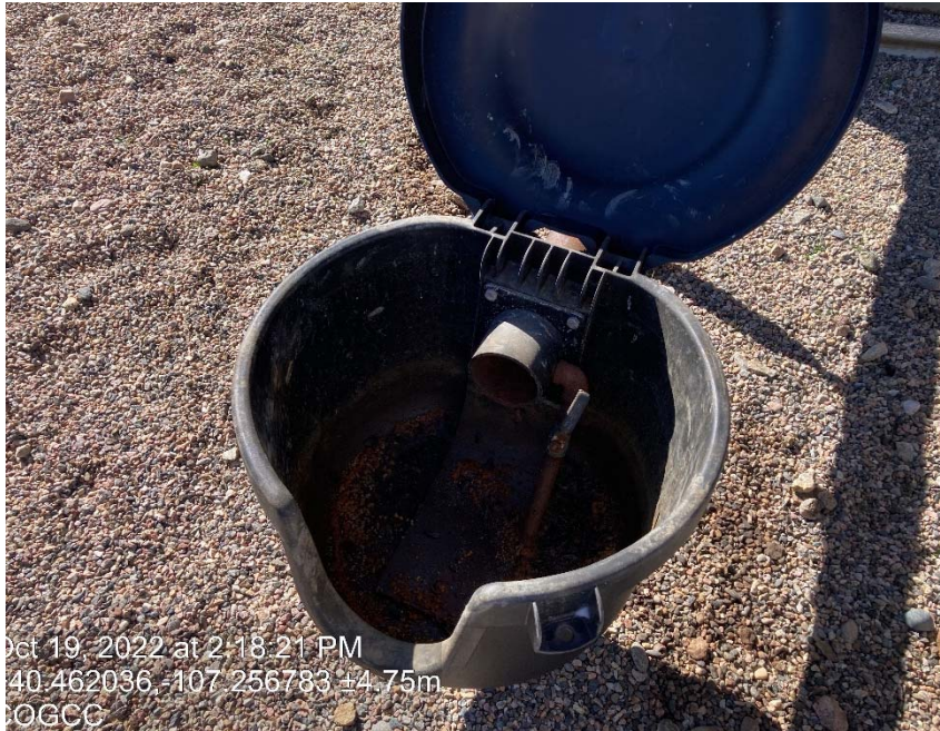
Load line missing cap/plug