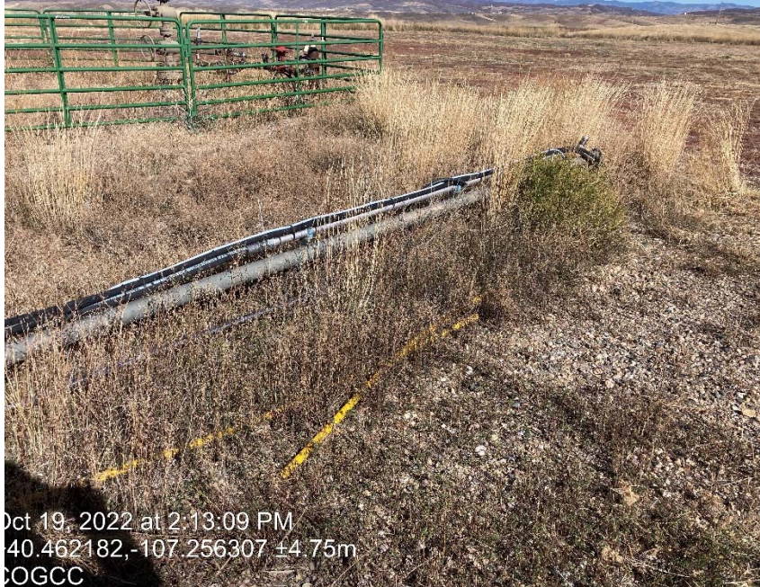
Stored equipment and weeds