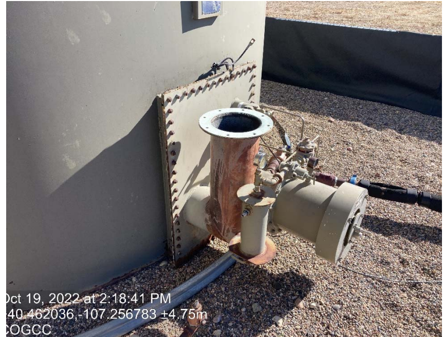
Open hole for wildlife to enter