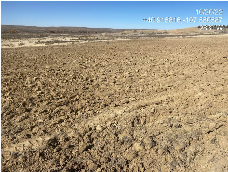
Photo 4. Photo taken from the southeast shows an overview of the Location.