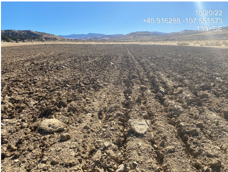
Photo 6. Photo shows the Location has been ripped in one direction. Soils have not been “cross-ripped” with overlapping passes.