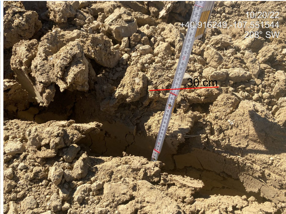
Photo 5. Photo shows the Location appears to have been ripped to approximately 30 cm (12 inches).