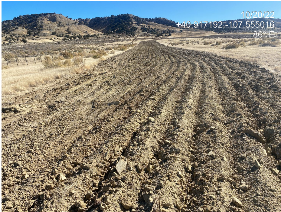
Photo 1. Photo taken from the northwest of the Location shows the access road has been ripped. Soil pits and shovel penetration tests throughout the road indicated a maximum ripping depth of 12 inches, sometimes less. 1004 Rules require ripping to a depth of 18 inches.