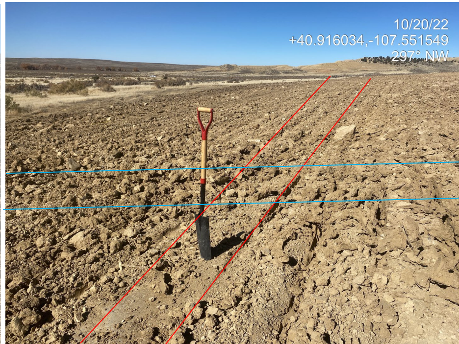
Photo 7. Photo shows a the Location has been ripped in one direction. Shovel was unable to penetrate a continuous strip of unripped soil. “Cross-ripping” means passes should be overlapping. Red line indicates direction of rip. Blue line indicates additional rip direction needed.