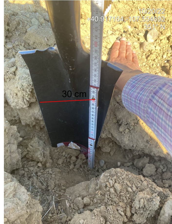
Photo 2. Photo shows the depth of shovel penetration on the ripped access road is 30 cm (12 inches). Other areas appeared to be ripped shallower.