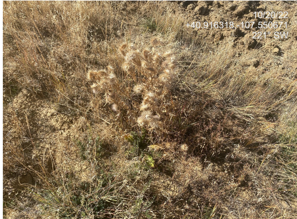
Photo 9. Photo shows a bull thistle (noxious weed) plant going to seed adjacent to recently ripped soil. Ongoing weed management will be required.