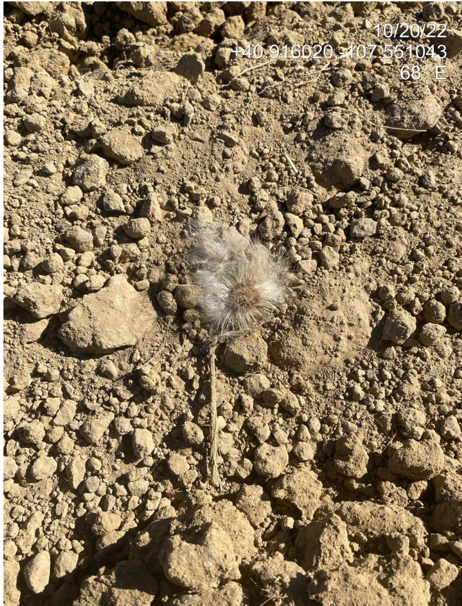
Photo 8. Photo shows bull thistle (noxious weed) seed in recently ripped soil. Ongoing weed management will be required.