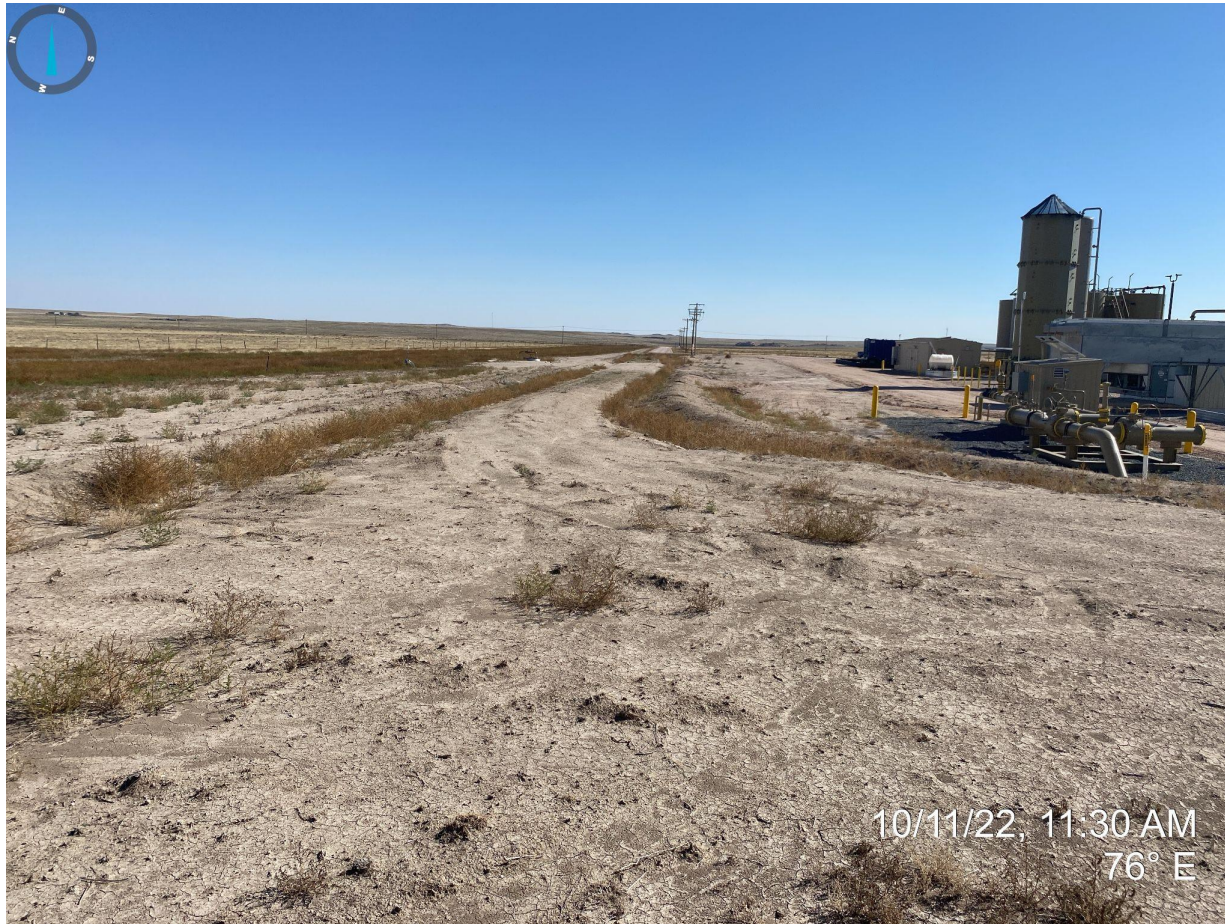
Photo 14. Taken from northwest corner, facing east. Photo illustrates interim areas have failed to revegetate with bare soil and annual weedy vegetation observed.