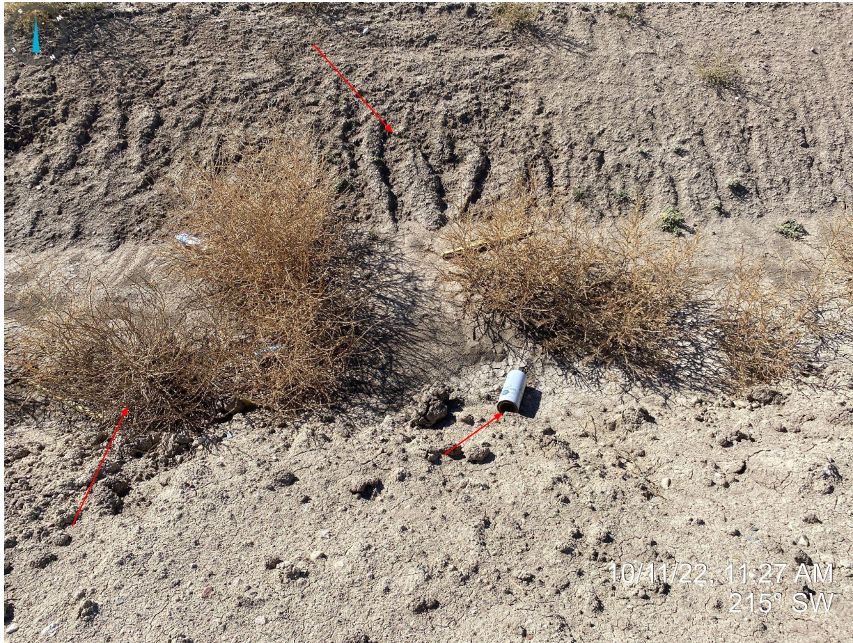
Photo 9. Taken from southwest portion of location, facing southwest. Close up photo of ditch BMP illustrating trash, annual weedy vegetation, unconsolidated material, and rill erosion.