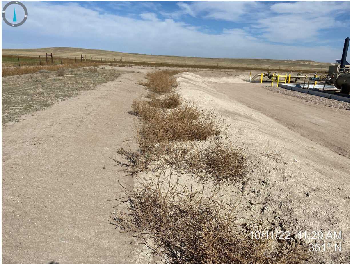
Photo 13. Taken from the western portion of location, facing north. Photo illustrates ditch BMP is filled with sediment and annual weedy vegetation.