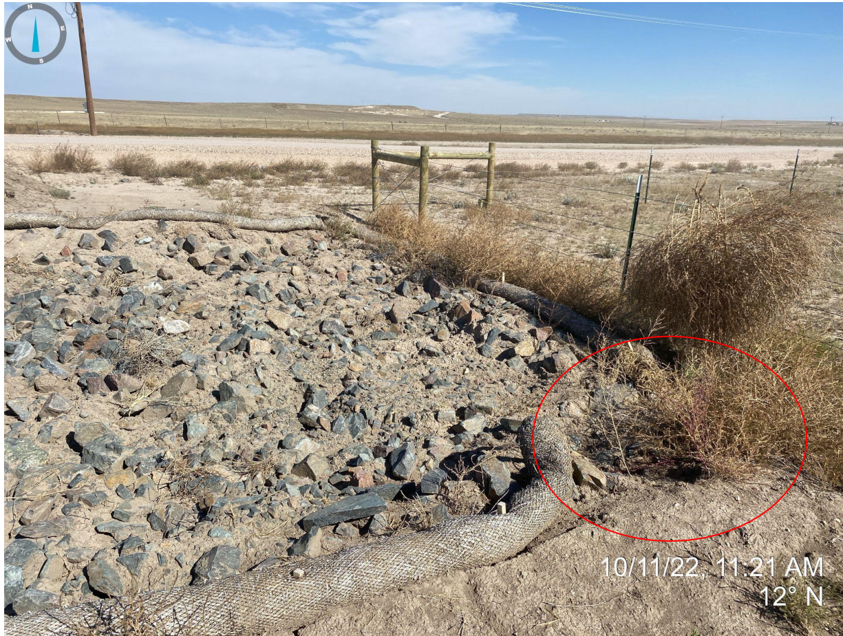
Photo 1. Taken near entrance, facing north. Photo illustrates straw wattles are not properly installed or missing. Rip-rap material is partially covered with sediment.