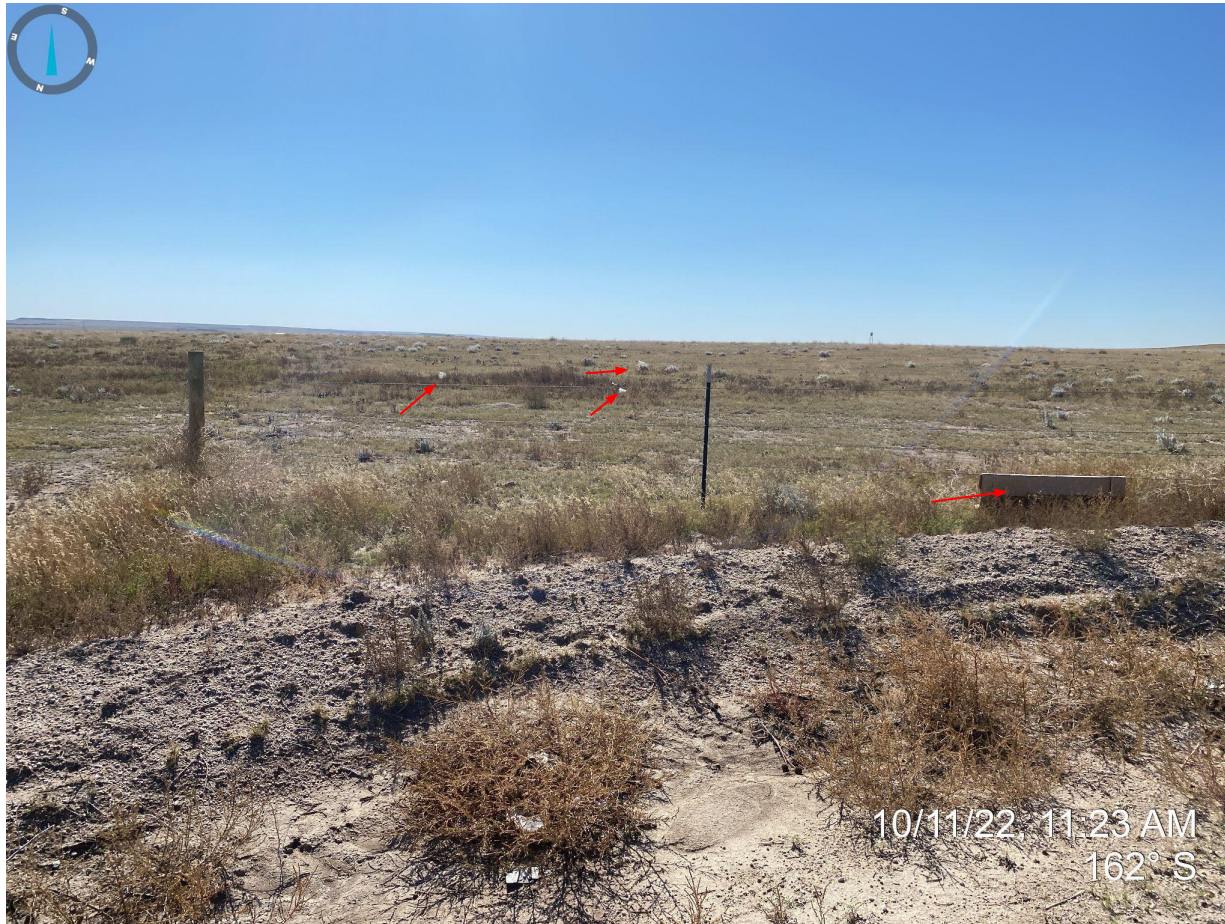
Photo 6. Taken from southeast corner, facing south. Photo illustrates trash that has blown off location, indicated by red arrows.