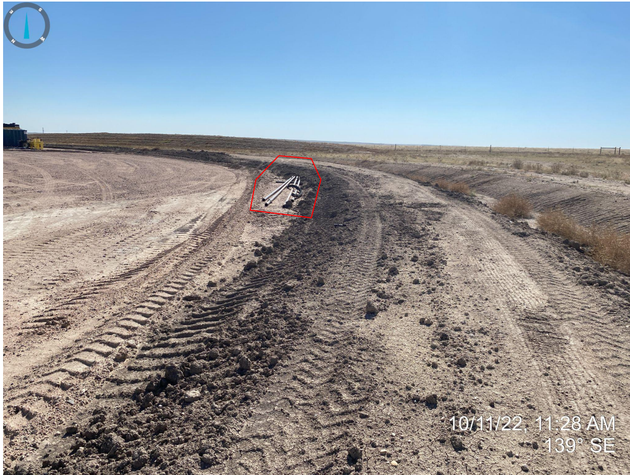
Photo 12. Taken from southwest portion of location, facing southeast. Unused pipe stored on location.