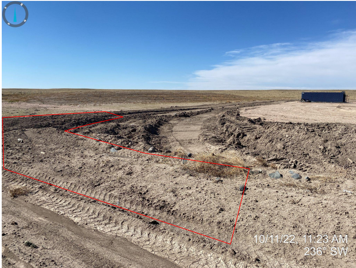
Photo 4. Photo taken from eastern portion, facing southwest. Photo illustrates ditch and berm BMP consisting of unconsolidated material, outlined in red.