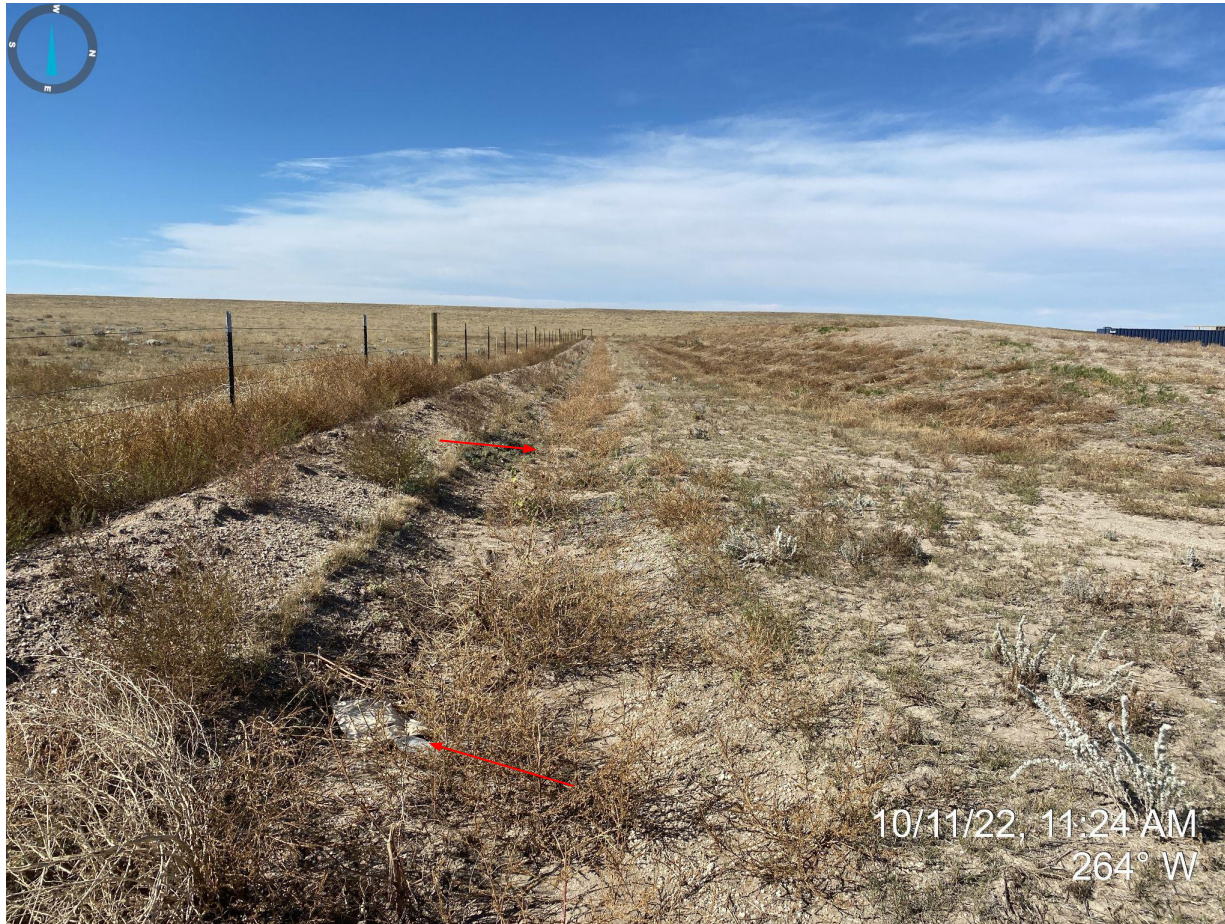
Photo 7. Taken from southeast corner, facing west. Photo illustrates perimeter ditch BMP has annual weedy vegetation growth and trash.