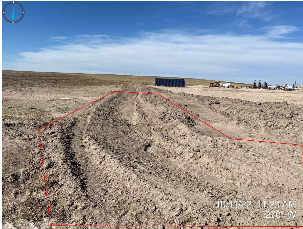
Photo 5. Taken near southeast corner of location, facing west. See comments in photo 4.