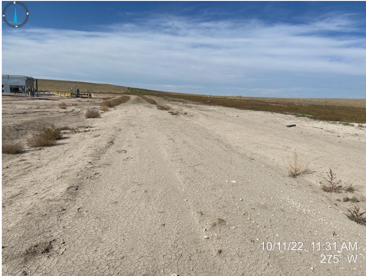
Photo 15. Taken from northeast corner, facing west. See comments in photo 14.