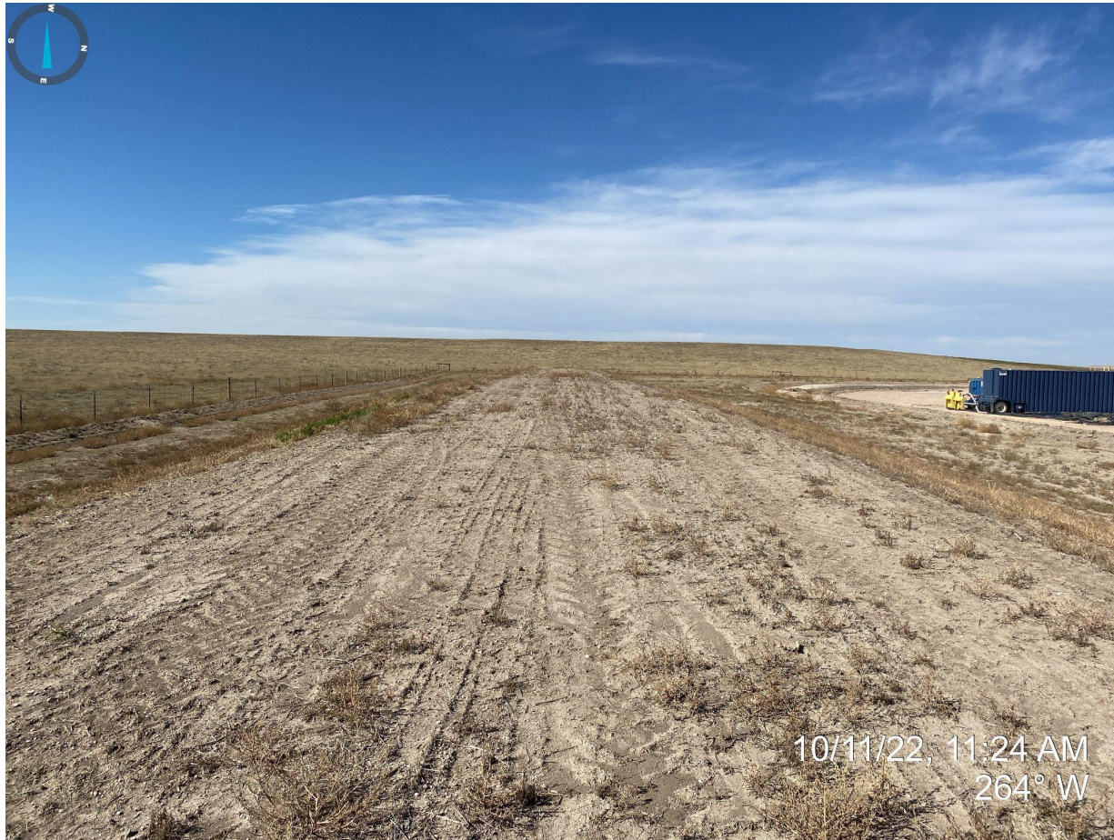
Photo 8. Taken on top of topsoil stockpile, facing west. Photo illustrates topsoil has not been revegetated to comply with 1003 rules; annual weedy vegetation and bare soil observed.