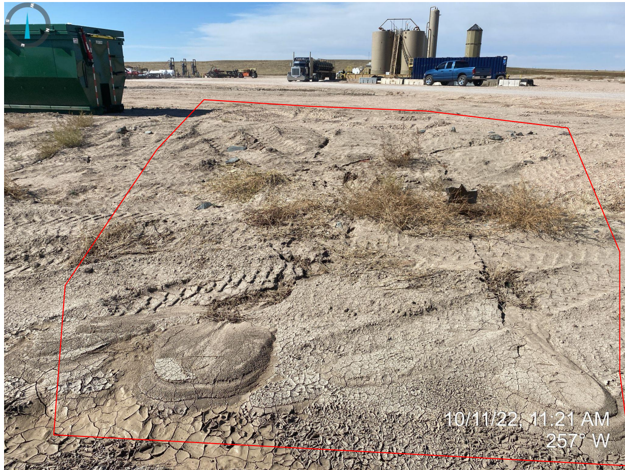
Photo 3. Taken near entrance, facing west. Photo illustrates rill erosion.