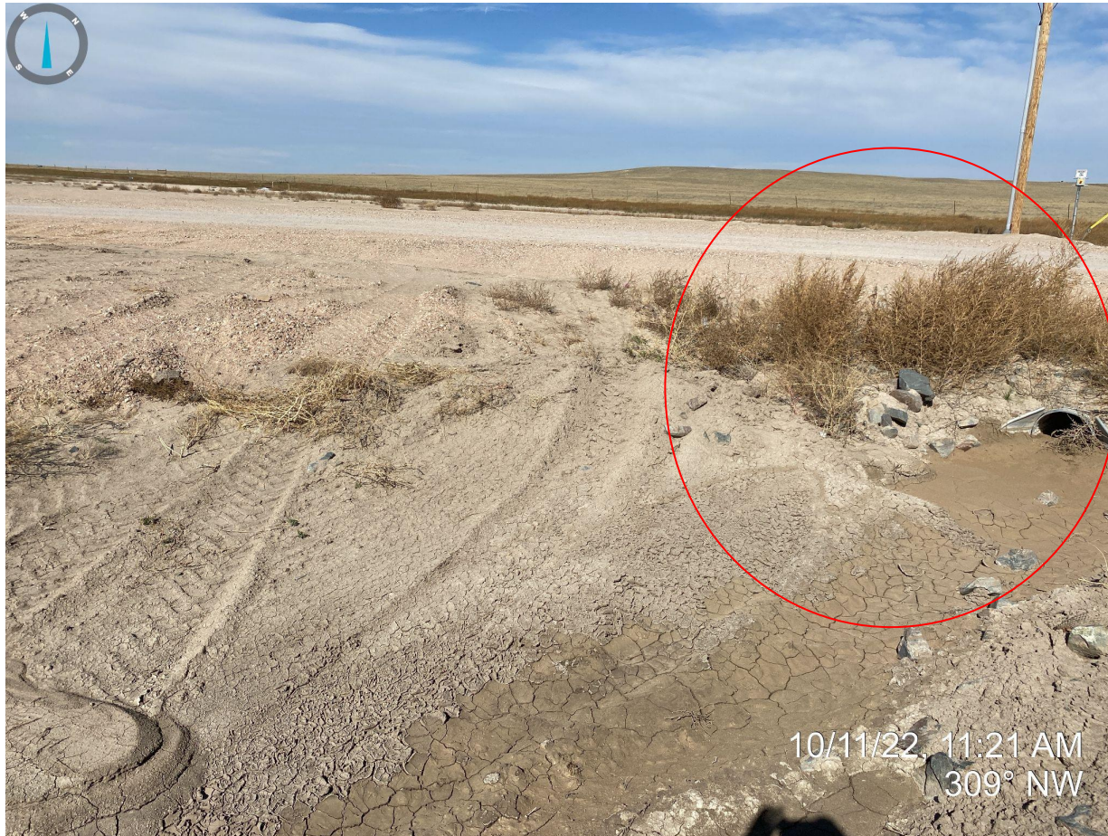
Photo 2. Taken near entrance, facing northwest. Photo illustrates outlet portion of culvert is partially buried with sediment. Annual weedy vegetation (kochia) also pictured.