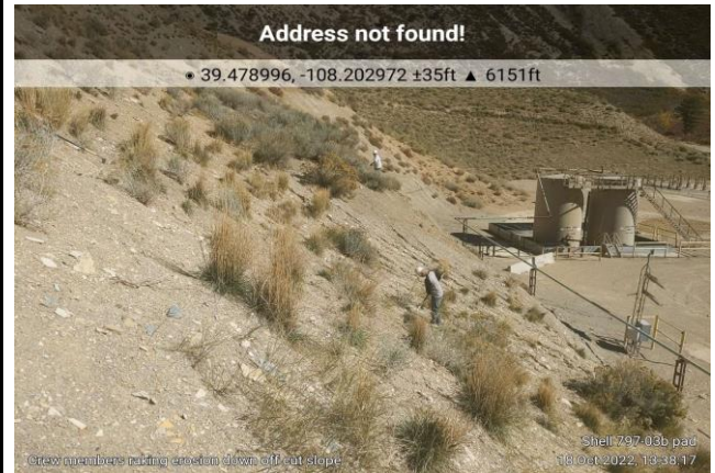
Removing Erosion by Hand on the Shell 797-03B Cut Slope