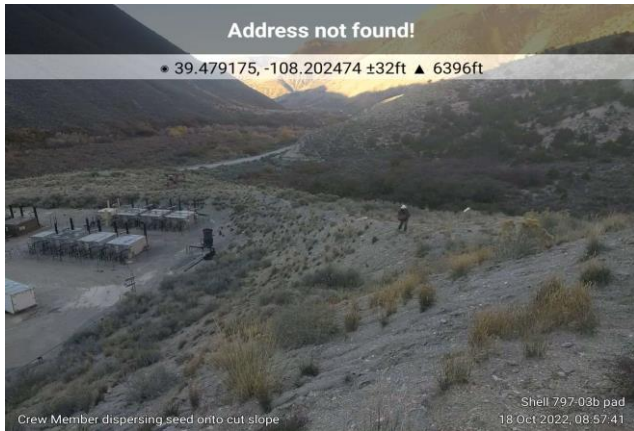
Broadcasting Seed on the Shell 797-03B Pad