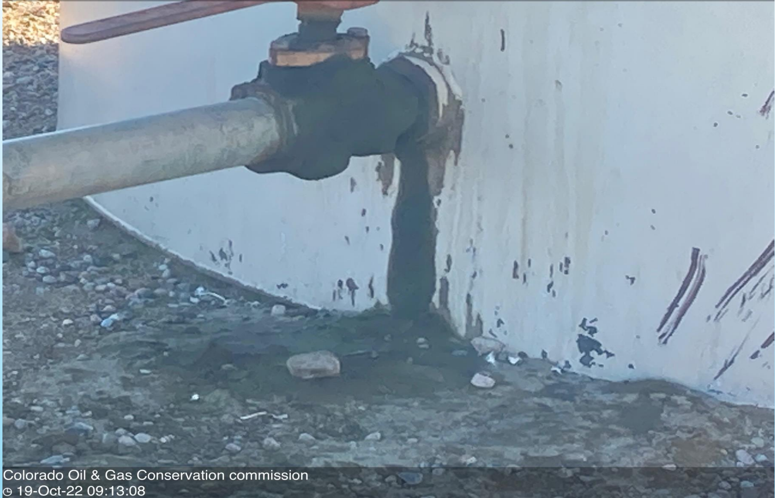
Colorado Oil & Gas Conservation commission © 19-Oct-22 09:13:08