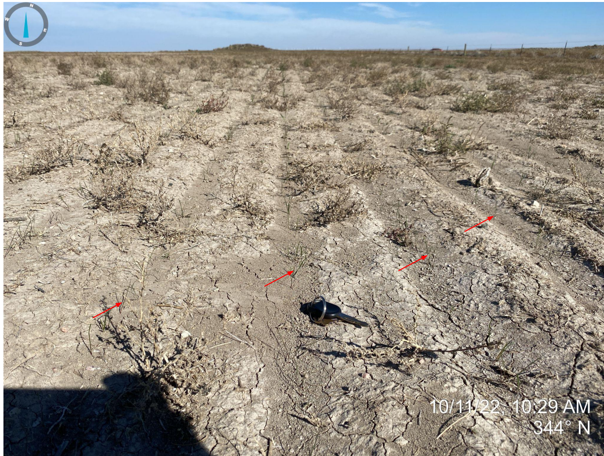
Photo 9. Close up photo of desirable germination observed in drill roads, taken on the eastern portion of the location. Key for reference scale; red arrows indicate germination.