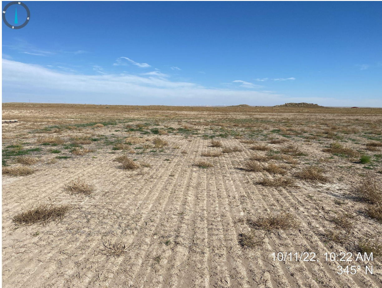
Photo 7. Taken from eastern portion, facing north. See comments in Photo 1.