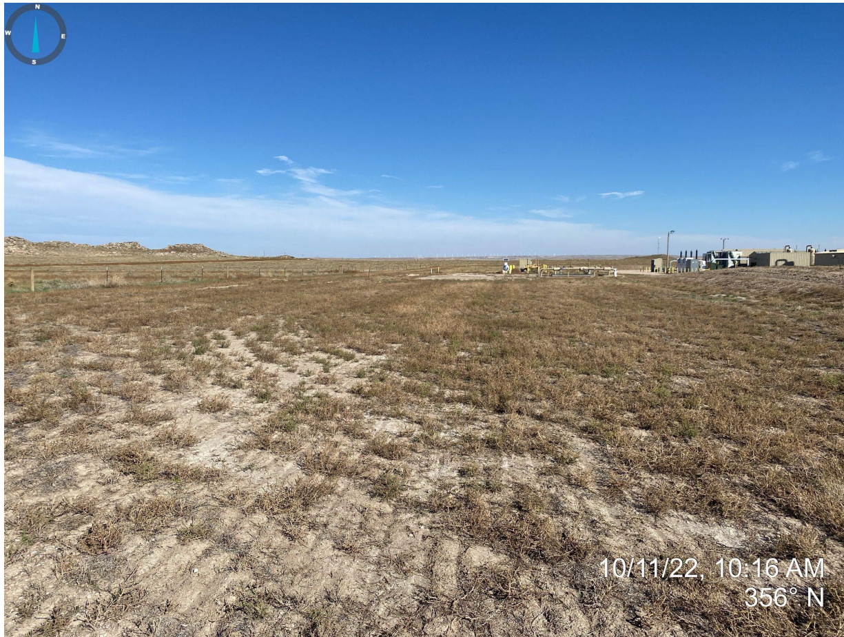
Photo 1. Taken from southwest portion of location, facing north. Photo illustrates annual weedy vegetation (e.g. kochia and russian thistle) was observed throughout the interim areas. Some desirable germination was observed in the drill rows (see Photo 9).