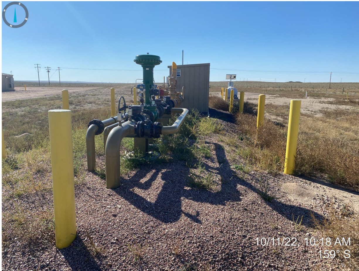
Photo 3. Taken from west portion of location, facing south. Annual weedy vegetation observed next to flowlines/meter shed location.