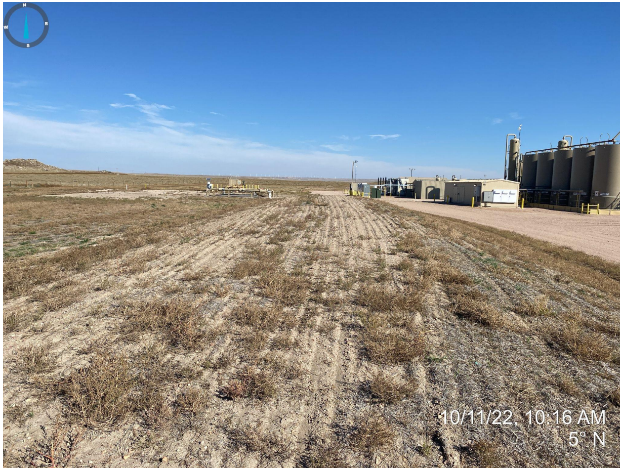
Photo 2. Taken from topsoil stockpile on the west end of location, facing north. See comments in Photo 1.