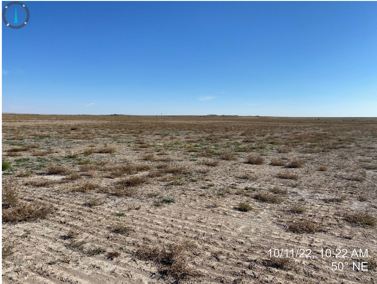
Photo 6. Taken from center portion of location, facing northeast. See comments in Photo 1.