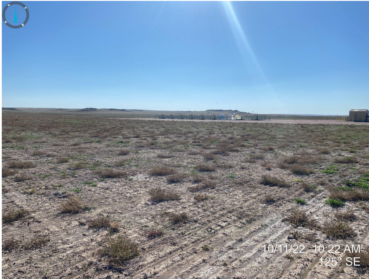
Photo 5. Taken from central, northern portion of location, facing southeast. See comments in Photo 1.