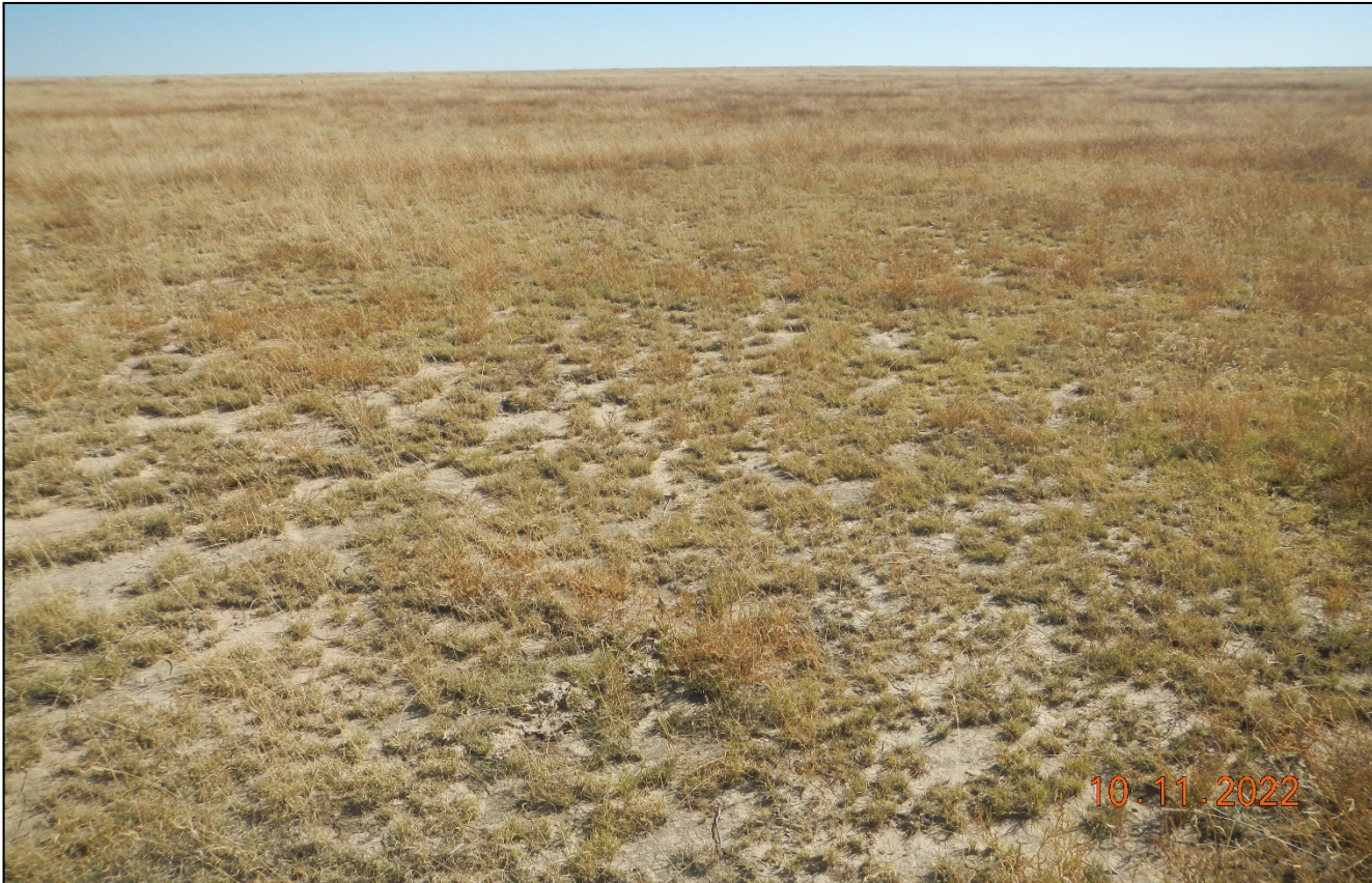
Photo 7. Facing southeast at the surrounding undisturbed reference area which shows a uniform vegetation cover consisting of Blue grama, Sand dropseed, Prairie threeawn among other species.