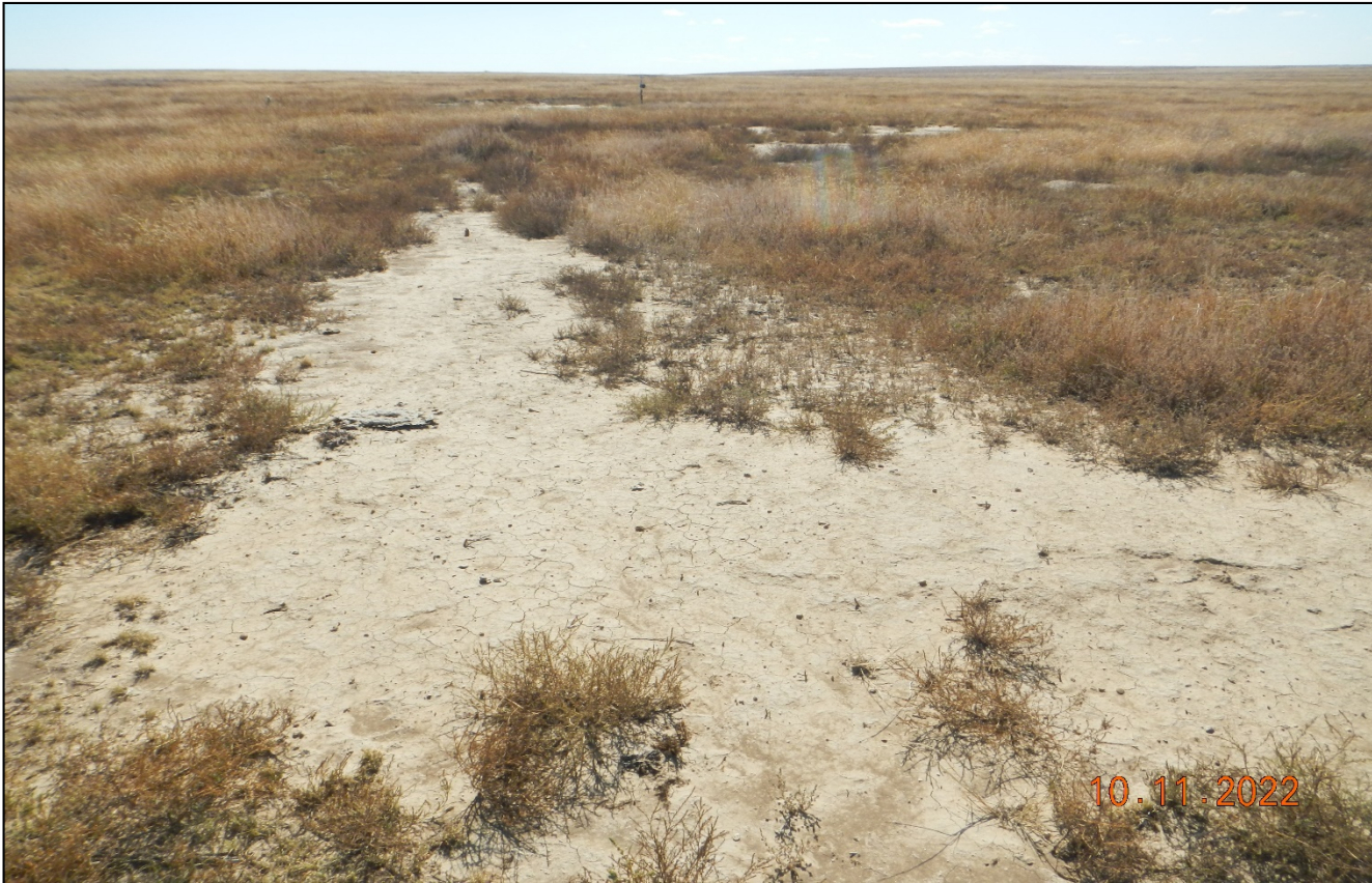
Photo 3. Facing southwest. This area appears to be the former tank battery site. There are likely soil issues preventing vegetation growth within this area.