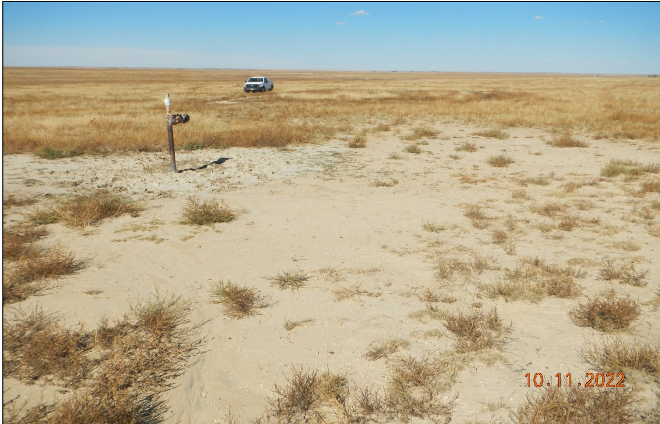
Photo 5. South side of the location facing north. There are areas with no vegetation growth and the abandoned pipe riser remains.