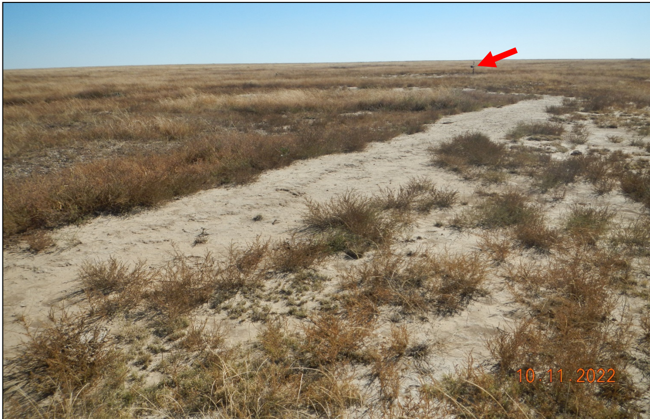
Photo 2. Facing south toward the location which has not been reclaimed. There are undesirable weeds throughout the location and areas bare vegetation. There is equipment that remains at the south side of the location shown at red arrow.