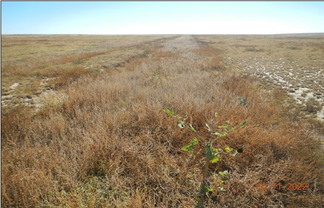
Photo 1. Facing southwest along the former access road. The road has not been reclaimed and consists of undesirable weed such as Kochia and Russian thistle.