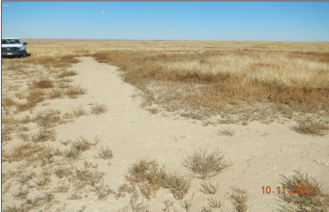
Photo 6. Facing northeast. This area appears to be the former tank battery site. There are likely soil issues preventing vegetation growth within this area.