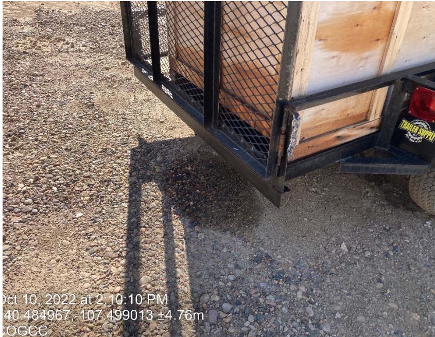
Something leaking out of the box on the trailer