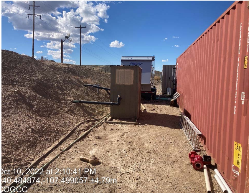
Debris and meter house