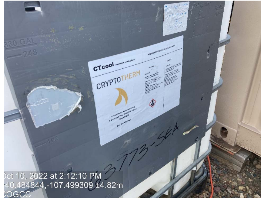
Chemical totes with out a secondary containment