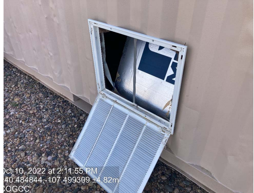
Open for wildlife to enter