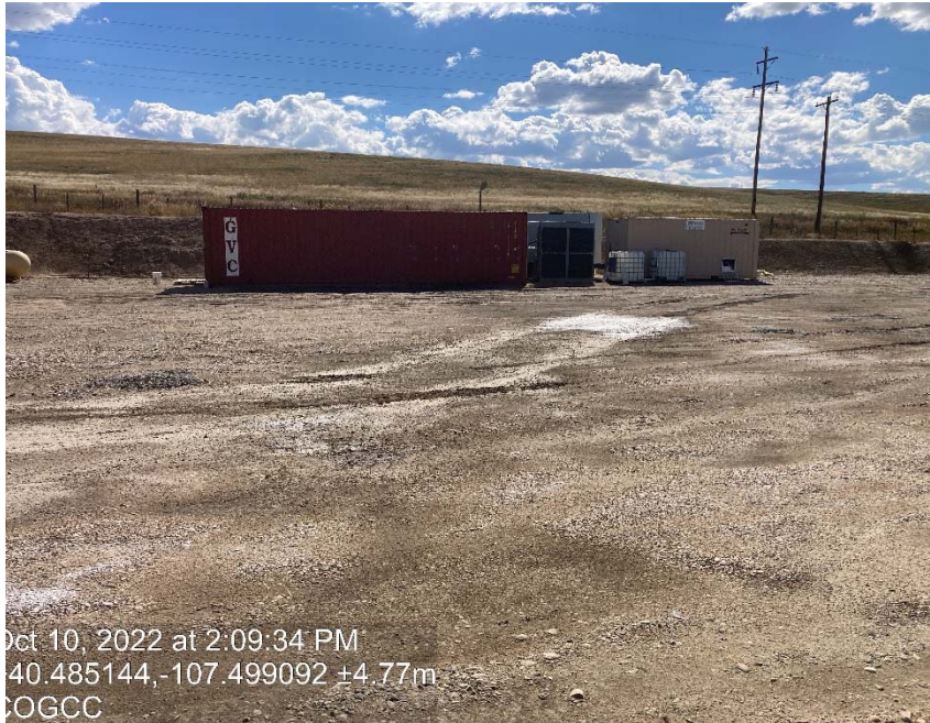
Bit coin equipment