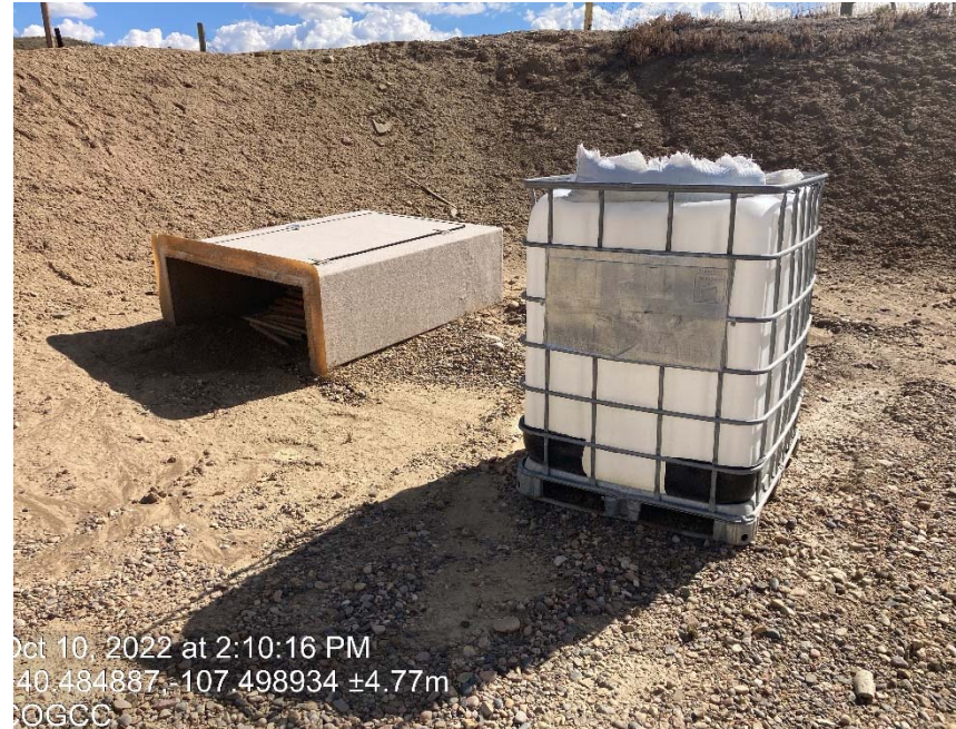
Debris/stored equipment/no secondary containment under container