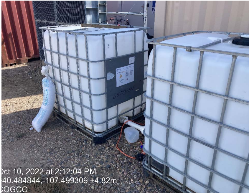
Chemical totes with out a secondary containment