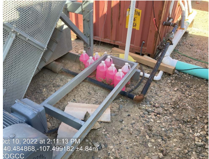
Debris and jugs full of fluid