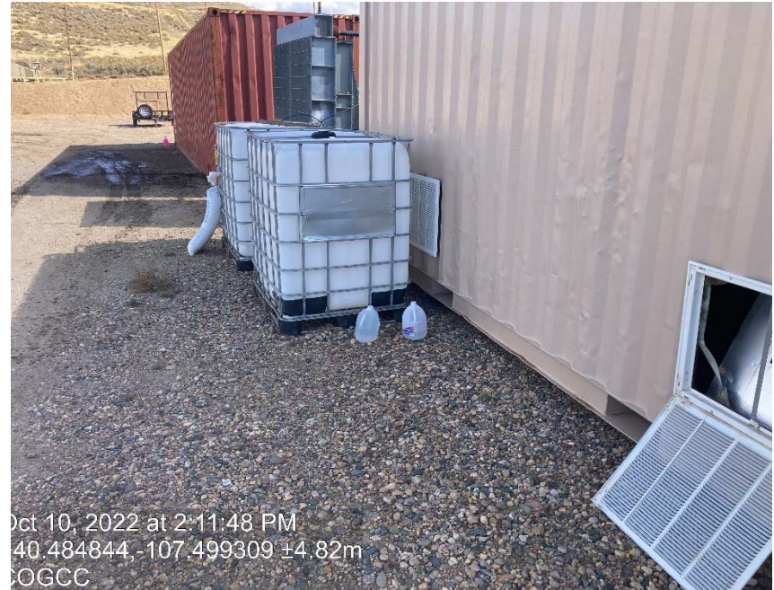
Chemical totes with out a secondary containment and debris