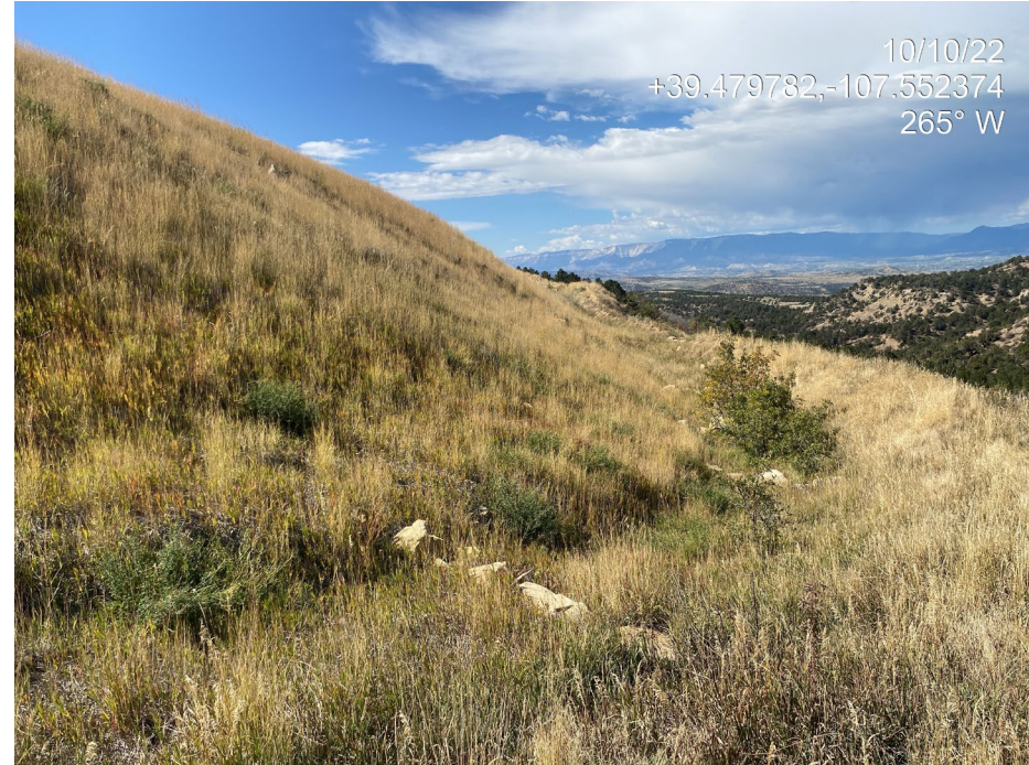
Photo 11. Photo taken from the north shows interim areas colonized by perennial grasses.