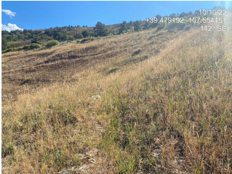
Photo 10. Photo taken from the south shows interim areas colonized by perennial grasses.