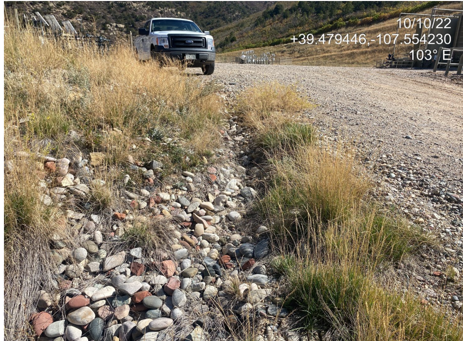
Photo 9. Photo taken from the northwest shows a ditch armored with smooth river rock.