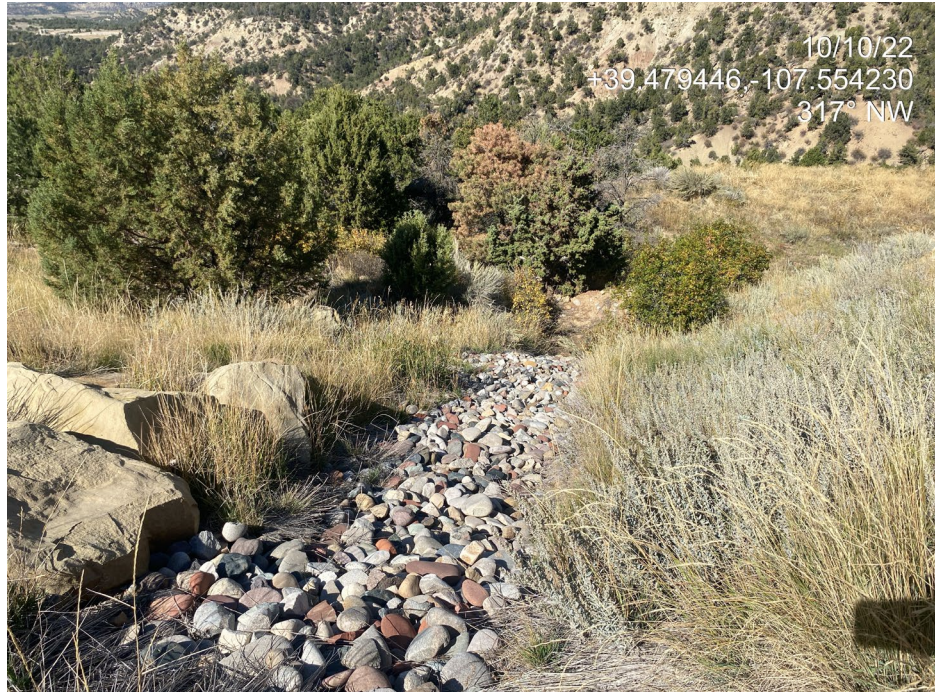
Photo 8. Photo taken from the northwest of the Location shows a slope drain armored with smooth river rock.