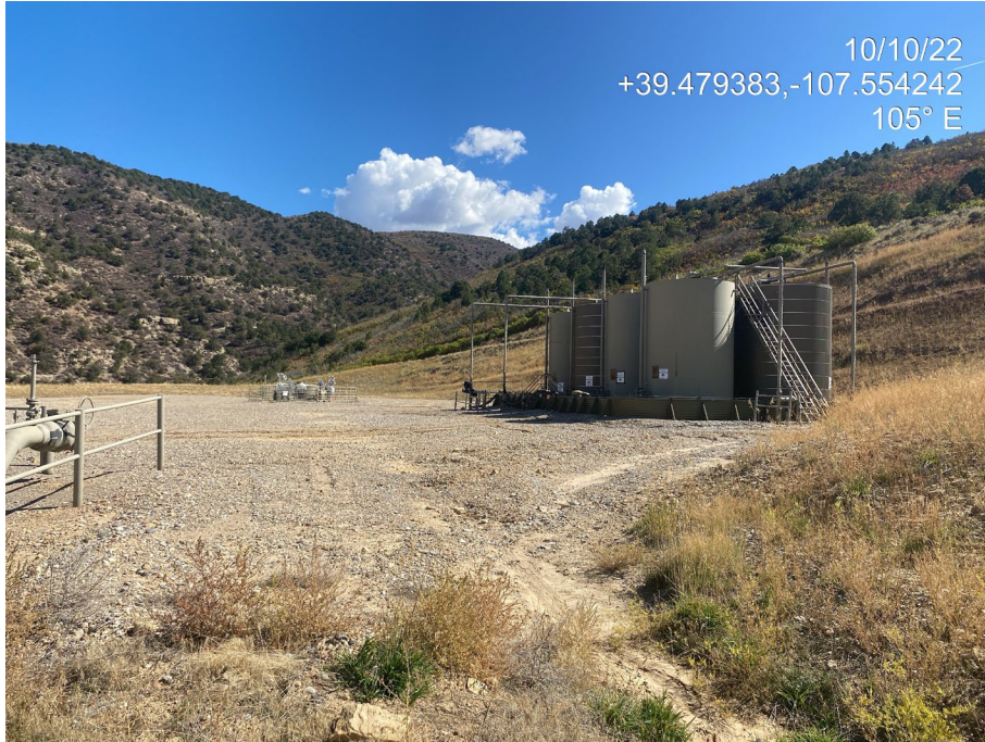
Photo 1. Photo shows production areas to the south.