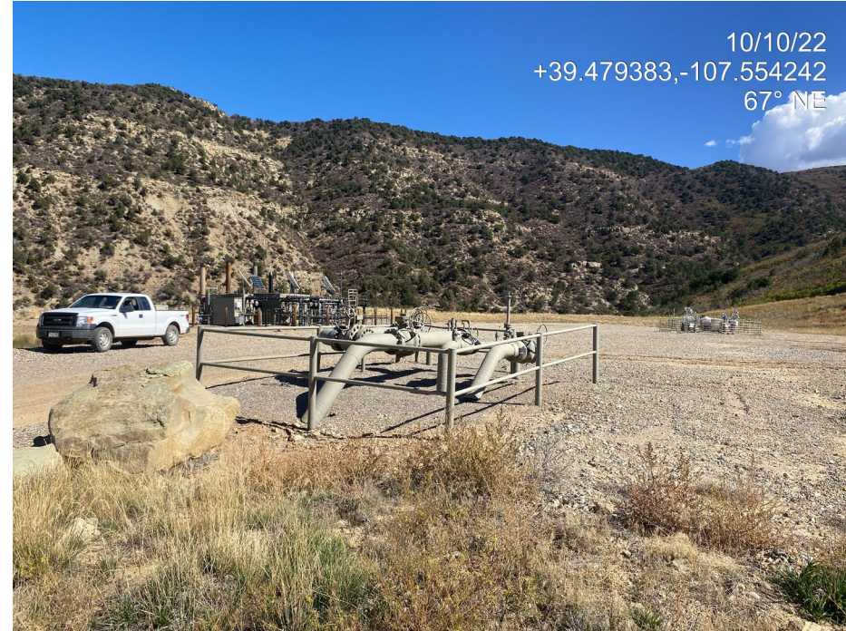
Photo 2. Photo shows production areas to the north.