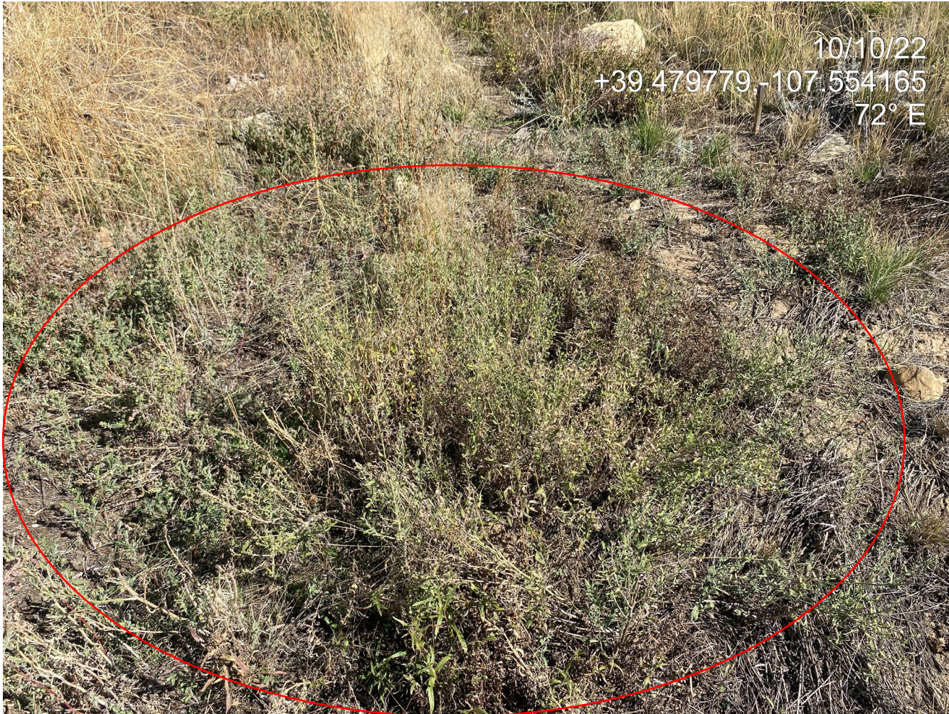
Photo 3. Photo taken from the northwest shows a patch of Russian knapweed.