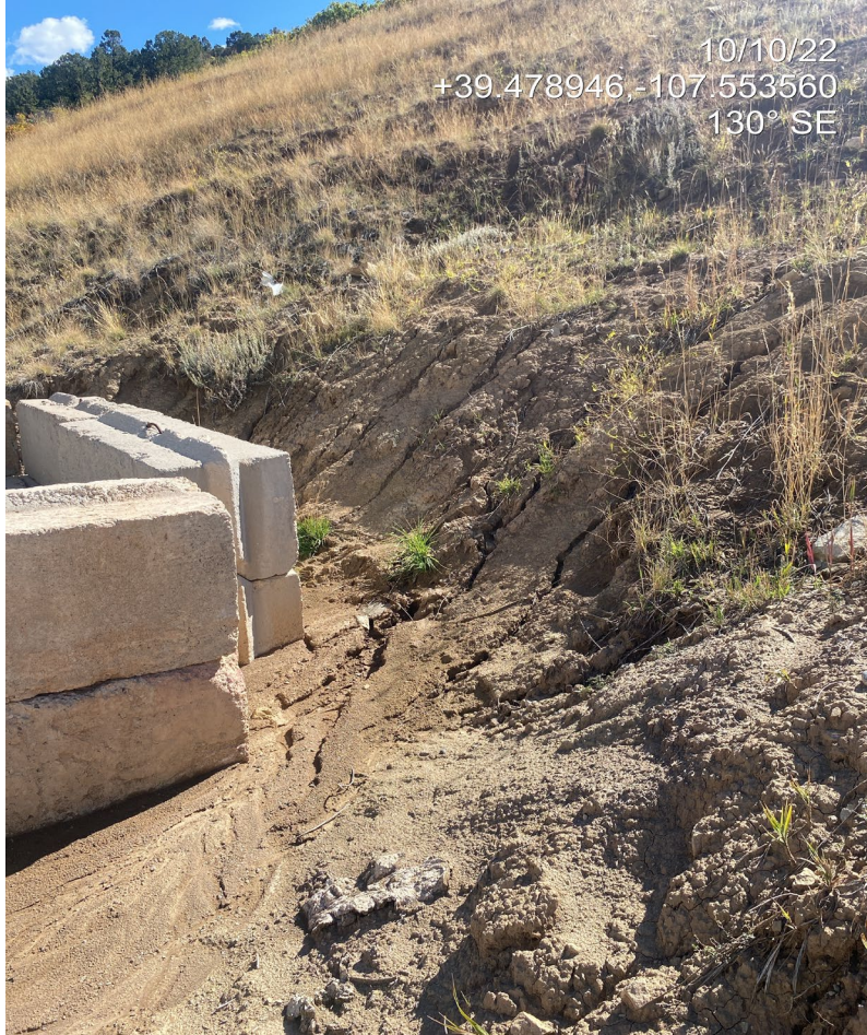
Photo 4. Photo taken from the south at the cut slope adjacent to the combustor shows rill erosion, sediment transport and slope degradation.