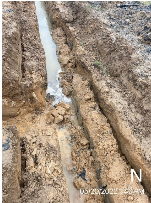
Pothole 02 (standing water from rainfall event)