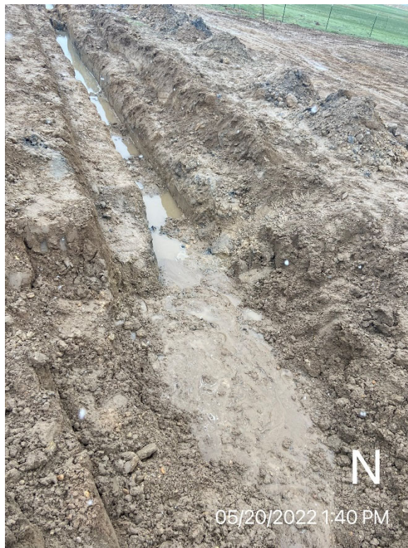
Pothole 01 (standing water from rainfall event)