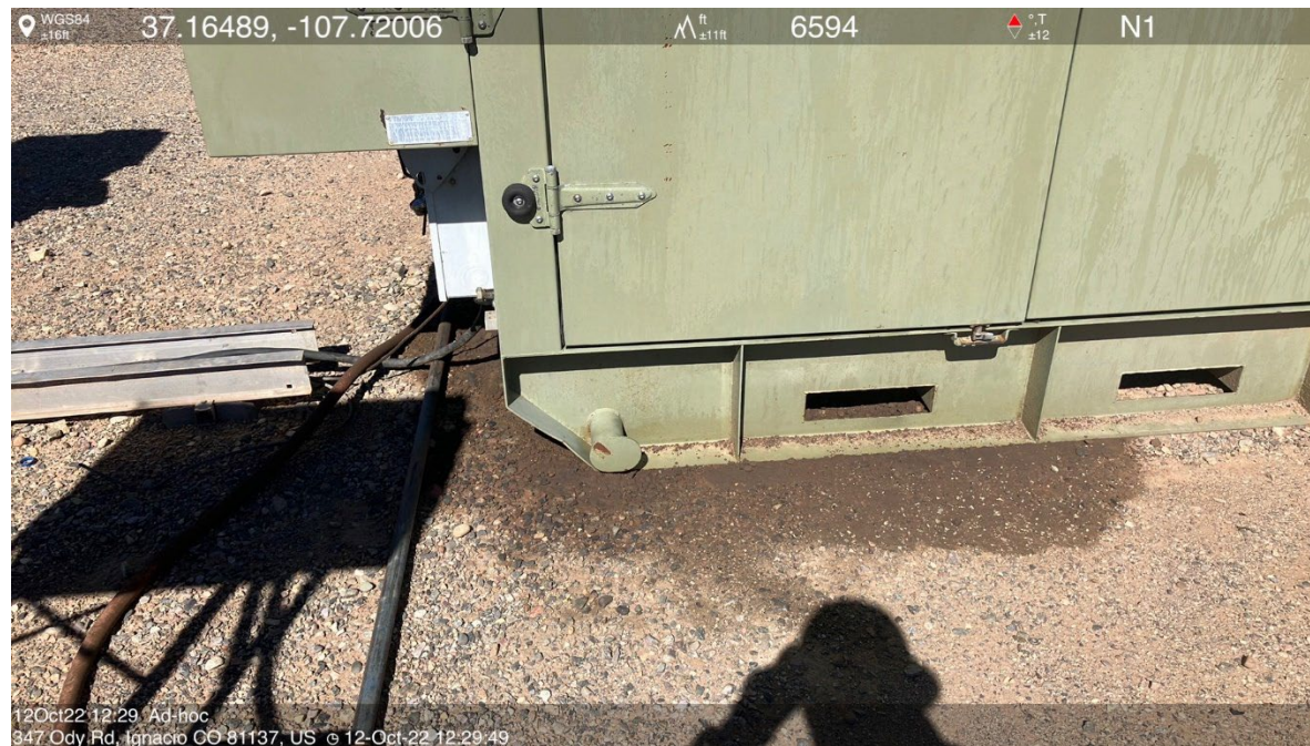
IMG 03 Impacted material