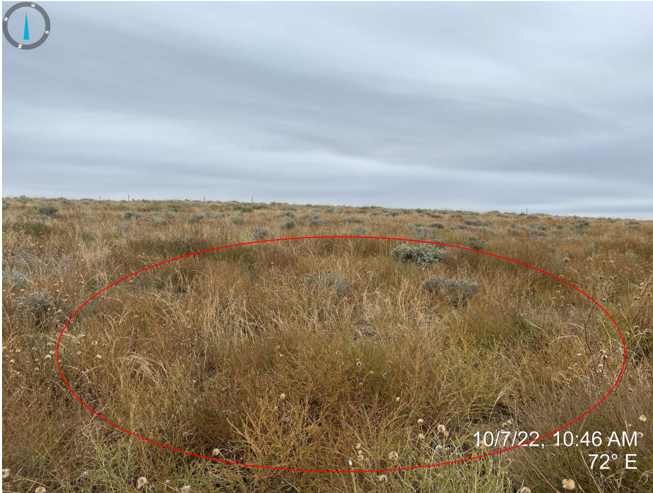
Photo 2. Taken near location, facing east. Photo shows annual weedy vegetation (e.g. kochia, russian thistle) throughout the location, outlined in red.