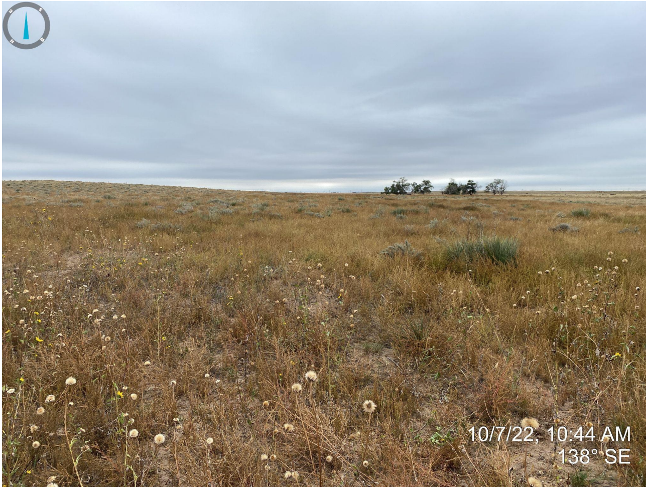
Photo 1. Taken near access road entrance, facing south east. Photo shows that access road appears to be contoured and regraded; no evidence of road base/gravel.