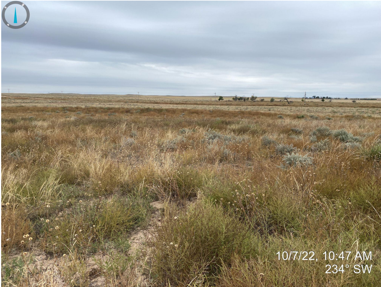
Photo 4. Taken from location, facing southwest. See comments in photo 2.