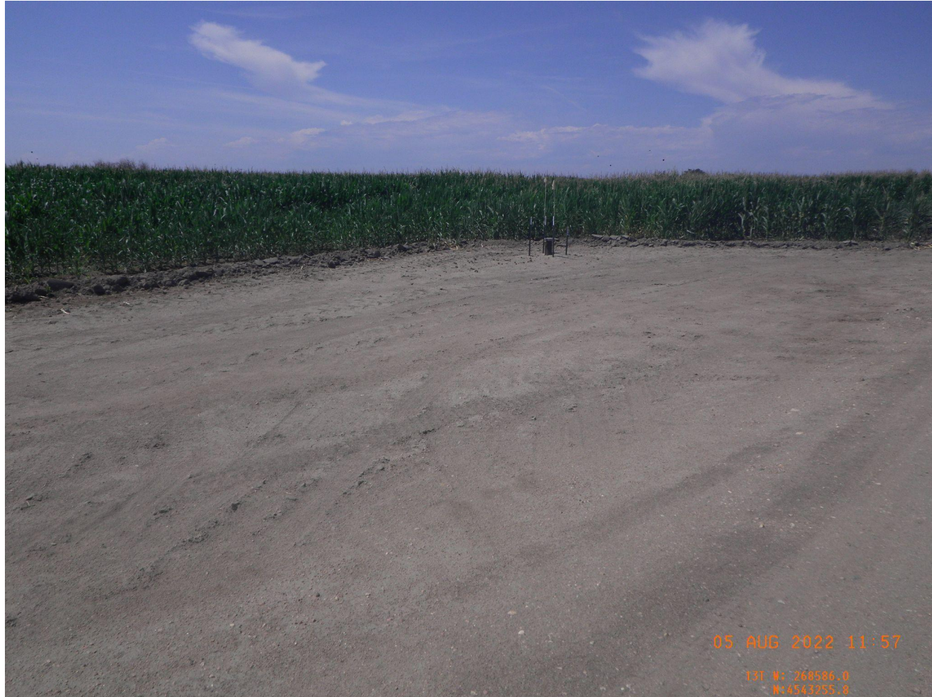
Photo 3. Overview photo of the tank battery taken at ground level from the western edge facing east.