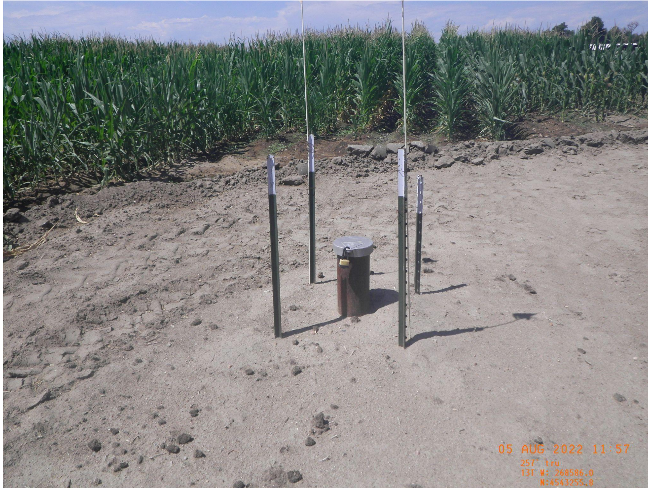
Photo 4. Monitoring well observed on site, however no open remediation at the location..