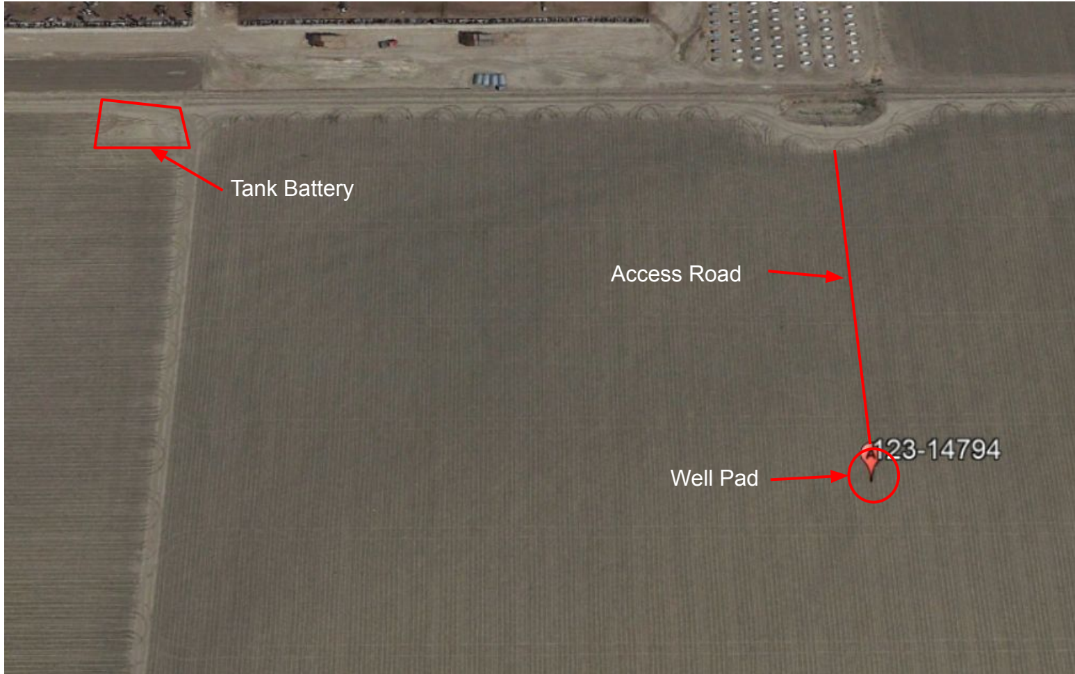
Photo 1. 2021 aerial imagery of the well pad, access road and tank battery.