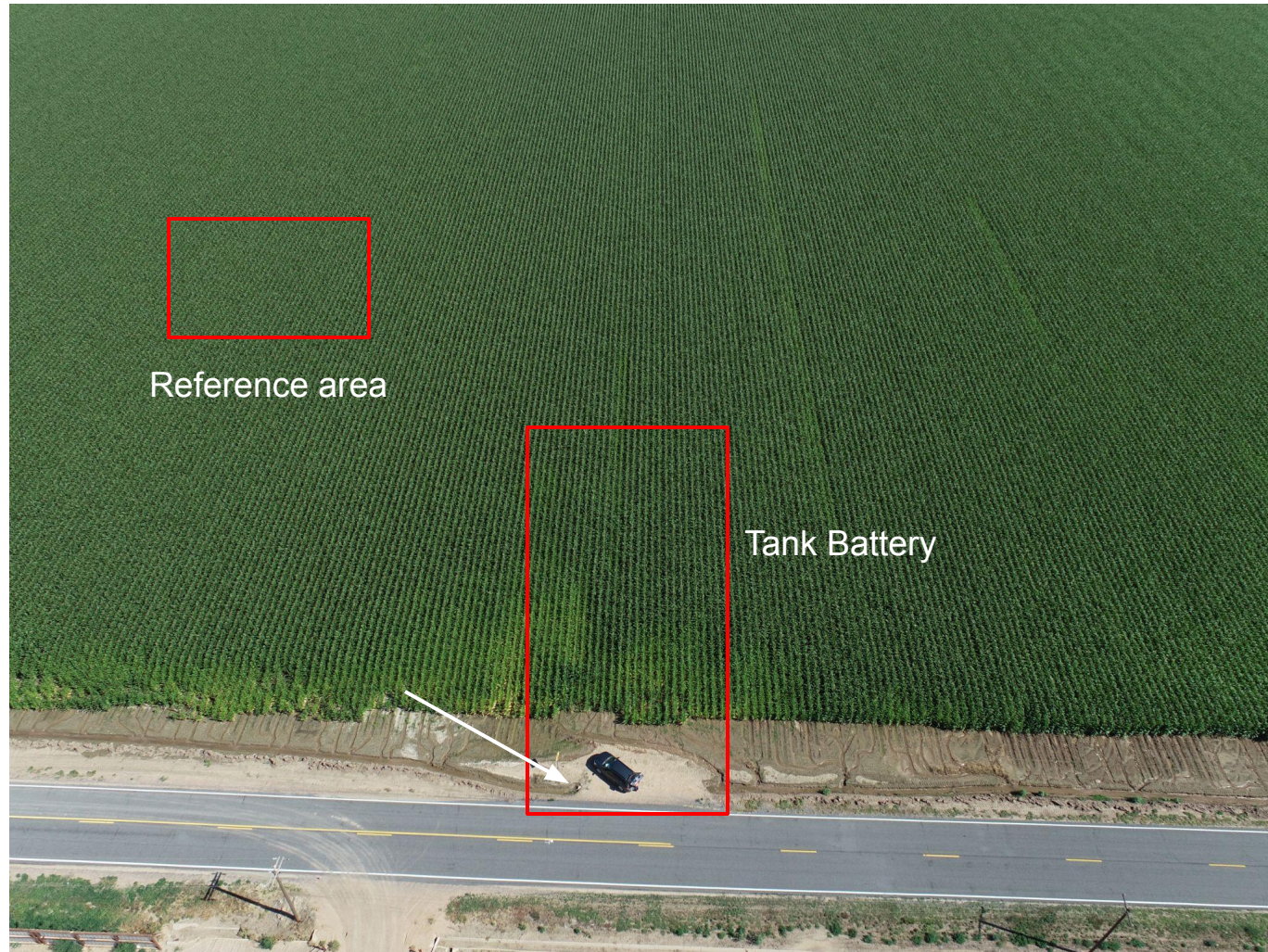
Photo 3. Overview photo of the tank battery and reference area. Note: tank battery access remains with a culvert indicated by white arrow (see photo 4). Remaining tank battery disturbance appears consistent with adjacent crop reference area.