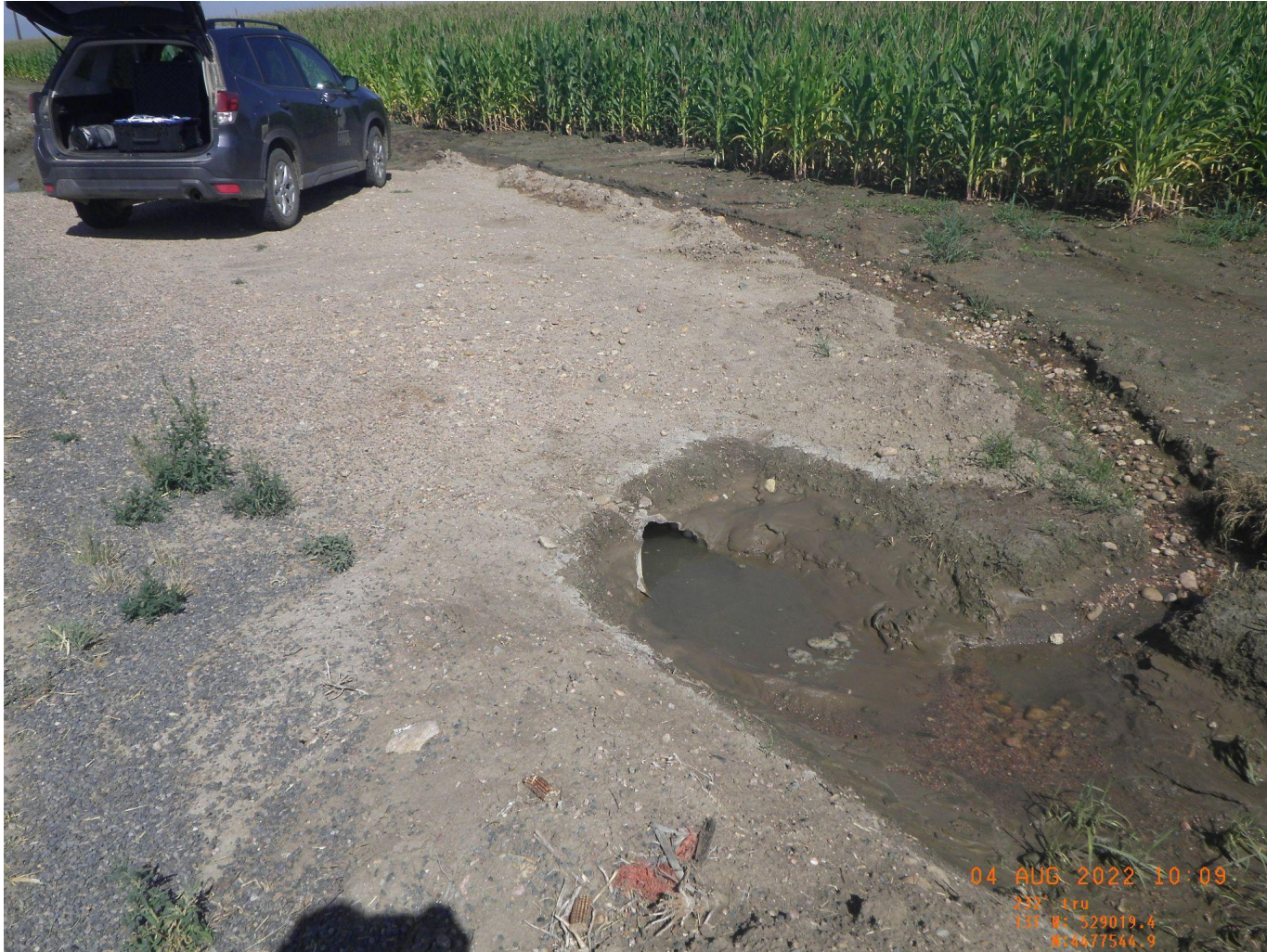
Photo 3. Ground photo of the tank battery access point and culvert that remain on site.