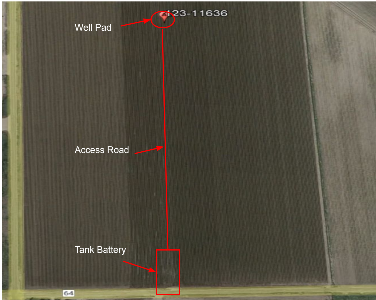
Photo 1. 2021 aerial imagery of the well pad, tank battery and access road.