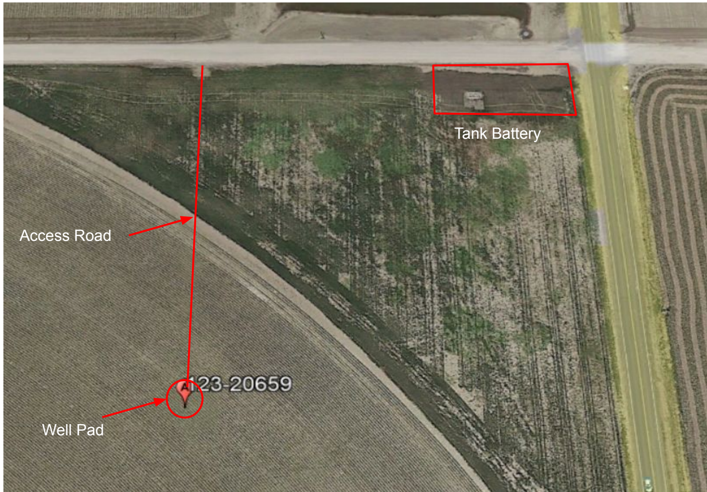
Photo 1. 2021 aerial imagery of the access road, well pad and associated tank battery.