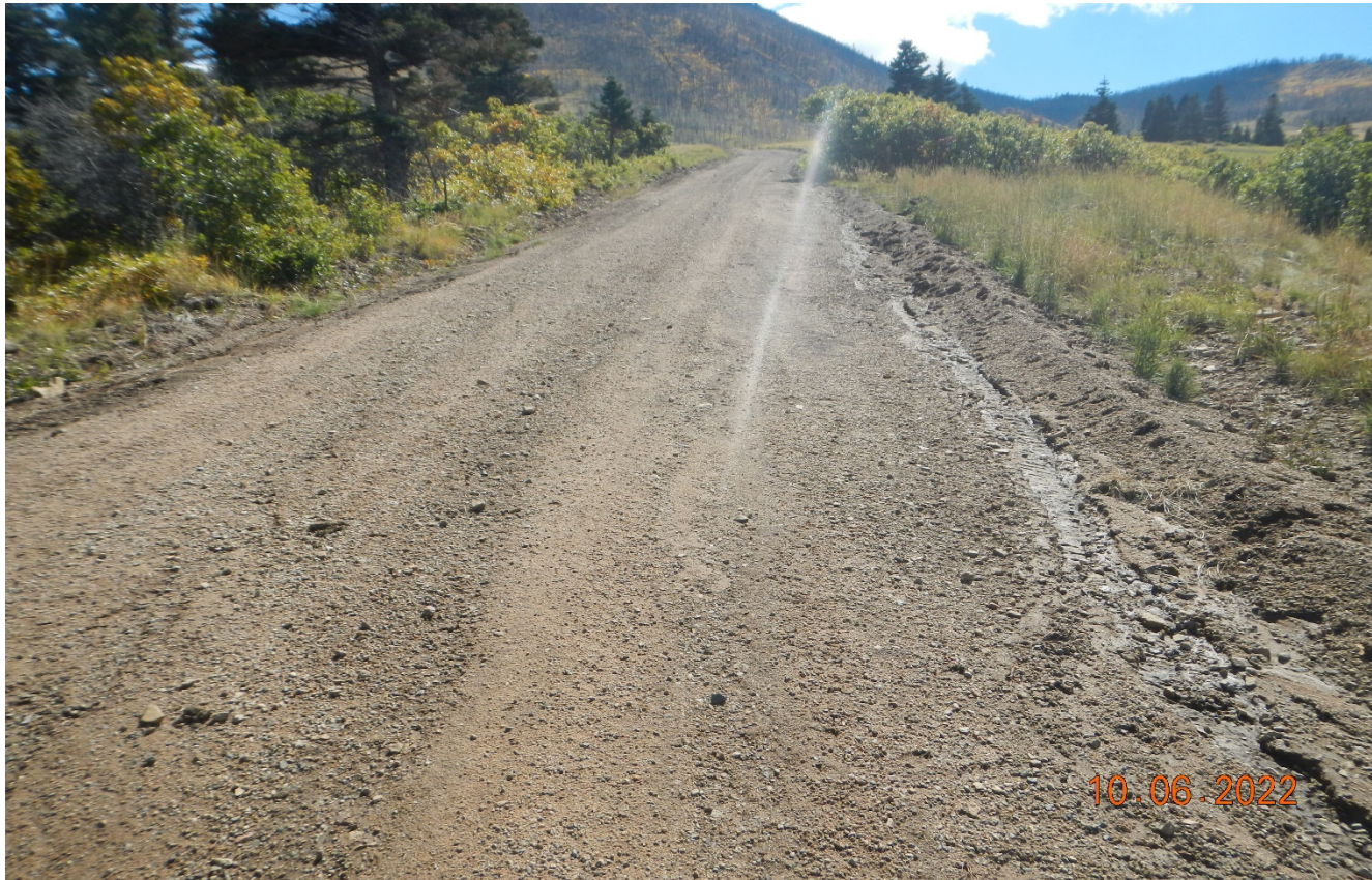
Photo 1. Facing south along the access road. There are signs of erosion along the steep grade of the road. Stormwater should be diverted off the road to reduce erosion.