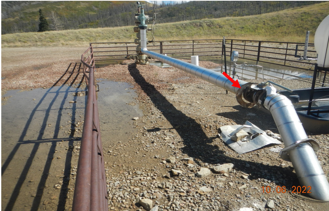
Photo 4. There was an audible noise coming from this area. Does not appear to have been fixed.