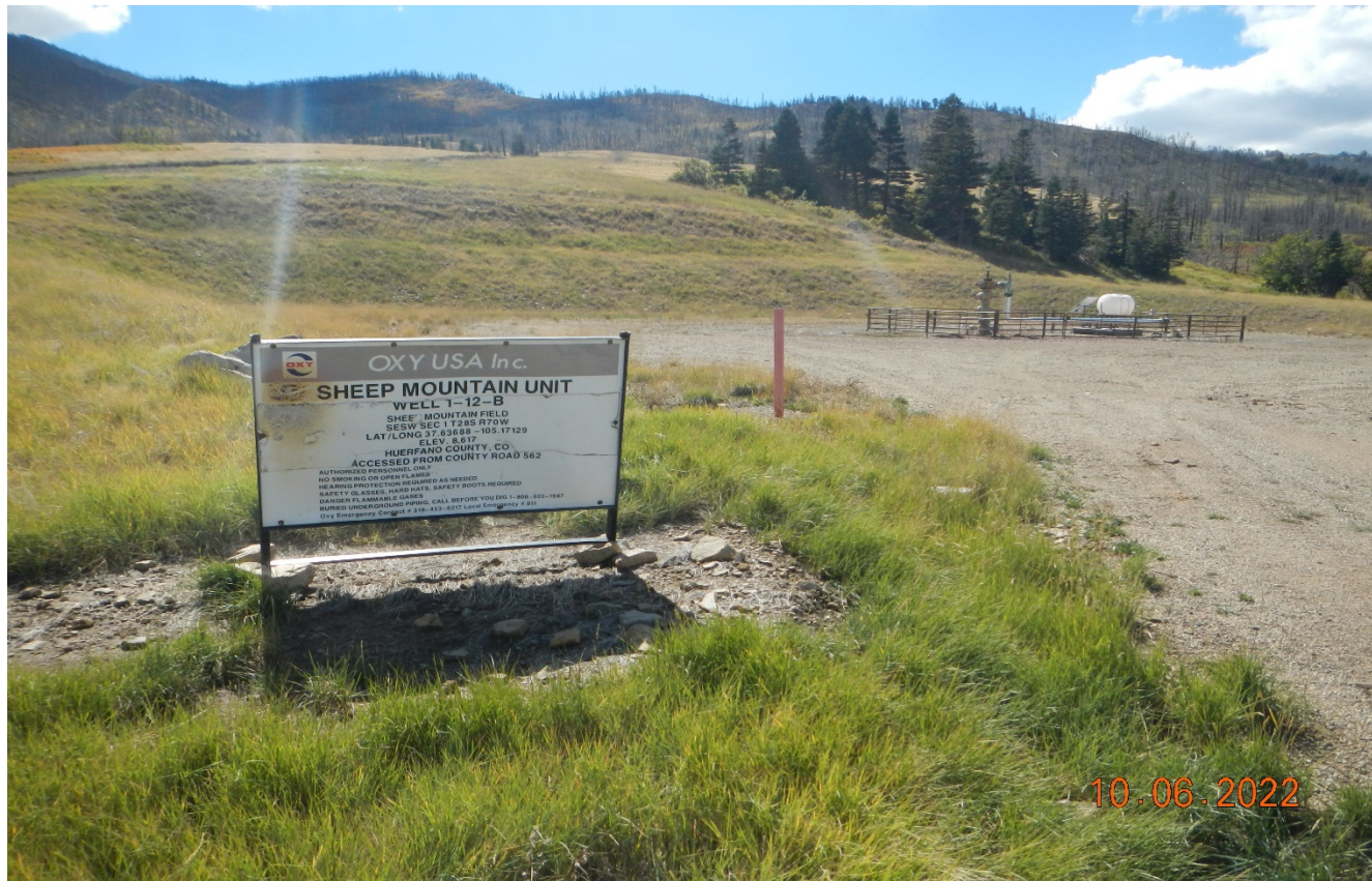
Photo 2. Sign is posted at the location.