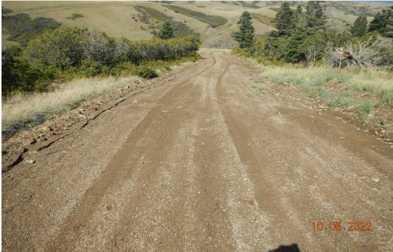
Photo 1. Facing back north the steep grade of access road. This road has eroded in the past and is susceptible to erosion. BMP's need to be installed along the road to prevent erosion e.g. water bars, diversion ditch, checkdams.