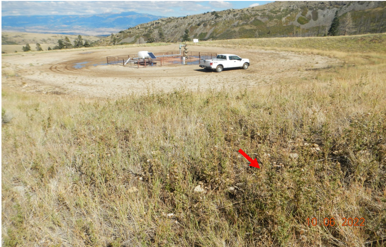
Photo 6. There are noxious weeds at the southwest corner of the location. Red arrow → Canada thistle