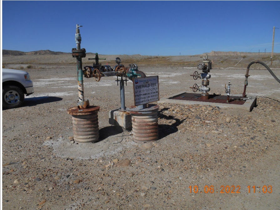
Injection wellhead during MIT Temporarily Abandoned.