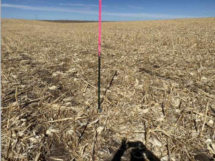
Revenant #1 • North View

SHL: NW-1/4 of NE-1/4 Section 07-T3S-R51W-6 th PM Washington County, Colorado