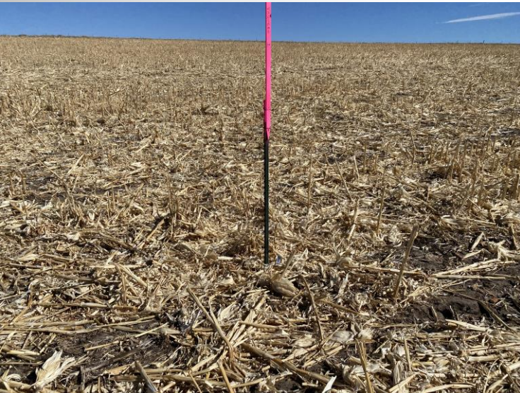
Revenant #1 • East View