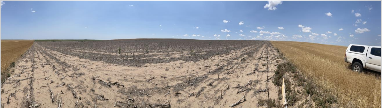
Revenant #1 • South View