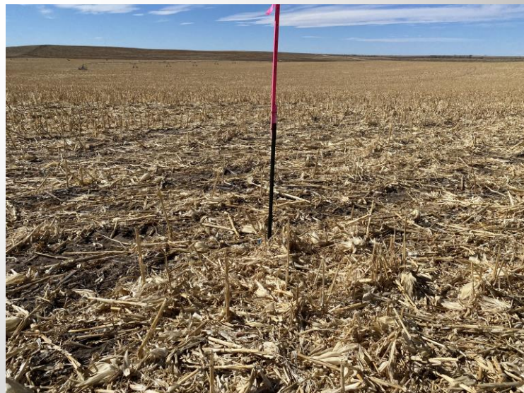
Revenant #1 • West View