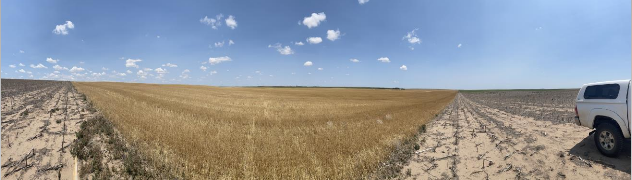
Revenant #1 • North View

SHL: SW-1/4 of NE-1/4 Section 7-T3S-R51W-6 th PM Washington County, Colorado