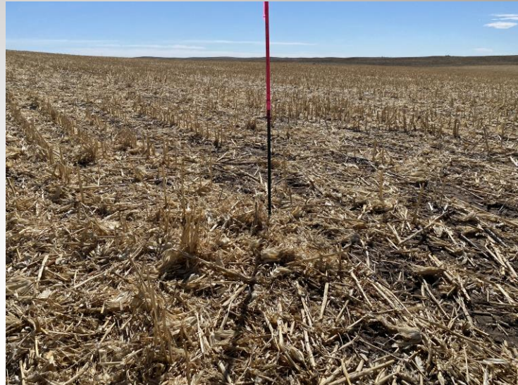
Revenant #1 • South View