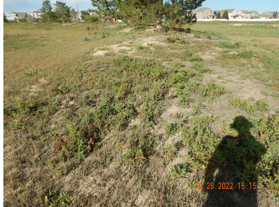
Photo 7. Photo taken from the southeastern berm, facing North. Photo illustrates Canada thistle growth throughout the berm which was observed throughout other portions of the berm to the north and west.