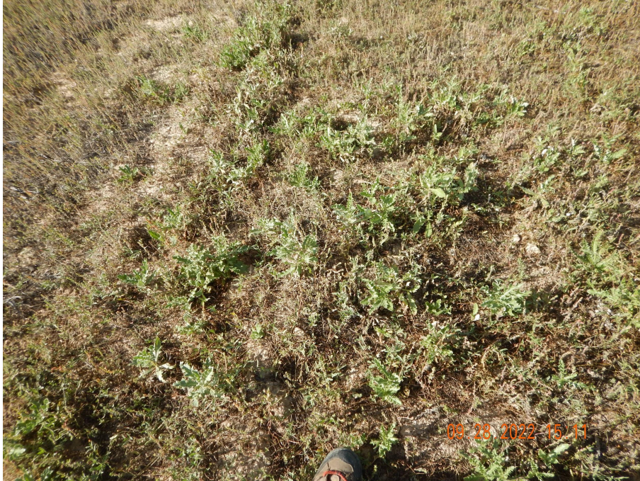
Photo 6. Photo taken from a portion of the location. Photo illustrates a List B Colorado noxious weed, Canada thistle.