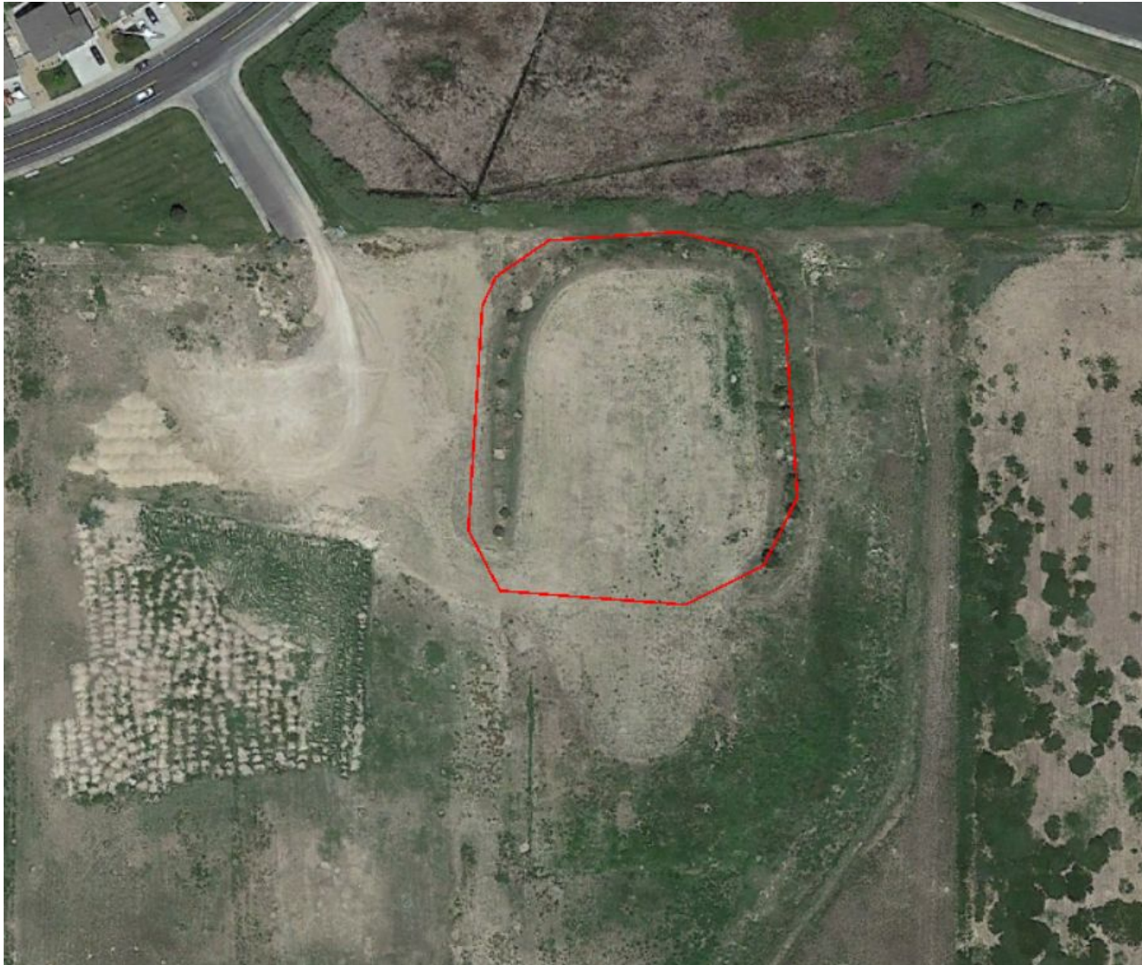
Photo 2. Google Earth aerial imagery from 6/11/2021 post plugging operations. Photo illustrates the parcel and location are still associated with other land disturbances. The red polygon is the approximate footprint of the RBF/15B location.