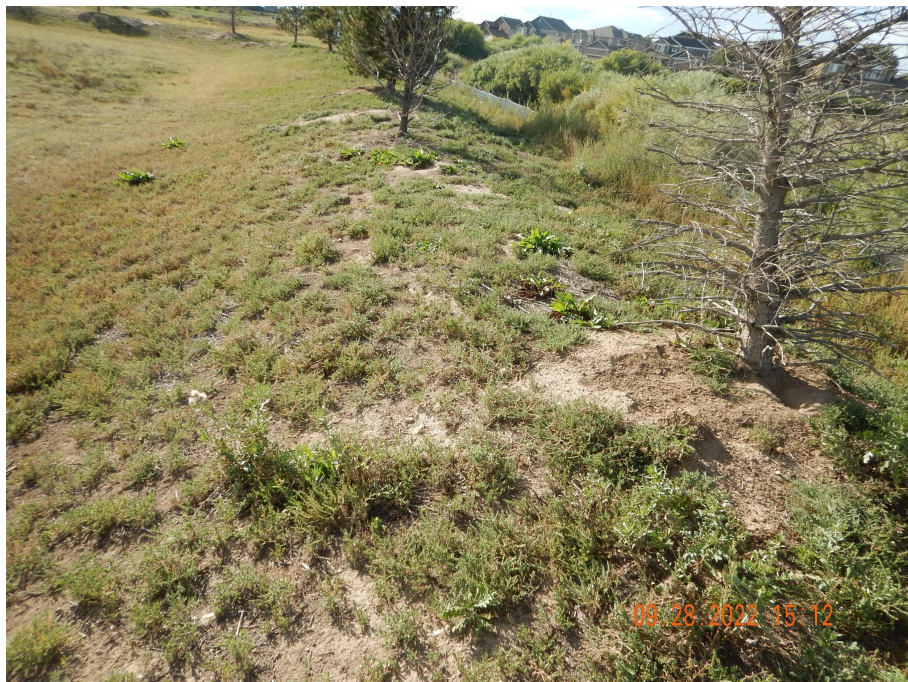
Photo 8. Photo taken from the northeastern berm, facing West. See comments under Photo 7.