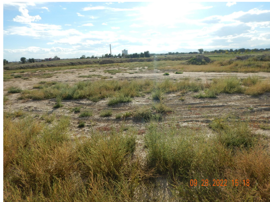
Photo 11. Reference photo taken west of the location, facing West. See comments under Photo 2.