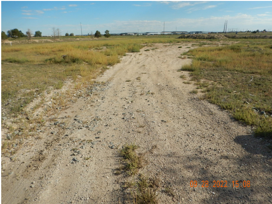
Photo 4. Photo taken from the access road entrance, facing South. Photo illustrates other land disturbance activities are evident and continue.