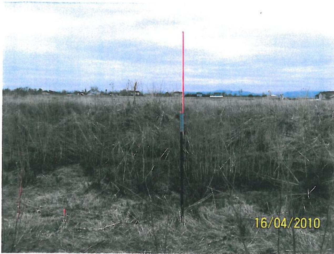
Figure 4: RBF 15B LOOKING WEST (SE1/4 SW1/4 SEC15 T6N R67W, 4-16-10)

Photo 3. Location Picture submitted as part of the permitting process. Photo illustrates the vegetation appears to consist of weedy, annual vegetation.