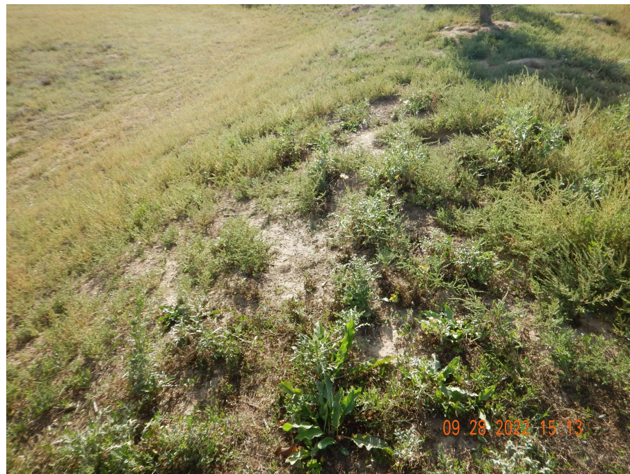
Photo 9. Photo taken from the northern berm, facing West. See comments under Photo 7.