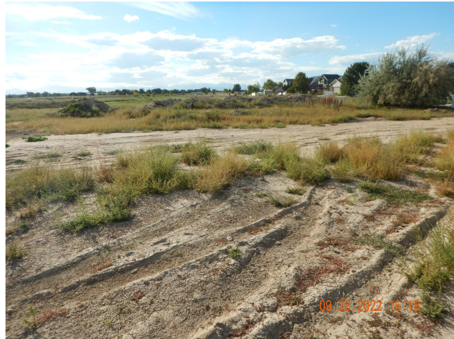
Photo 5. Photo taken from the access road entrance, facing West. See comments under Photo 4.