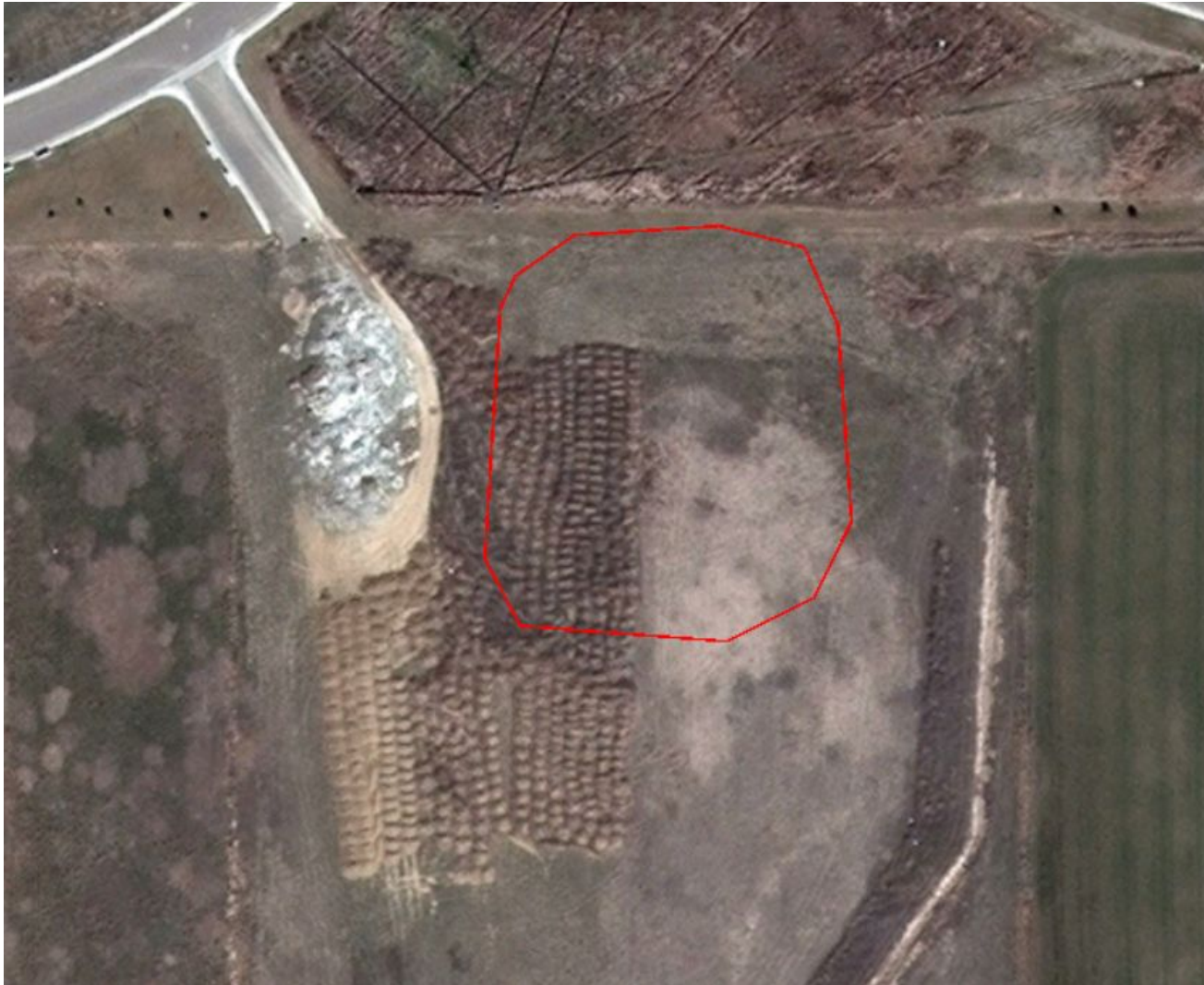
Photo 1. Google Earth aerial imagery from 4/7/2010 prior to oil and gas operations. Photo illustrates the parcel and location were associated with other land disturbances. The red polygon is the approximate footprint of the RBF/15B location.