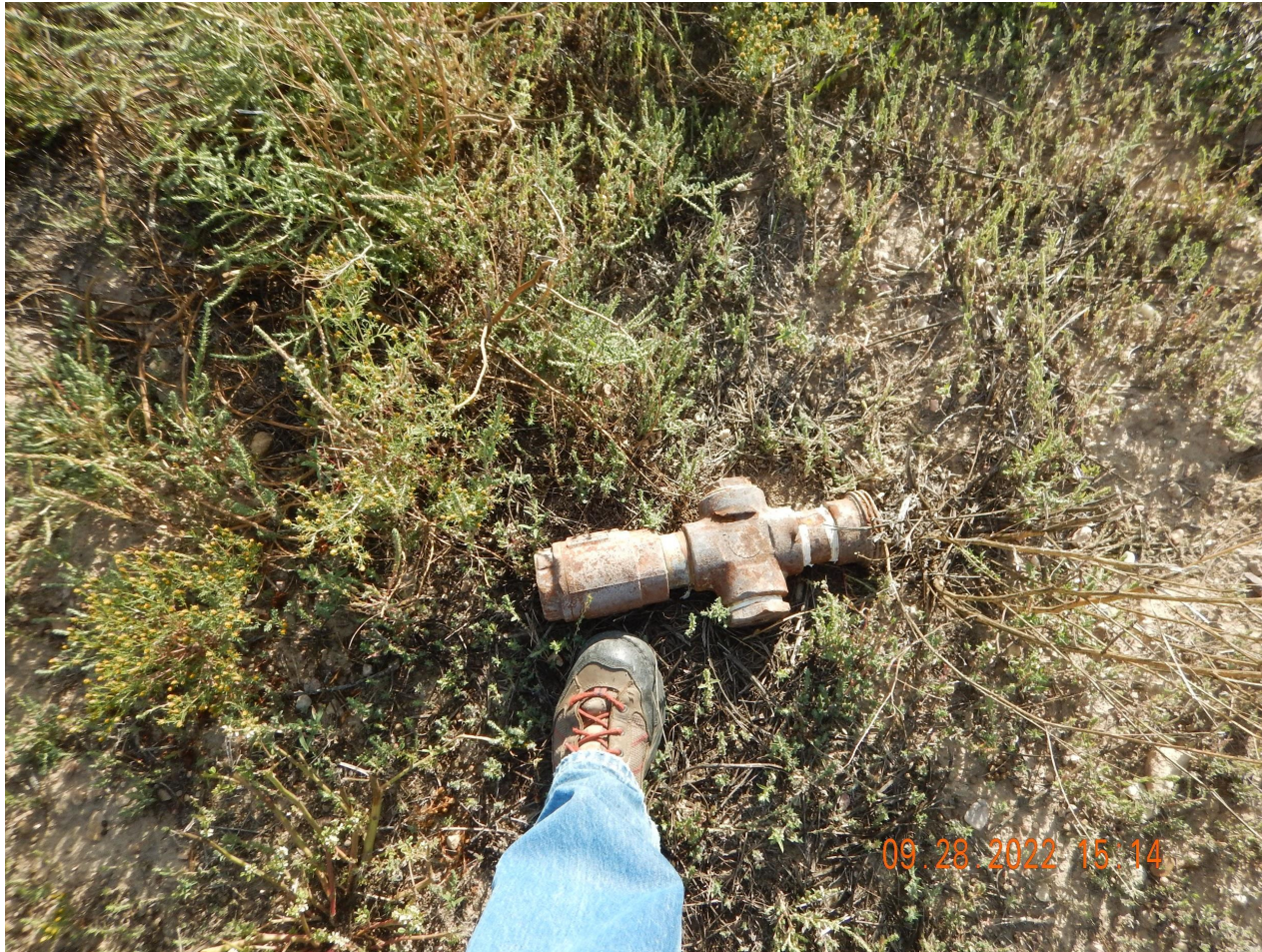
Photo 12. Photo taken from location illustrates not all debris has been removed.