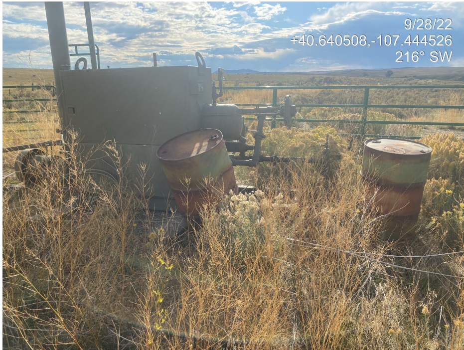
Photo 5. Photo shows containers without secondary containment.