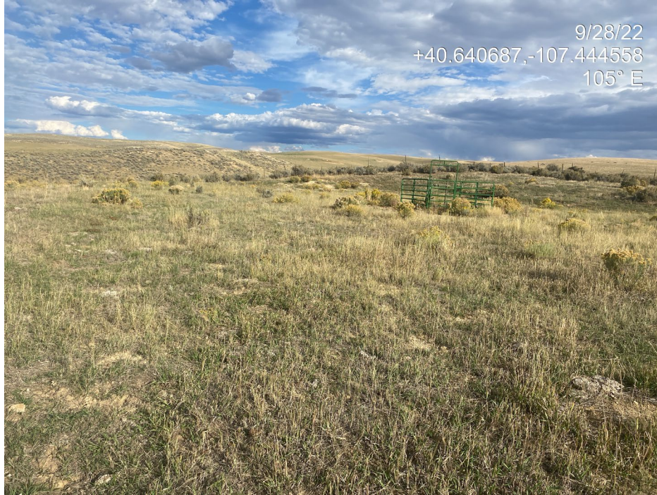
Photo 9. Photo taken from the north of the Location show areas no longer in use vegetated with perennial grasses.