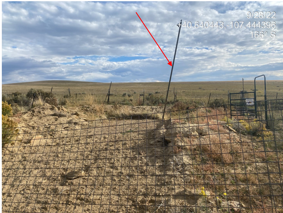
Photo 3. Photo shows where a tank has been removed from the tank battery. Area no longer in use must be reclaimed and equipment must be removed, including riser/pipe (red arrow), fencing, etc.