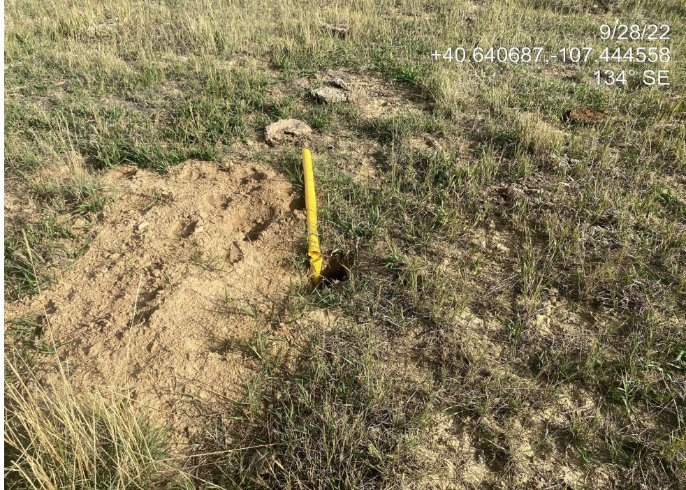
Photo 7. Photo shows an anchor marker in disrepair. No anchor observed. Marker is now trash/debris.