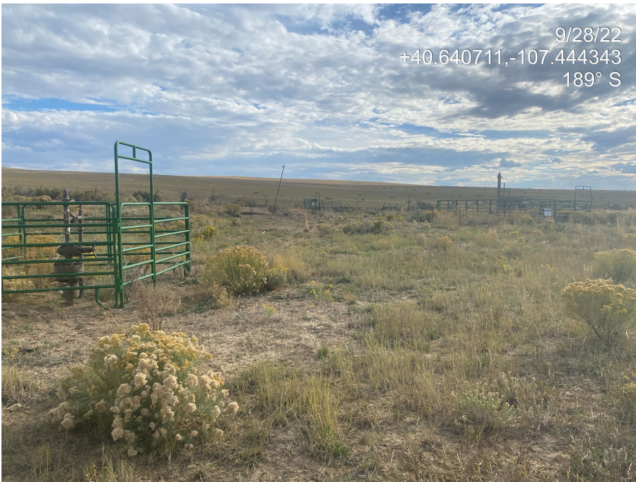
Photo 1. Photo taken from the north shows an overview of the Location.