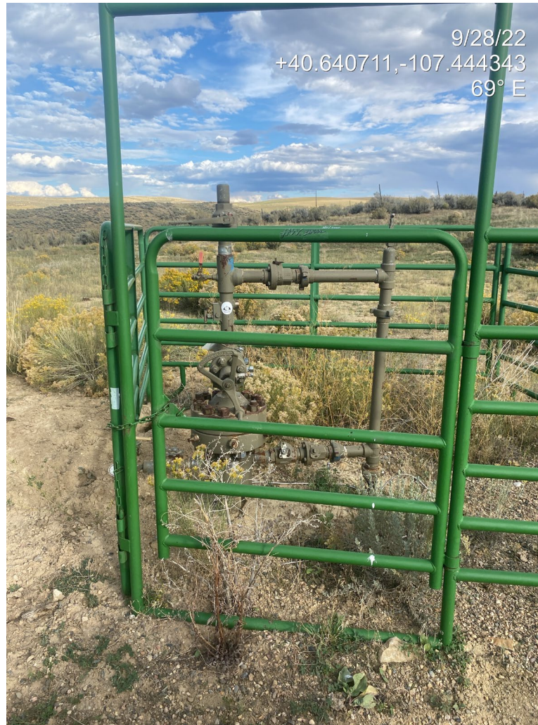
Photo 2. Photo taken from the center of the Location shows the wellhead.