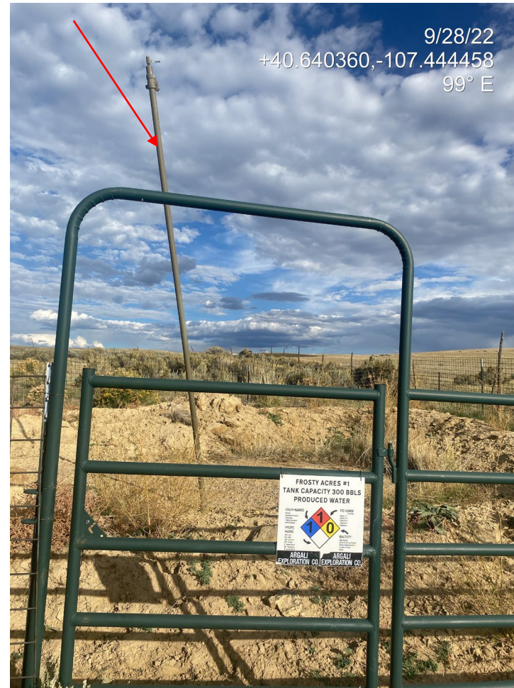
Photo 4. Refer to Photo 3 comment.