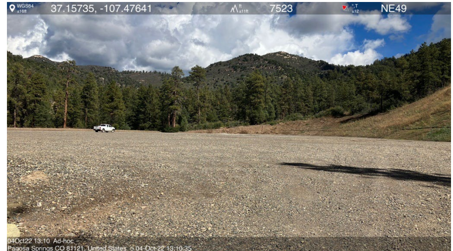
IMG 02 Location overview