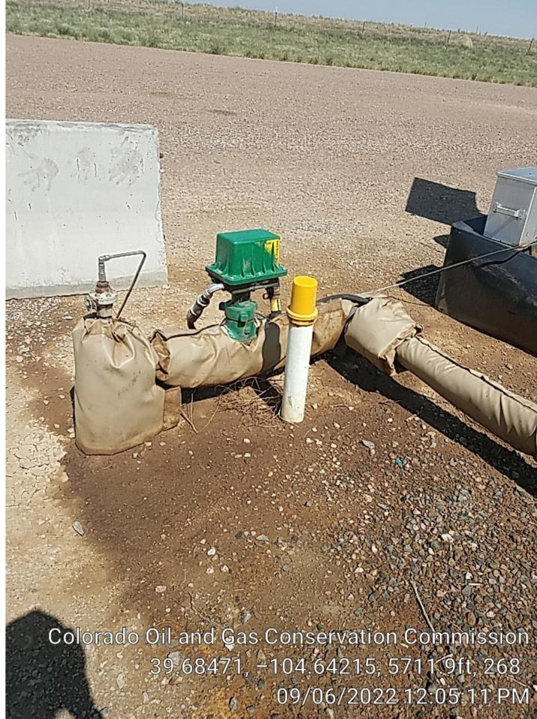
Stained soil at Sunset wellhead.

Colorado Oil and Gas Conservation Commission 39.68471, -104.64215, 5711.9ft, 268 09/06/2022 12:05:11 PM