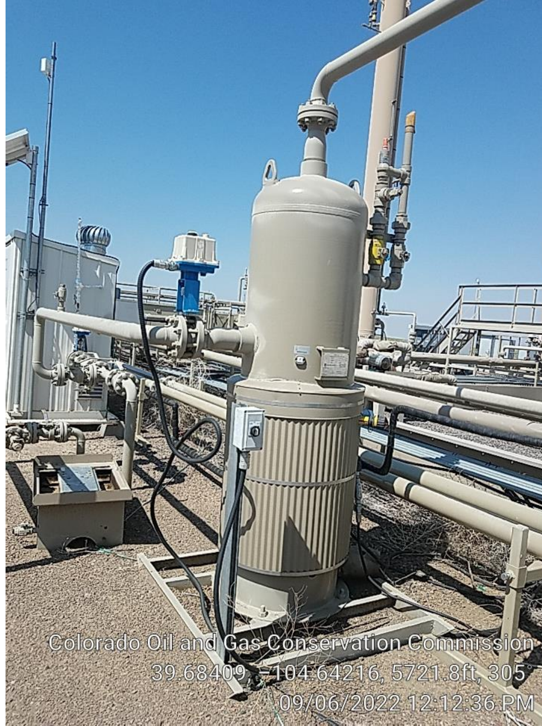
Gas scrubber to GMR.

Colorado Oil and Gas Conservation Commission 39.68409, -104.64216, 5721.8ft, 305° 09/06/2022 12:12:36 PM