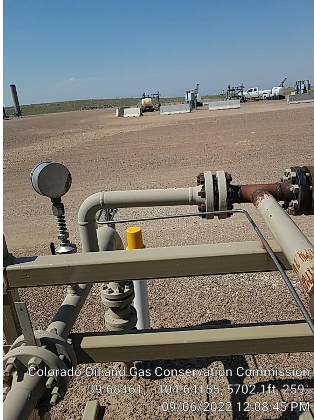
Buried flowline marker at compressor.

Colorado Oil and Gas Conservation Commission 39.68461, -104.64155, 5702.1ft, 259° 09/06/2022 12:08:45 PM