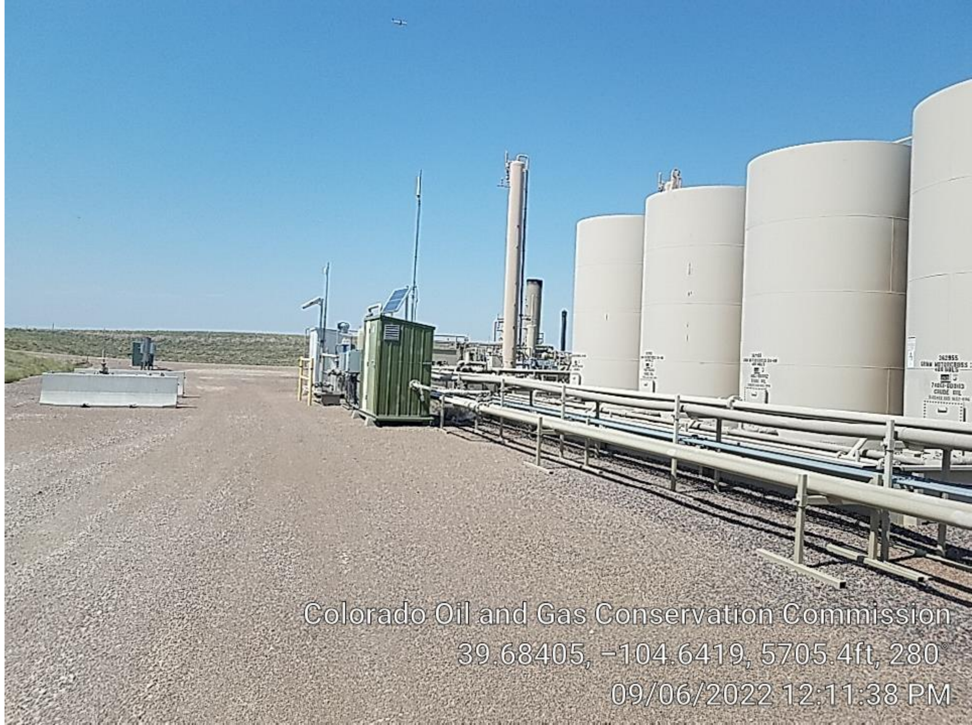
Gas meter sheds.

Colorado Oil and Gas Conservation Commission 39.68405, -104.6419, 5705.4ft, 280° 09/06/2022 12:11:38 PM