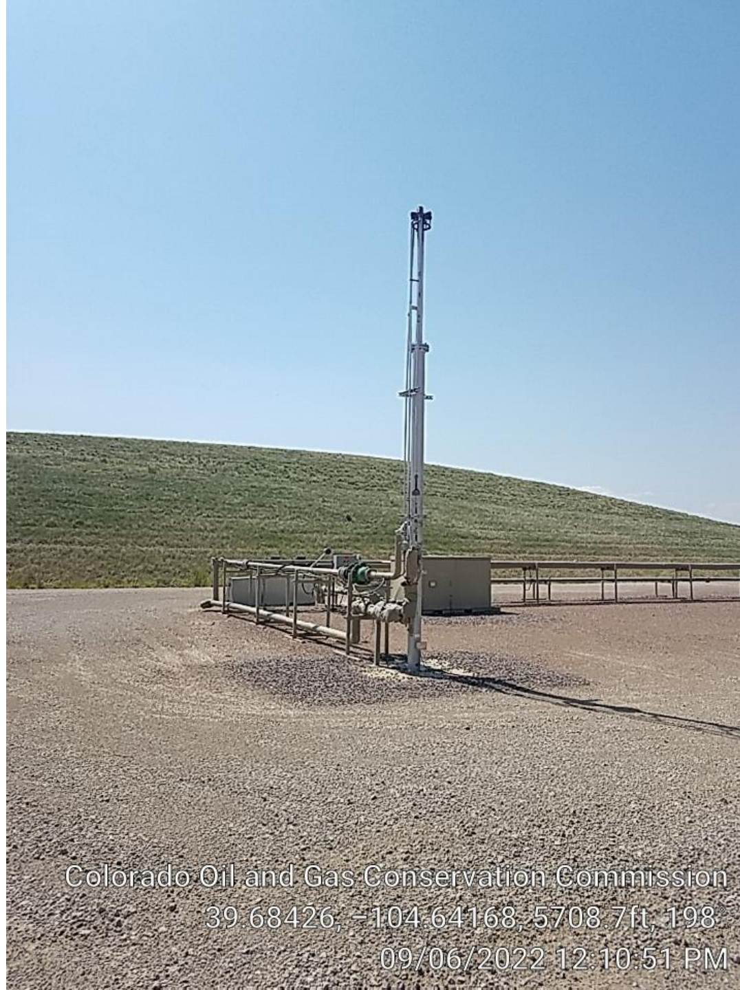
Flare with FWKO.

Colorado Oil and Gas Conservation Commission 39.68426, -104.64168, 5708.7ft, 198 09/06/2022 12:10:51 PM