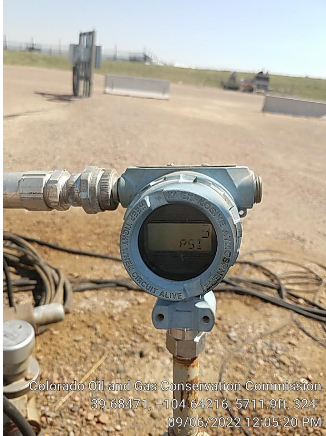
Sunset bradenhead 3 psi.

Colorado Oil and Gas Conservation Commission 39.68471, -104.64216, 5711.9ft, 324° 09/06/2022 12:05:20 PM