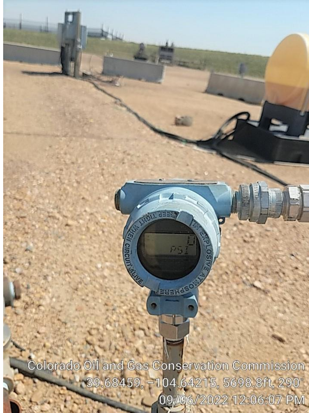
Grimm Motocross bradenhead 0 psi.

Colorado Oil and Gas Conservation Commission 39.68459, -104.64215, 5698.8ft, 290° 09/06/2022 12:06:07 PM