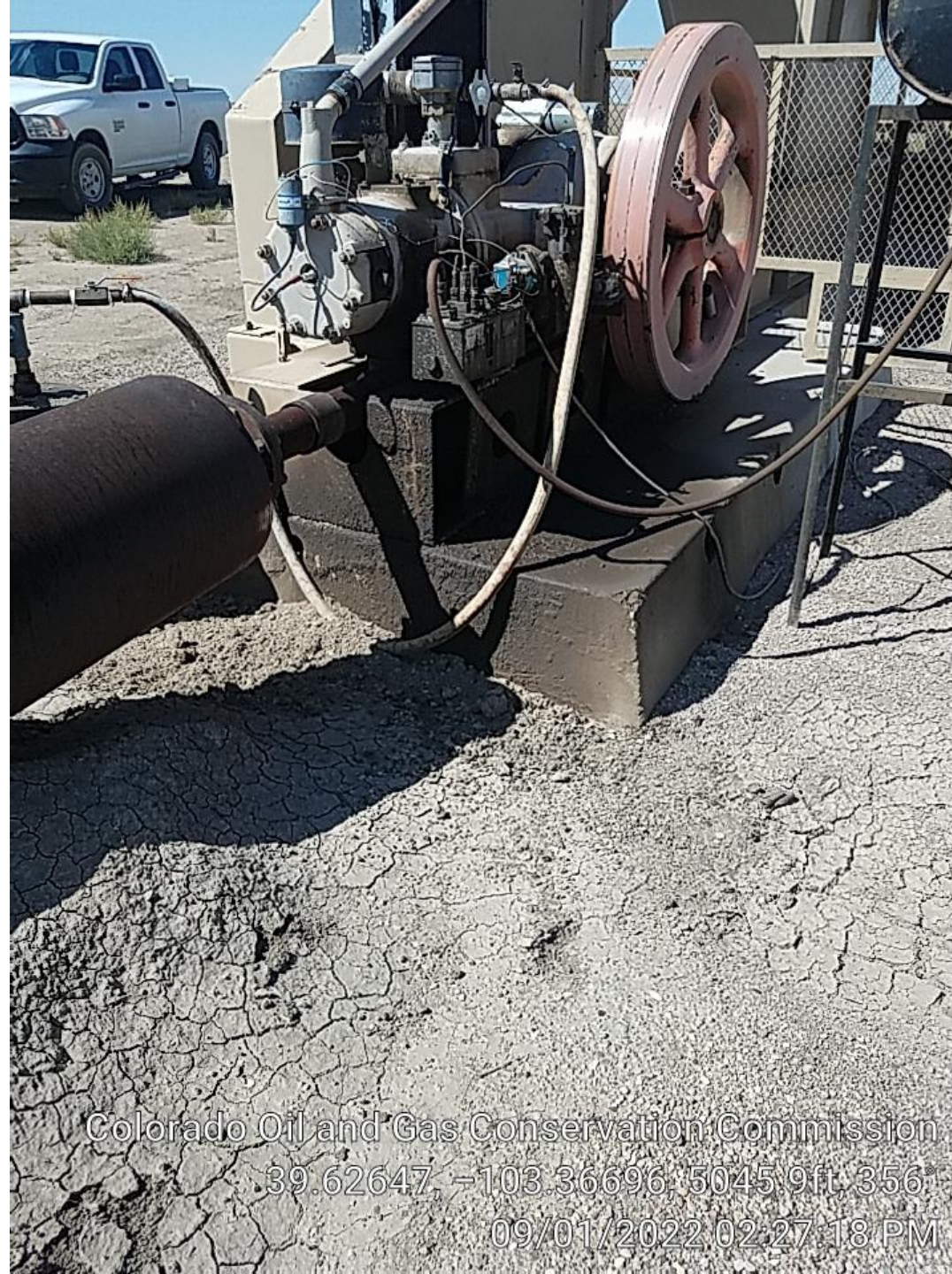
Engine leaking oil.

Colorado Oil and Gas Conservation Commission 39.62647, -108.36696, 5045.9ft, 356° 09/01/2022 02:27:18 PM