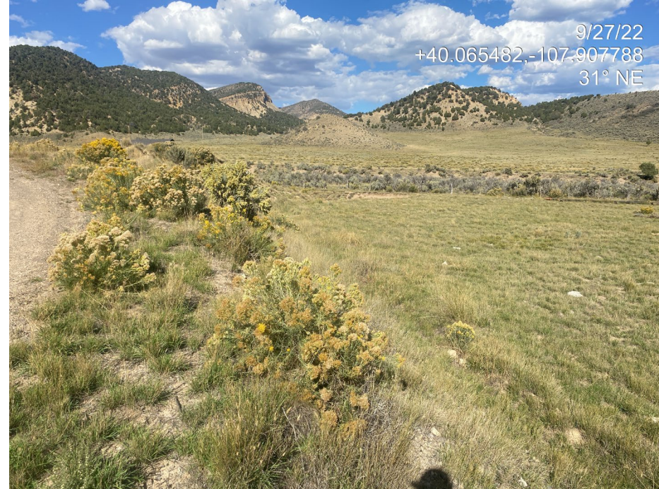
Photo 13. Photo taken from the southeast of the Location shows the transition from the fill slope to an adjacent field below; Location has not been contoured to fit the surrounding landscape. Note also access road remaining (left).