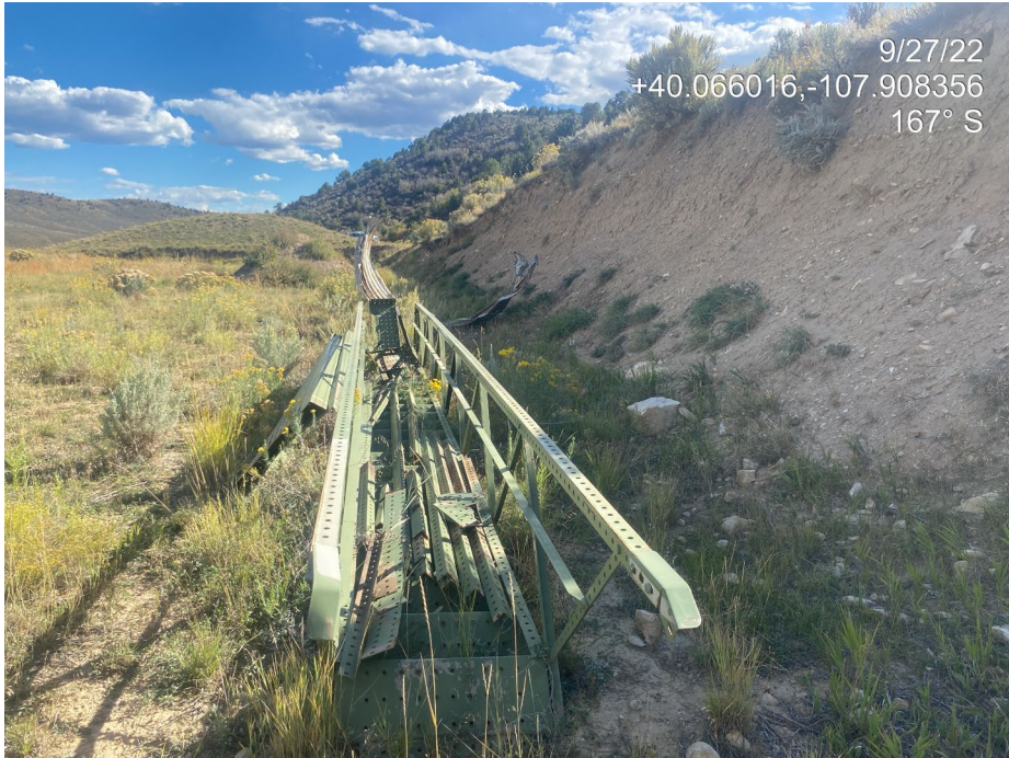
Photo 7. Photo taken from the west of the Location shows equipment/debris remaining. Note also the eroding cut slope and flat pad.