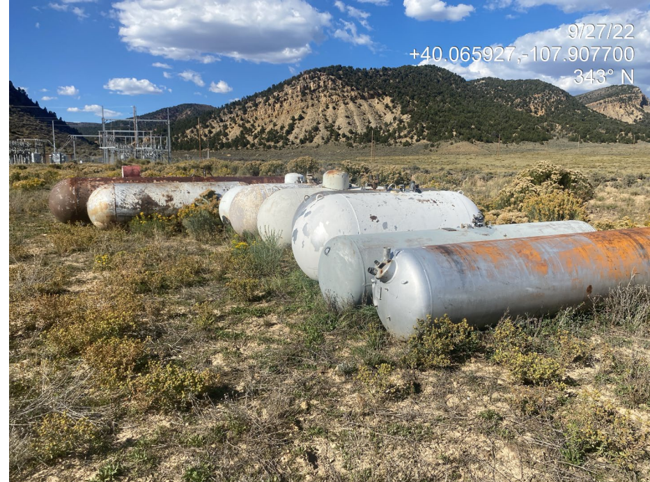
Photo 4. Photo taken from the southeast shows an example of multiple tanks present on Location.