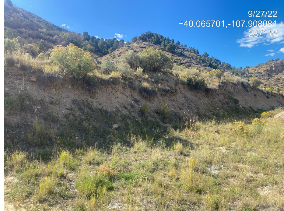
Photo 10. Photo taken from the west shows the eroded cut slope.