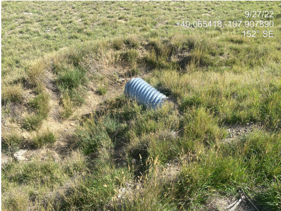
Photo 12. Photo taken from the southeast shows the access road culvert remains.