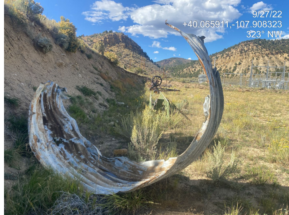
Photo 8. Photo taken from the west of the Location shows equipment/debris remaining. Note also the eroding cut slope and flat pad.