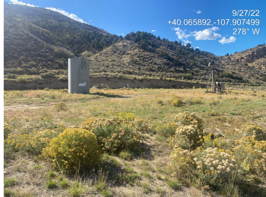
Photo 2. Photo taken from the southeast shows an overview of the northern portion of the Location.