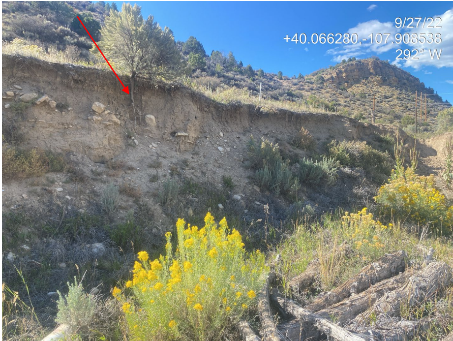
Photo 9. Photo taken from the west shows the eroded cut slope. Note undermining and exposed roots (red arrow).