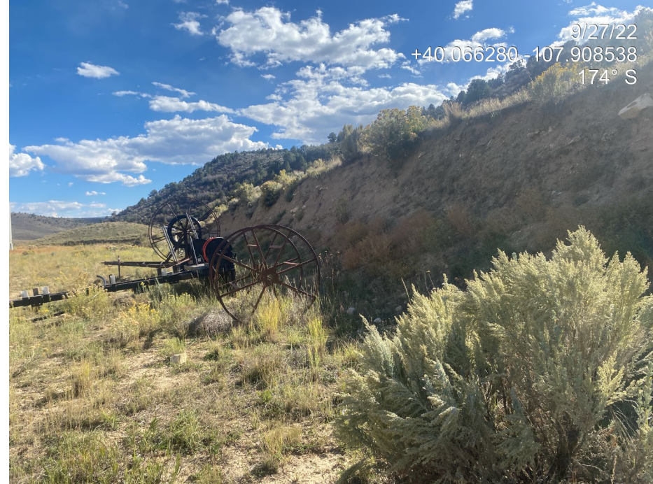
Photo 6. Photo taken from the north of the Location shows equipment remaining. Note also the eroding cut slope (right) and flat pad (left). The Location must be recontoured to fit with the surrounding landscape.