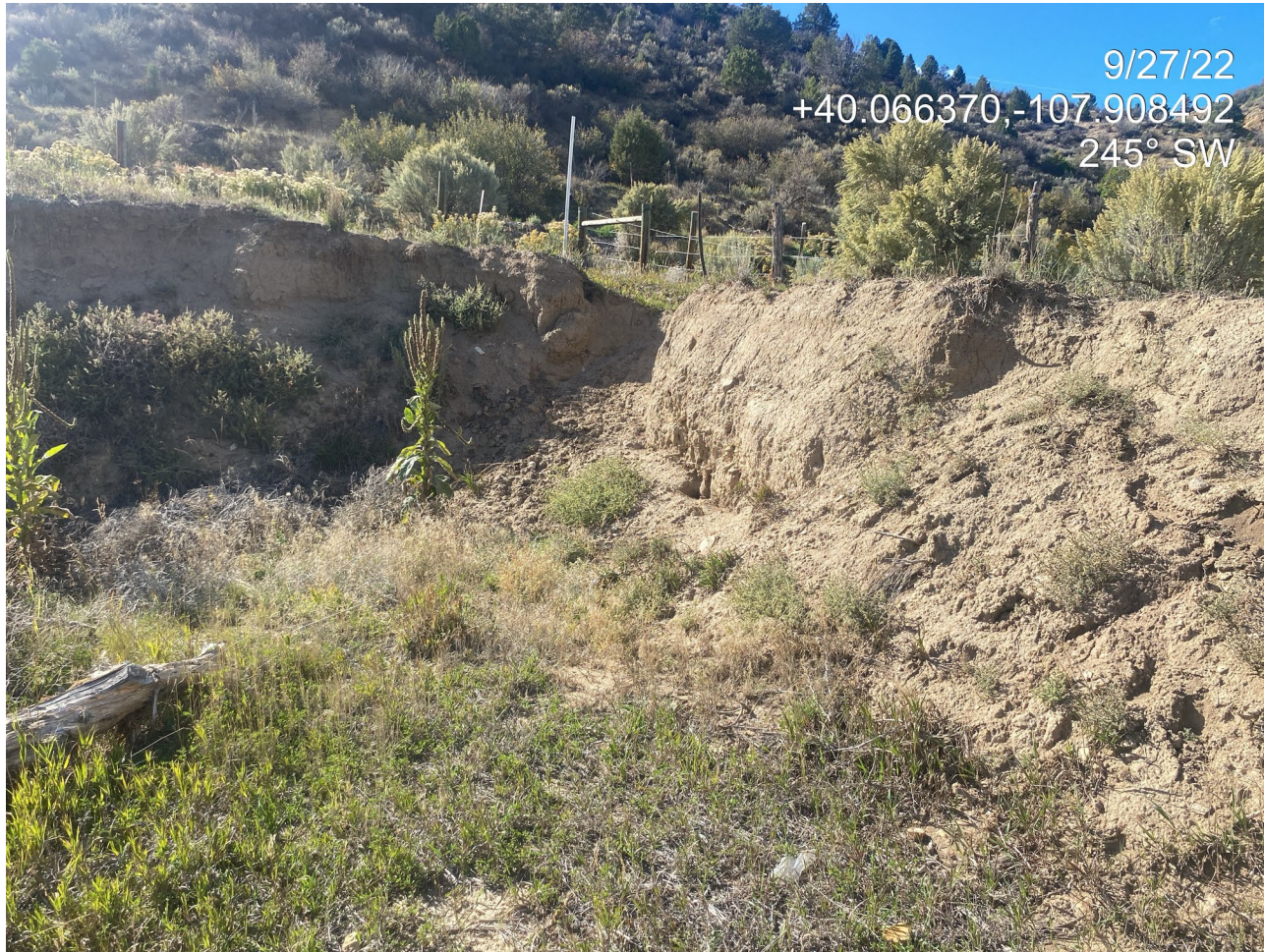
Photo 11. Photo taken from the northwest shows the eroding cut slope.