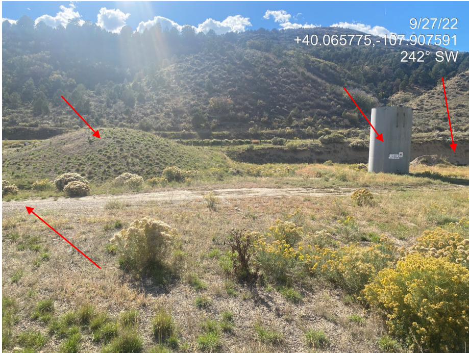
Photo 1. Photo taken from the southeast shows an overview of the southern portion of the Location. Note soil stockpile, cut slope, access road and tank remain. Final Reclamation has not been performed.