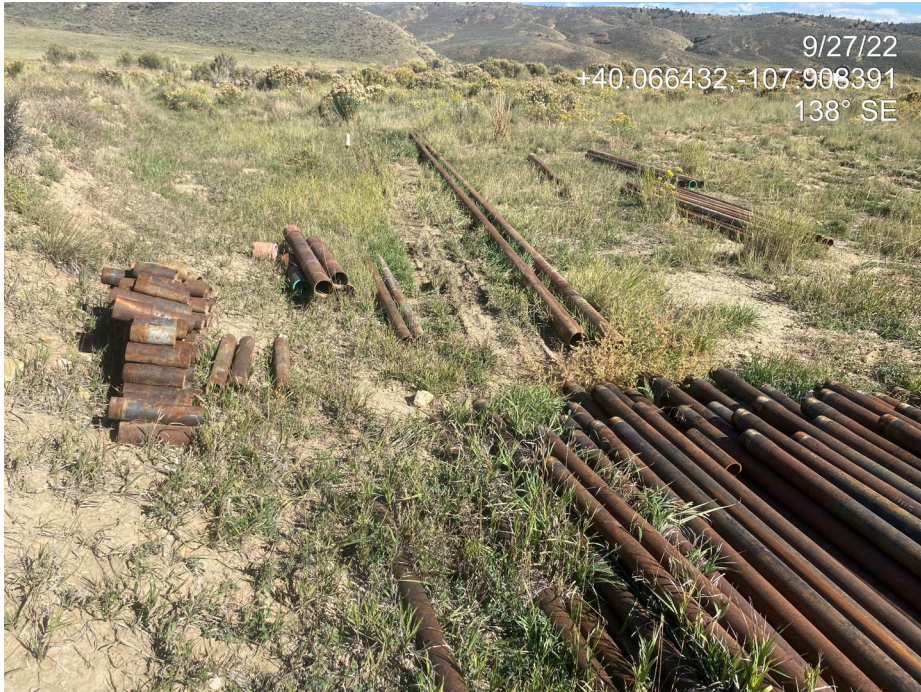
Photo 5. Photo taken from the north of the Location shows equipment remaining.