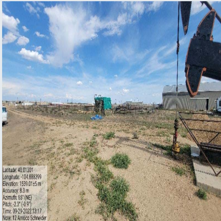
General Site - 1