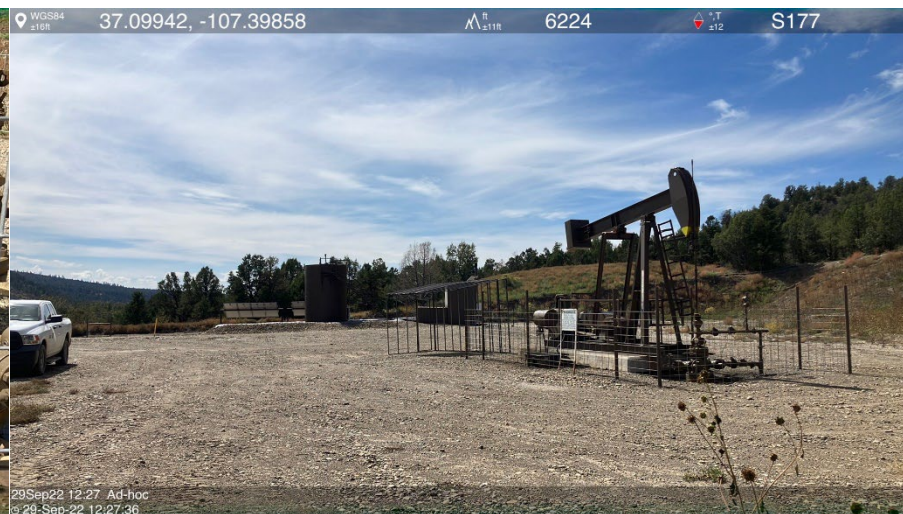
IMG 02 Location overview