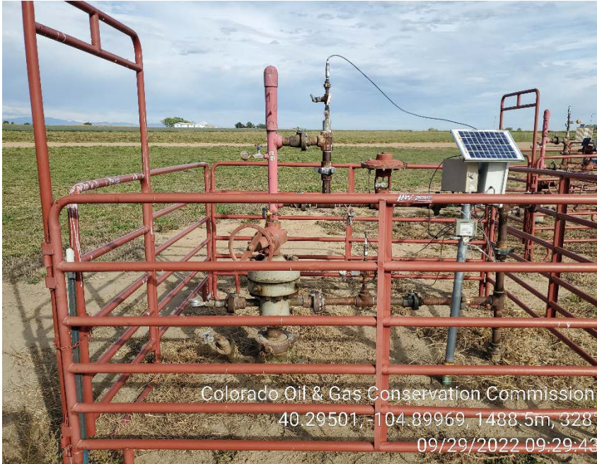
Walters 21LDU wellhead lacking sign