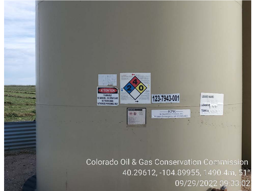
Crude oil contents and capacity placards