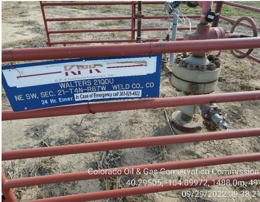
Walters 21DQU wellhead