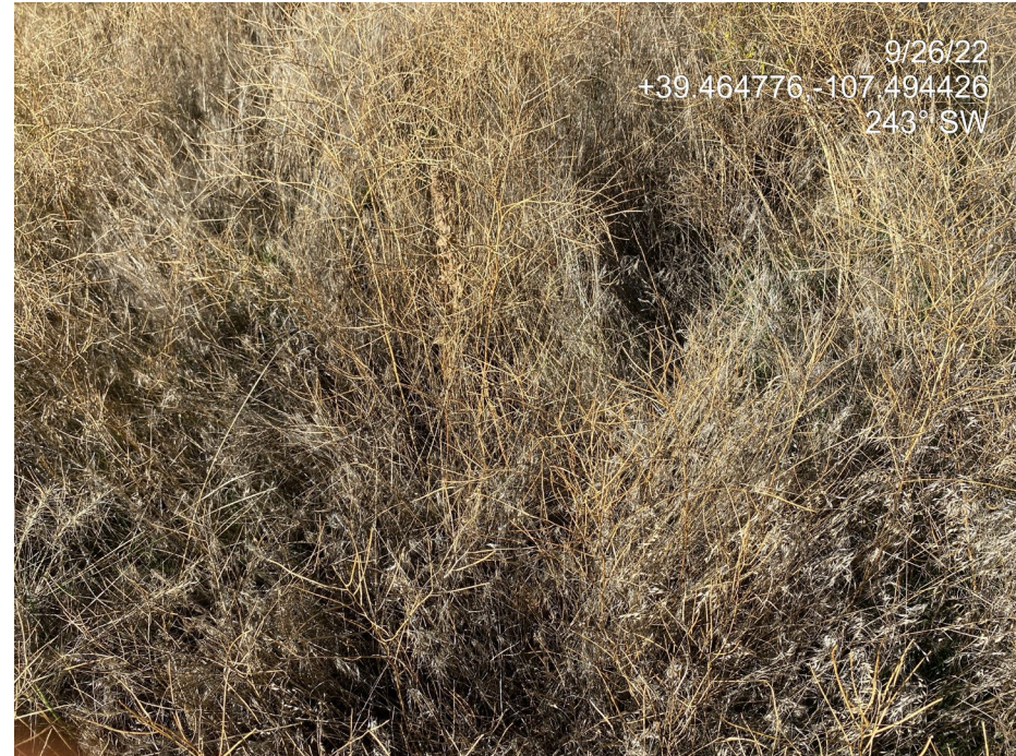
Photo 6. Photo taken from the north of the Location shows a portion of the Location without perennial establishment and dominated by annual weeds, including cheatgrass (List C Noxious).