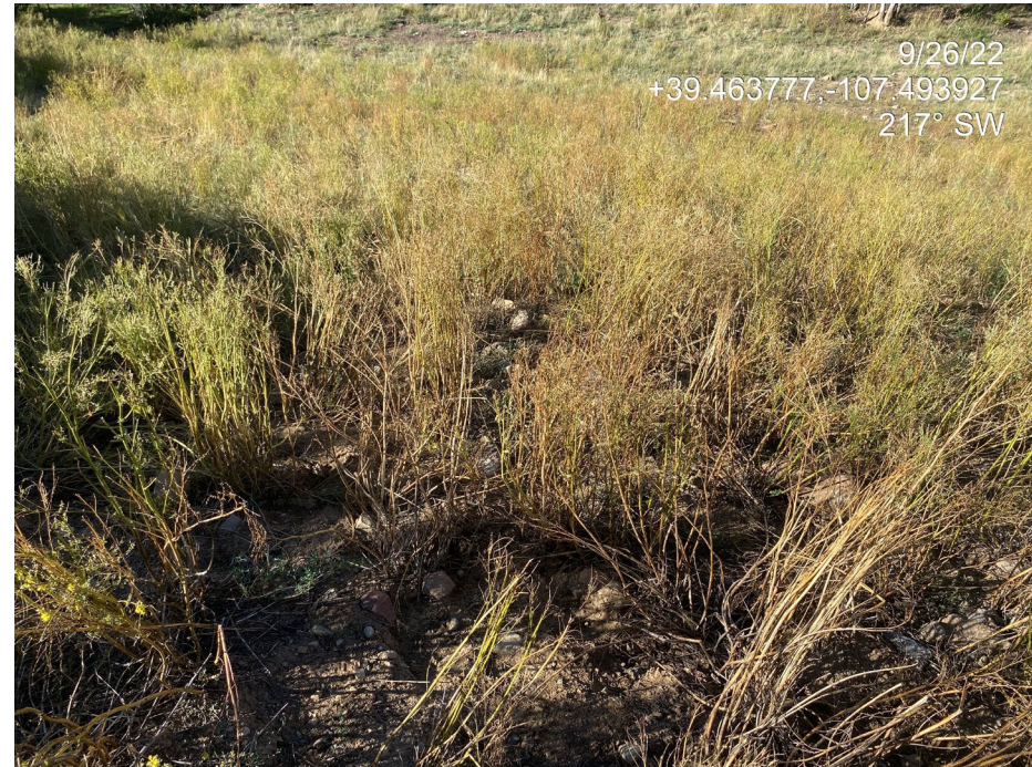
Photo 8. Photo shows an example of an area of the Location where yellow sweet clover, a biennial dominates. Perennial species are established but fairly sparse.