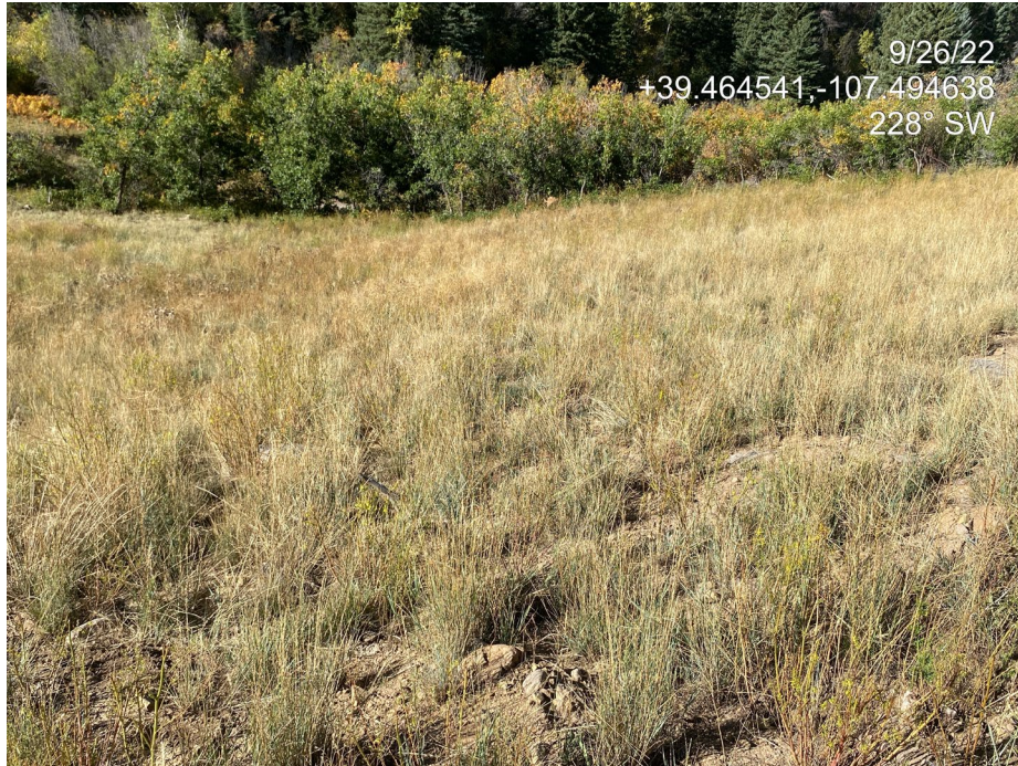
Photo 7. Photo shows an example of an area of the Location where perennial species are well established.