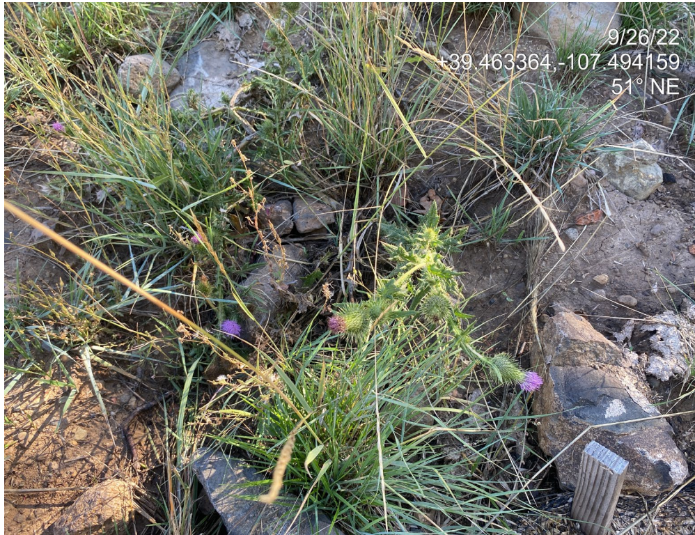
Photo 3. Photo shows an example of bull thistle (List B Noxious) found occasionally throughout the Location.