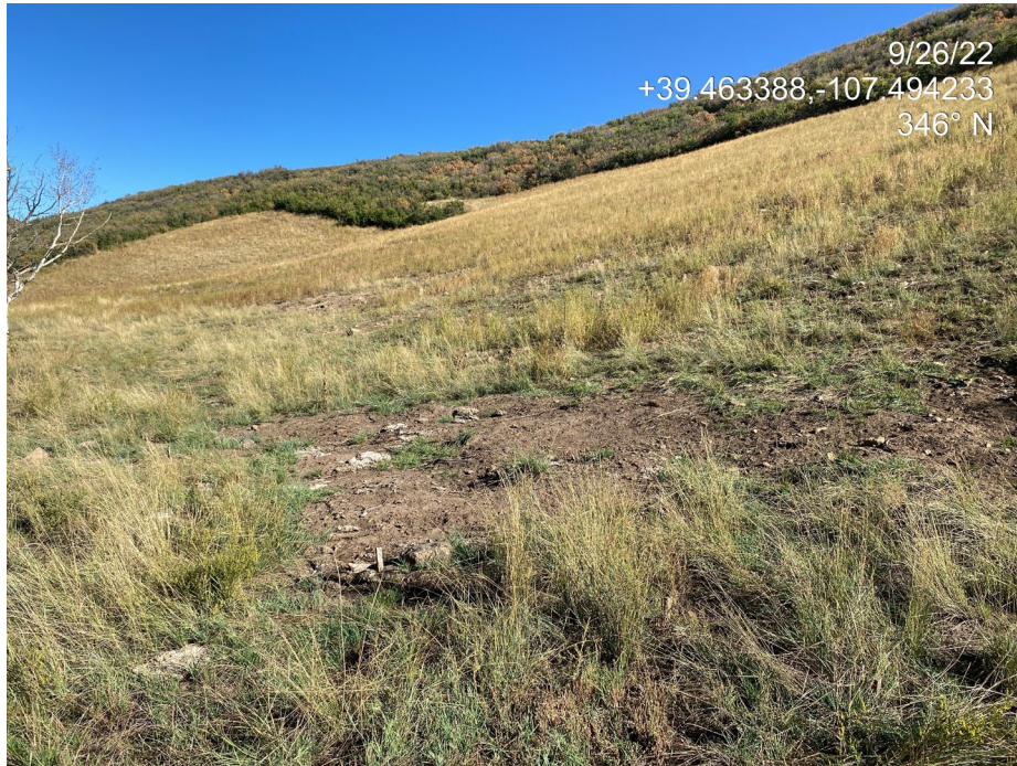
Photo 1. Photo taken from the south shows an overview of the reclaimed Location.