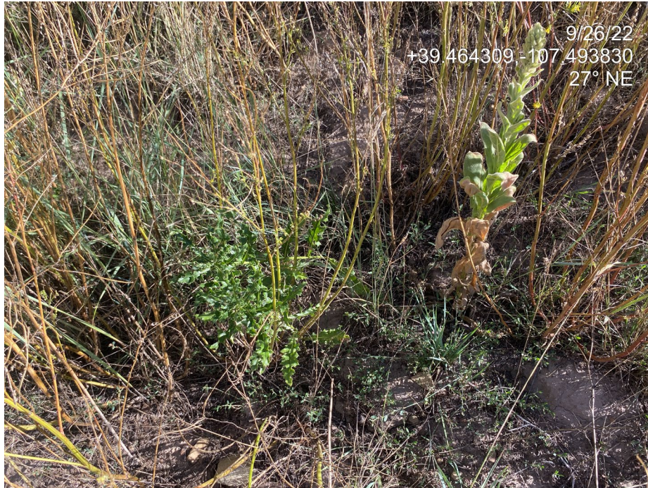
Photo 5. Photo shows an example of Canada thistle (List B Noxious) and mullein (List C Noxious) found occasionally throughout the Location.