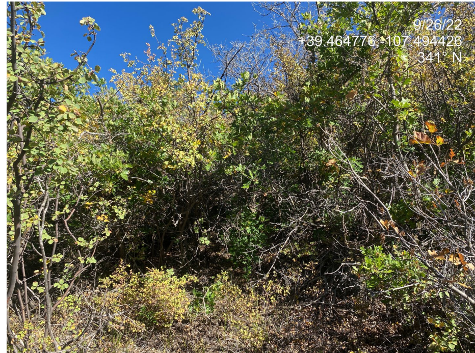
Photo 9. Photos taken to the east and north of the Location show examples of reference area vegetation.