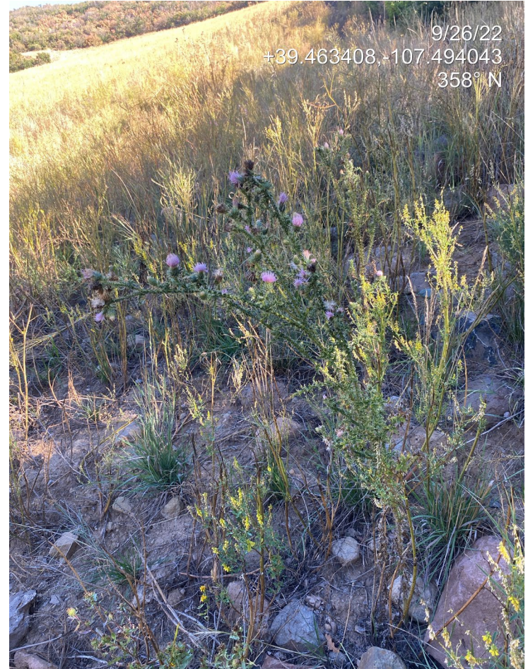
Photo 4. Photo shows an example of plumeless thistle (List B Noxious) found occasionally throughout the Location.