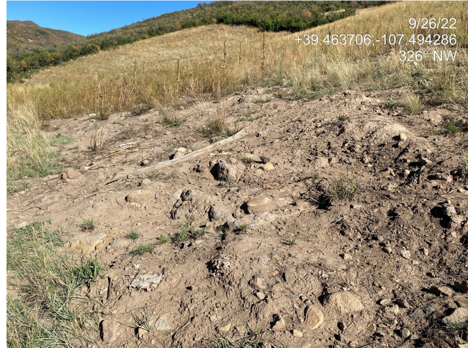
Photo 2. Photo taken from the southwest show a portion of the Location where perennial establishment is low and bare ground is common.