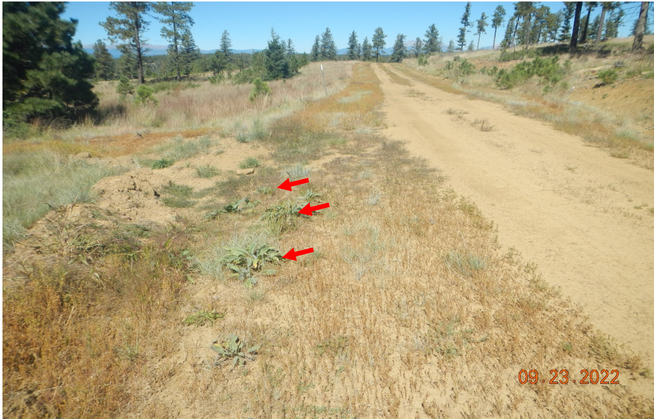
Photo 2. There are noxious weeds along the access road that need to be controlled. The red arrow points to Houndstongue which is a biennial. The leaves shown are the first year growth and is a good time for control. Previous corrective action was not completed.