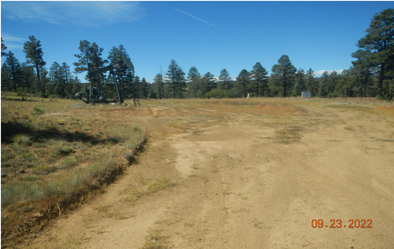
Photo 3. Facing northwest toward the wellsite.