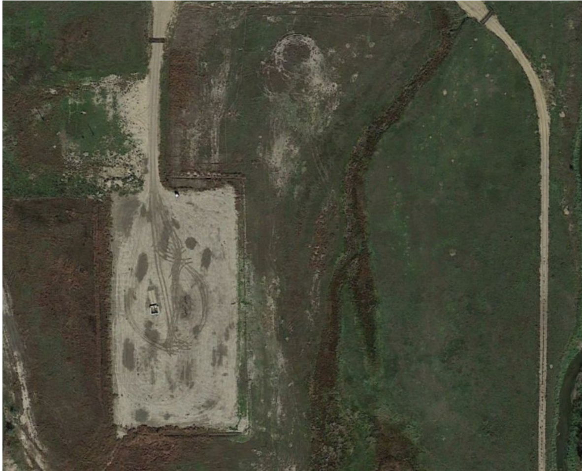
Photo 1. Google Earth aerial imagery from 10/6/2013 illustrates that Kerr McGee was the last to disturb the shared well location. The KPK well was installed back in the early 1980's while the Kerr McGee wells were installed in 2011.