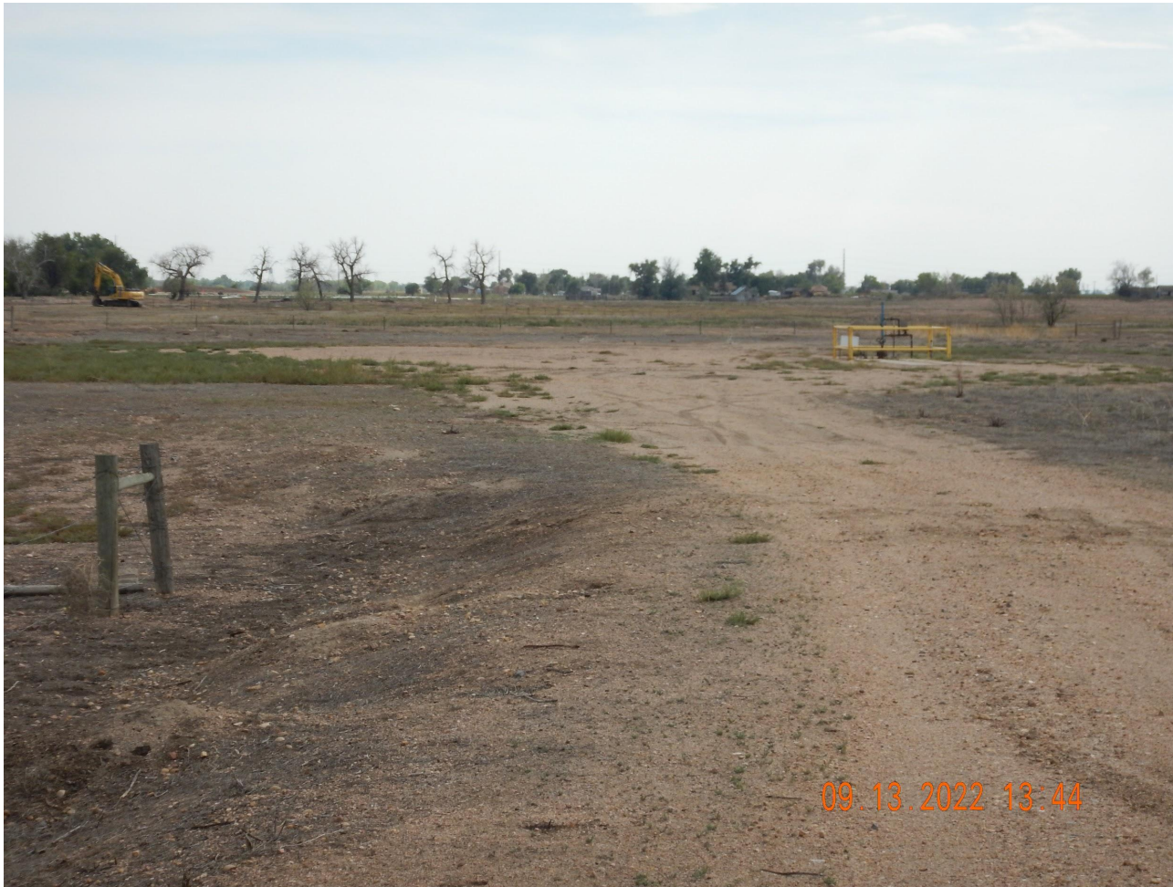
Photo 3. Photo taken north of the location, facing South. Photo illustrates the remaining KPK well. Kerr McGee will be responsible for the area described in Photo 1.