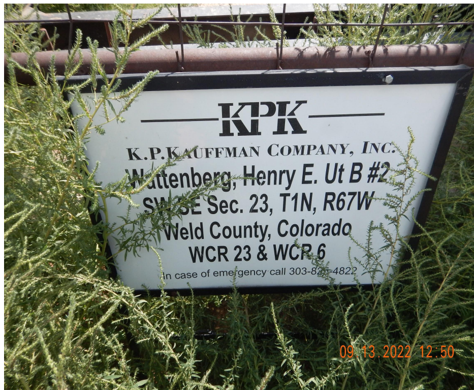
Photo 1. Photo illustrates the Operator sign.