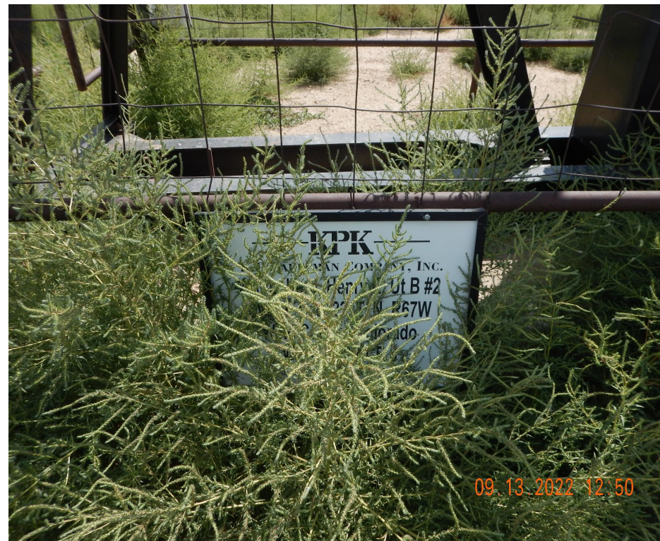
Photo 2. Photo illustrates the Operator sign obstructed by weeds.