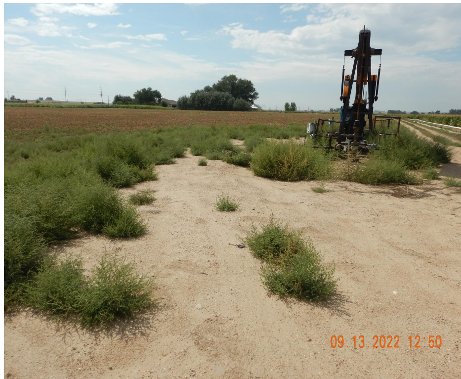
Photo 3. Photo taken from the well location, facing West. See comments under Photo 2.