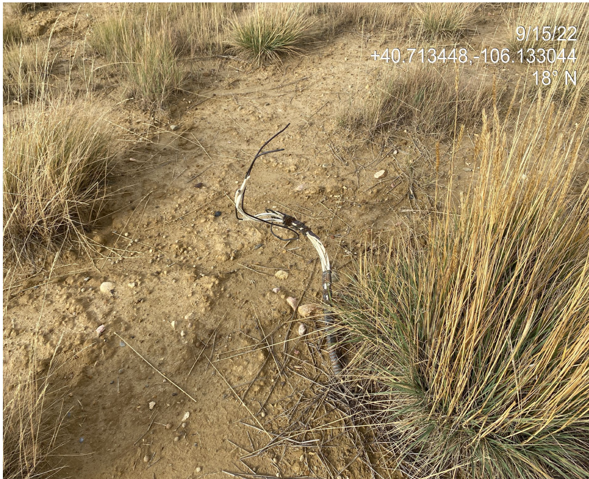
Photo 5. Photo shows a wire coming out the ground at the west of the Location.