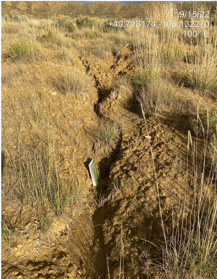
Photo 6. Photo shows erosion occurring at the southeast of the Location.