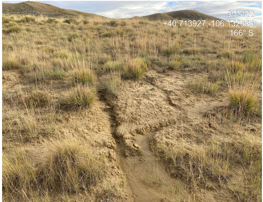
Photo 7. Photo shows erosion occurring at the north of the Location.