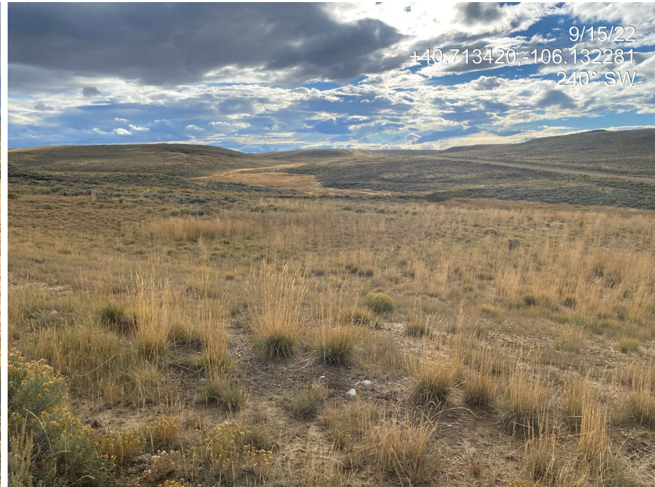
Photo 2. Photo shows an overview of the Location.