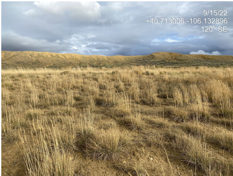
Photo 10. Photo shows the plant community on Location is dominated by seeded perennial grasses.