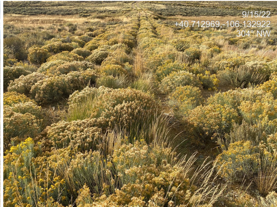
Photo 4. Photo shows the access road from county road 12E to the southeast of the Location.