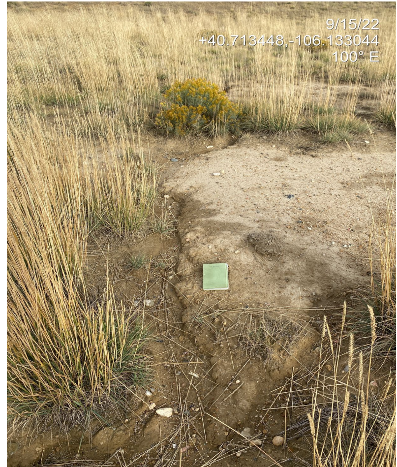
Photo 9. Photo shows erosion occurring at the west of the Location.