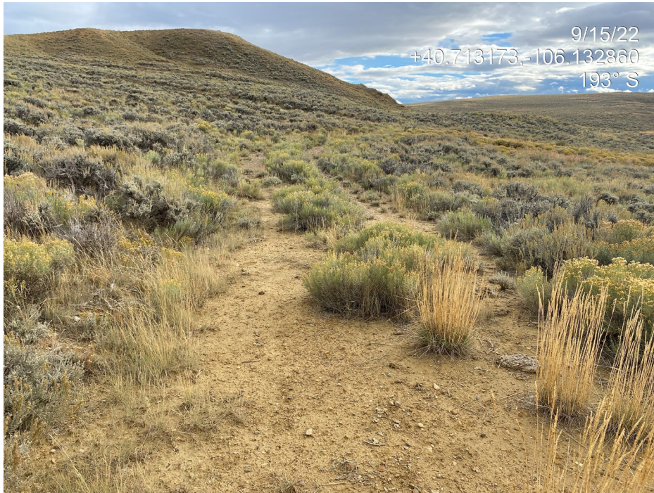
Photo 3. Photo shows the direct Location access road to the south.