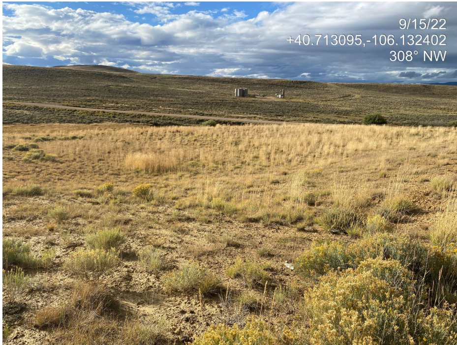
Photo 1. Photo shows an overview of the Location.