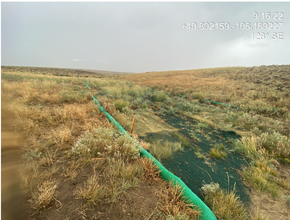
Photo 5. Photo taken from access road swale. Stormwater BMPs have been installed per good engineering practices. Photo also shows perennials (green plants) are well established on portions of the road and poorly established in other areas, where bare ground or cheatgrass (tan plants) dominate.