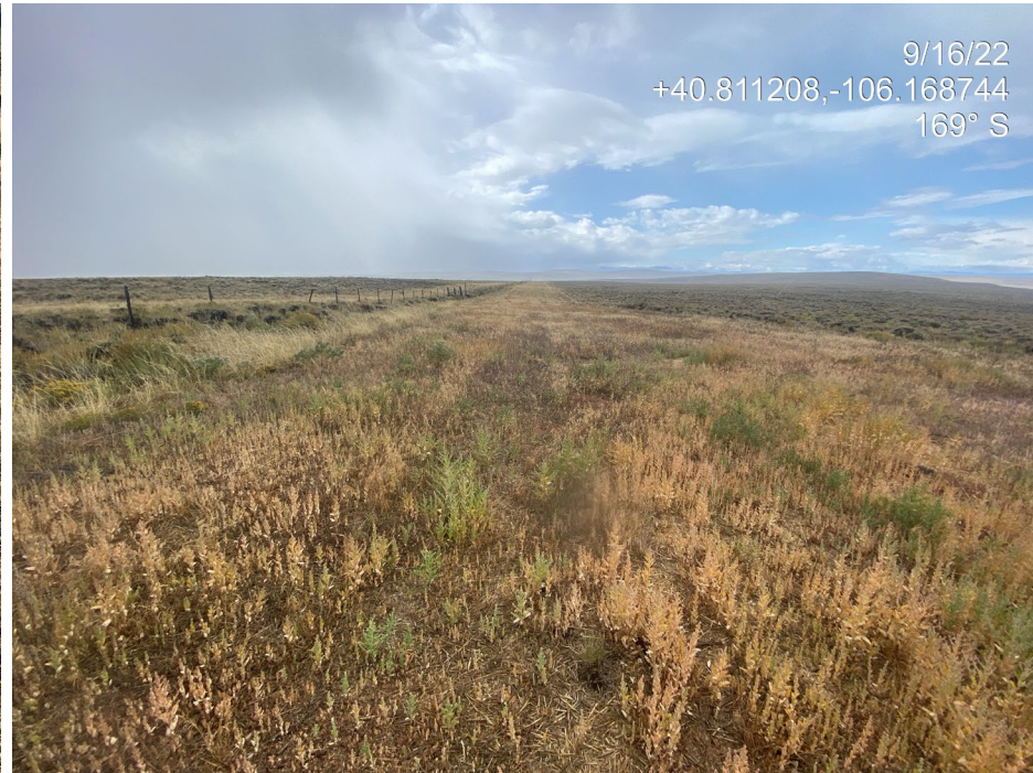
Photo 2. Photo shows the northern portion of the Location access road. The vegetation community is dominated by tumbling saltweed (annual, undesirable plant species/weed). Perennial grasses are sparse.