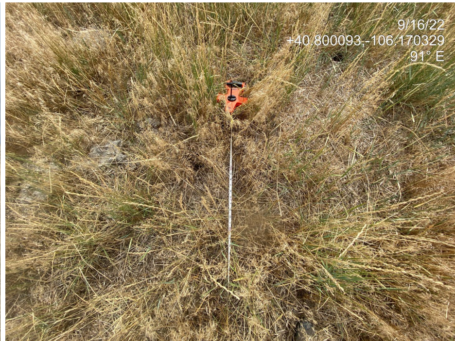
Photo 12. Photo taken from the north shows the ground surface at the end of the disturbed area vegetation monitoring transect.