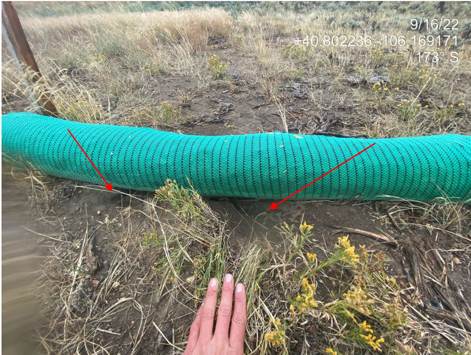
Photo 3. Photo taken from the location access road shows where water is beginning to undercut a wattle.