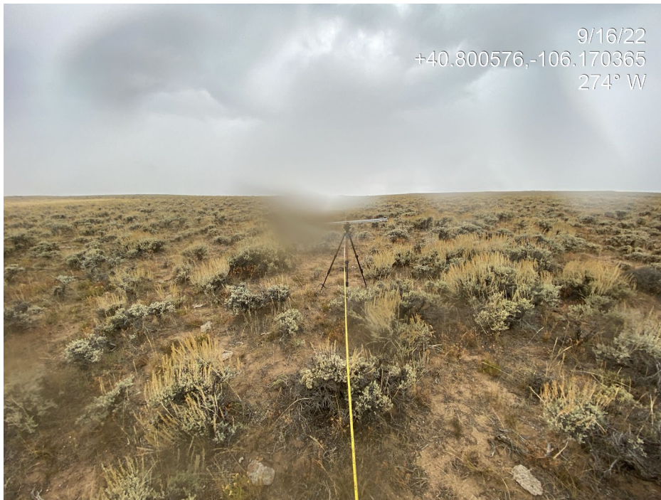
Photo 15. Photo taken to the north of the Location shows the end of the reference area vegetation monitoring transect.