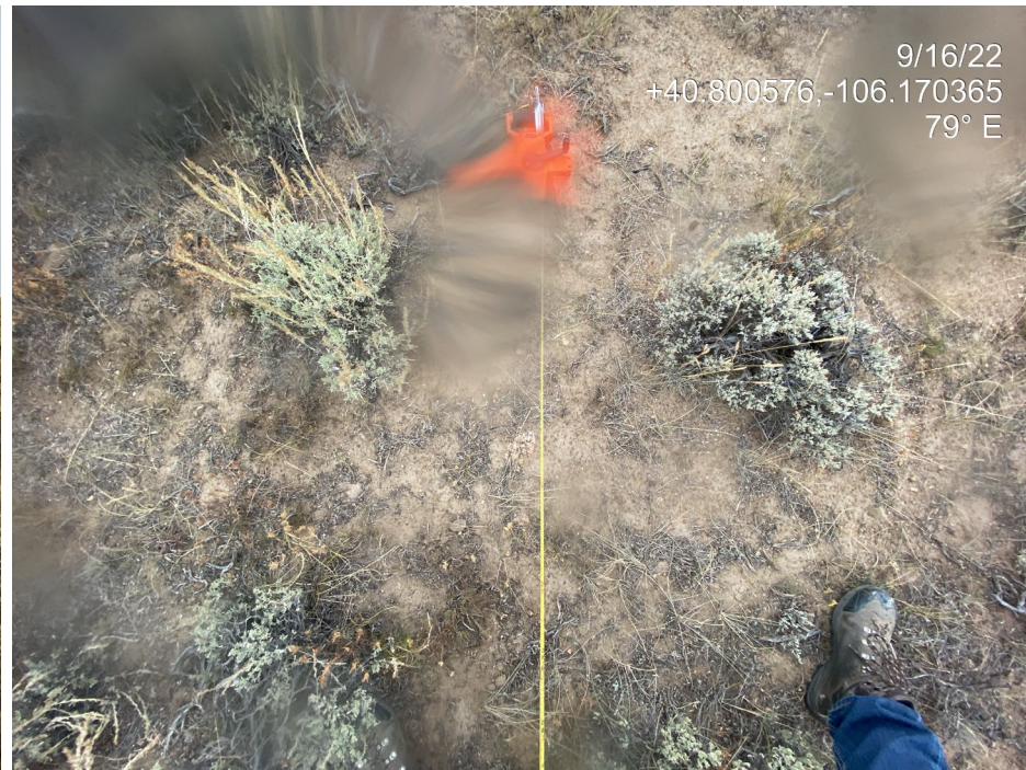
Photo 16. Photo taken to the north of the Location shows the ground surface at the end of the reference area vegetation monitoring transect.