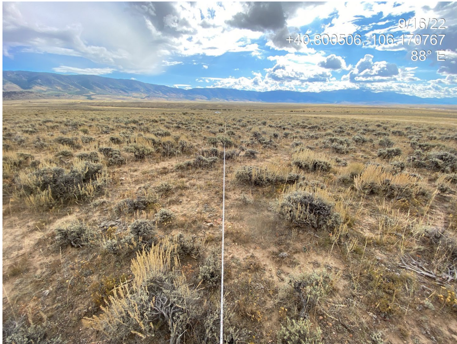
Photo 13. Photo taken to the north of the Location shows the start of the reference area vegetation monitoring transect.