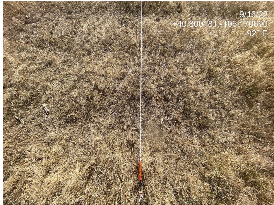
Photo 10. Photo taken from the northwest shows the ground surface at the start of the disturbed area vegetation monitoring transect.