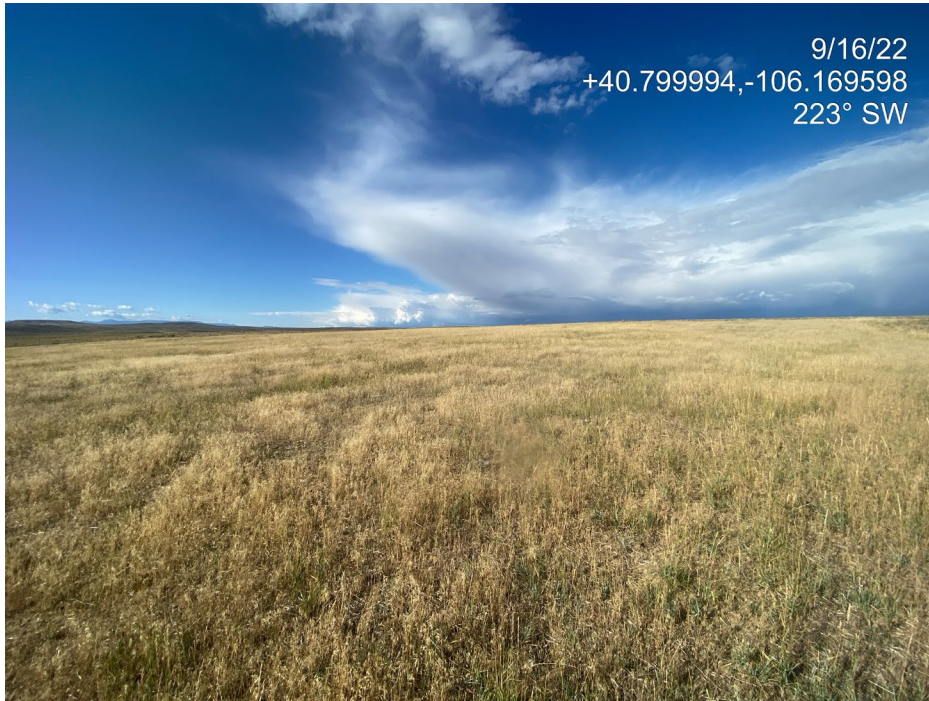
Photo 7. Photo taken from the east shows an overview of the reclaimed Location.