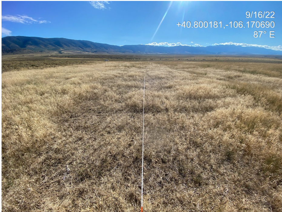
Photo 9. Photo taken from the northwest shows the start of the disturbed area vegetation monitoring transect.