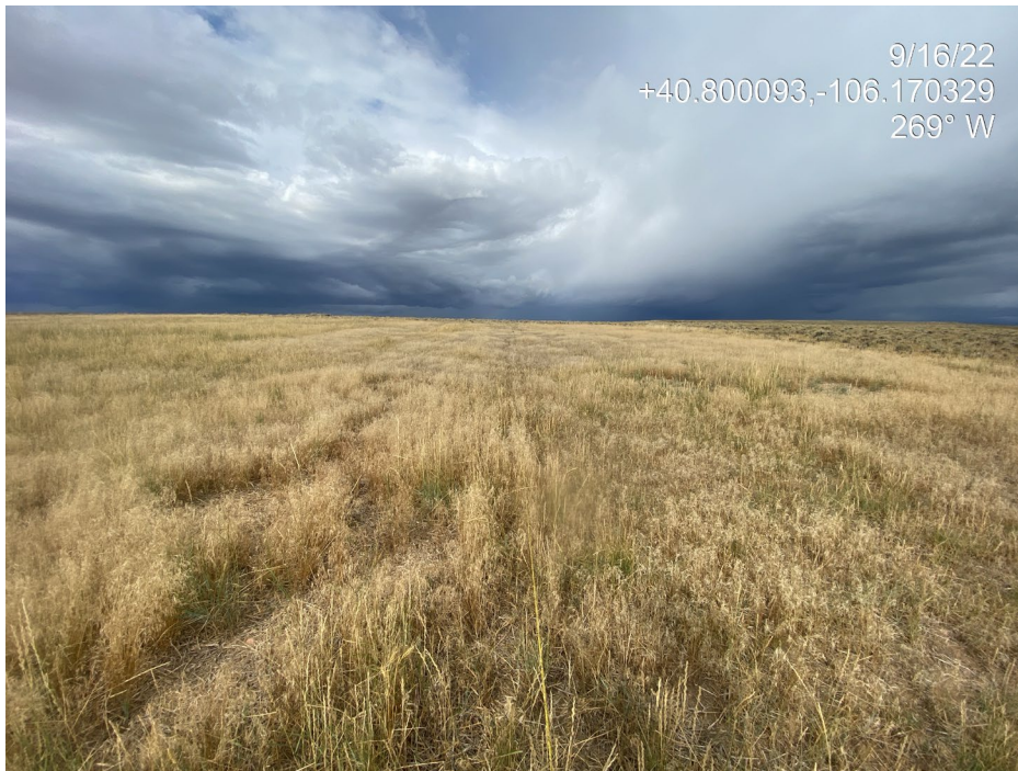
Photo 11. Photo taken from the north shows the end of the disturbed area vegetation monitoring transect.