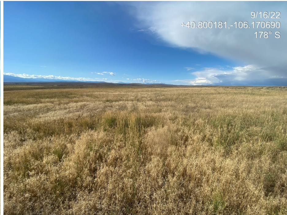
Photo 8. Photo taken from the northwest shows an overview of the reclaimed Location.