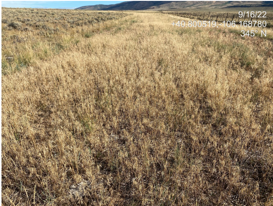
Photo 1. Photo shows the southern portion of the Location access road. The vegetation community is dominated by cheatgrass (List C Noxious Weed). Perennial grasses are subdominant.