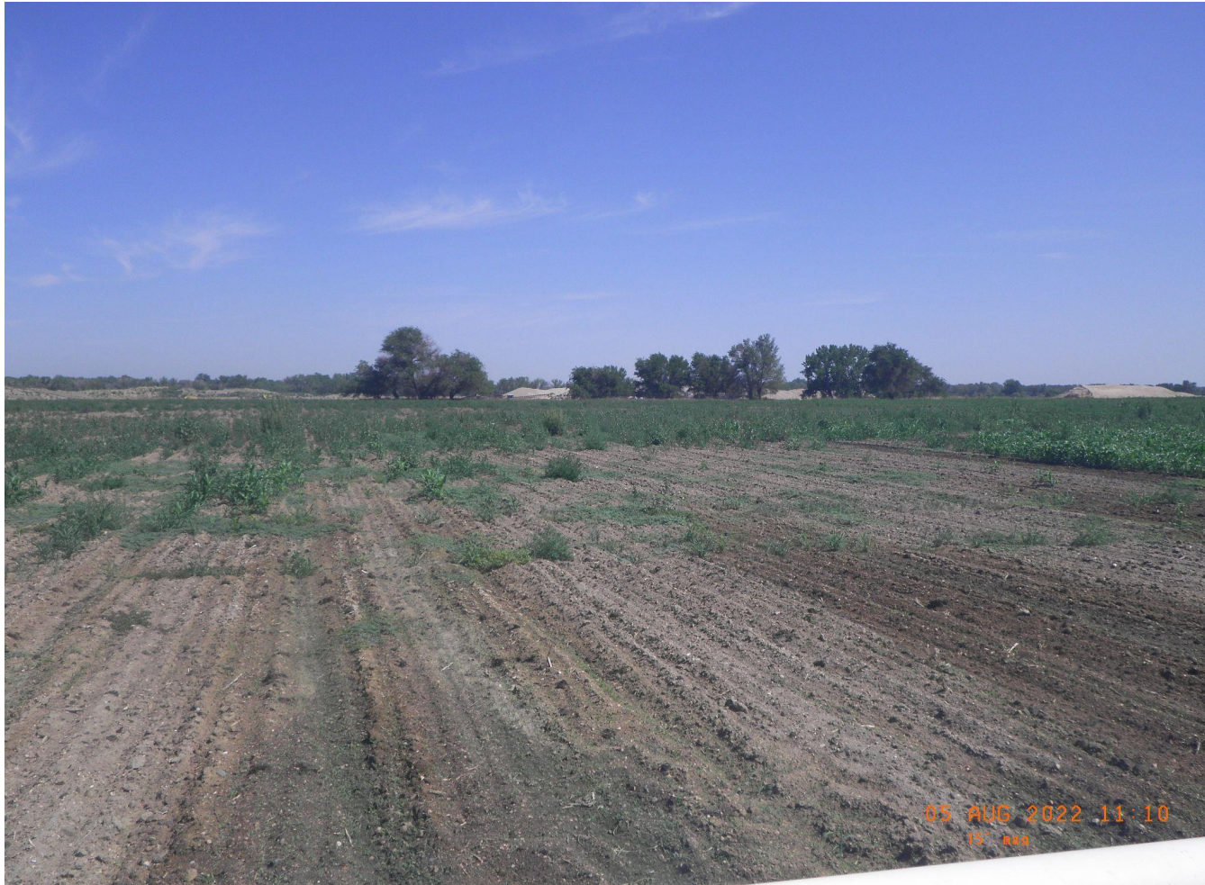
Photo 2. Overview photo of the well pad that falls within a fallow field. Site status will remain in-process until the location is planted and re-inspected.