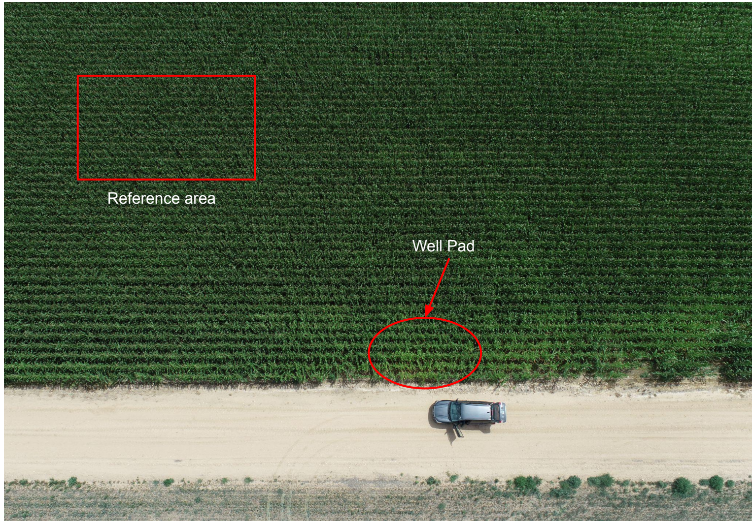
Photo 2. Overview photo the well pad and reference area taken from directly above the well disturbance using a drone. Note: well pad appears consistent with adjacent crop reference.