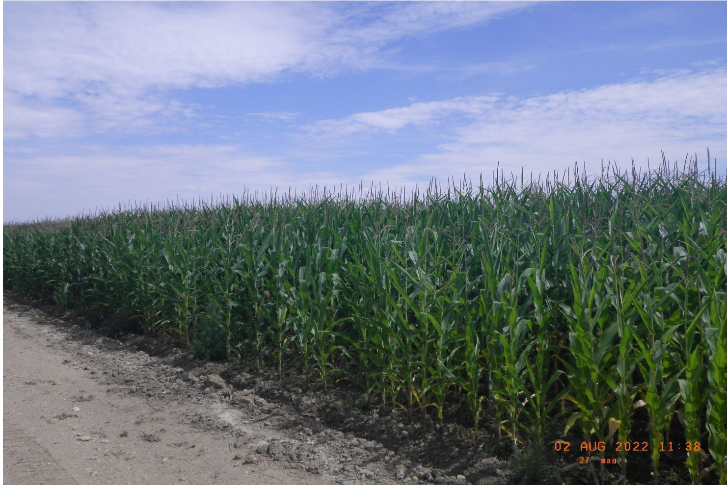
Photo 3. Overview photo of the well pad crop field taken at ground level from the western edge of the field facing east.