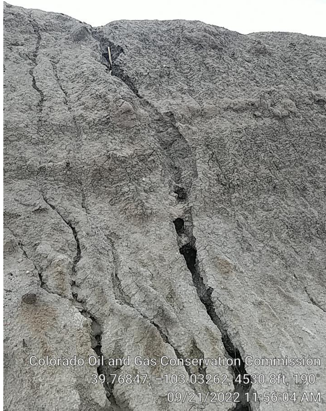
North wall of east pit.

Colorado Oil and Gas Conservation Commission 39.76847, -103.03262, 4530.8ft, 190° 09/21/2022 11:56:04 AM