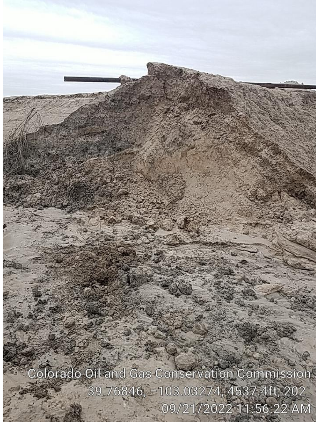
East pit breach measured at 9.5'.

Colorado Oil and Gas Conservation Commission 39.76846, -103.03274, 4537.4ft, 202° 09/21/2022 11:56:22 AM